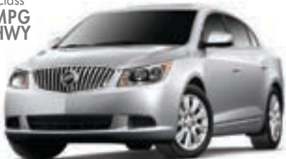
2012 BUICK LACROSSE with Convenience Group & eAssist

LOW-MILEAGE LEASE FOR WELL-QUALIFIED LESSEES