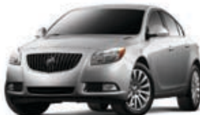
2012 BUICK REGAL TURBO with Premium 1 Group

No security deposit required. Tax, title, license and dealer fees extra. Mileage charge of $.20/mile over 24,000 miles.