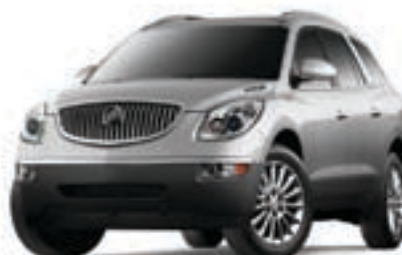
2012 BUICK ENCLAVE

No security deposit required. Tax, title, license and dealer fees extra. Mileage charge of $.20/mile over 24,000 miles.