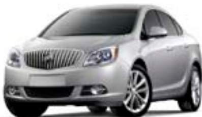
2012 BUICK VERANO

SPECIAL 24-MONTH LEASE INCLUDING PREMIUM SERVICES FOR ONE SIMPLE MONTHLY PAYMENT