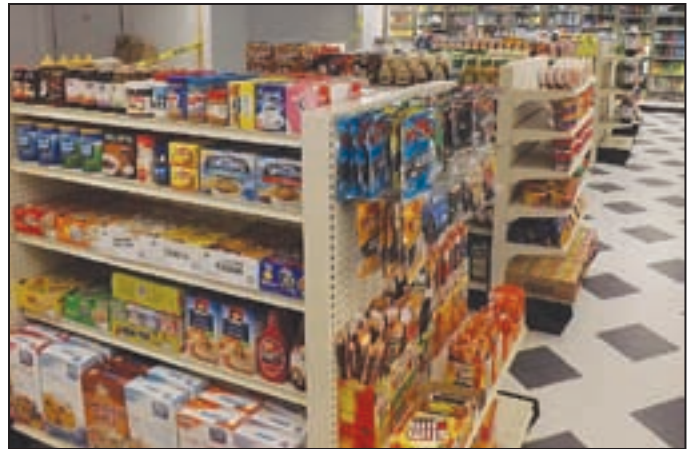
The completely renovated College Convenience Store has opened in Heniker at the former Pop Schult's location.