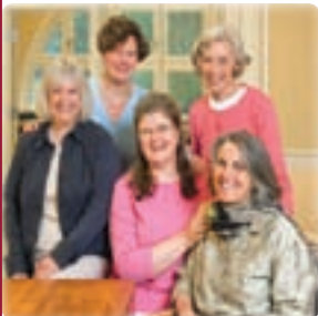
HCS Hospice Team

When your life's journey is measured in short, precious months, make sure you have your HOSPICE at HCS team with you. HOSPICE at HCS services are available at home and in all area extended care facilities—just ask. It is our honor and privilege to be here for you and your family when the time comes, wherever "home" is.