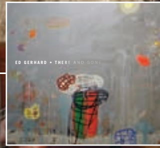
THERE AND GONE The New Album from Ed Gerhard is here! Order your copy today at edgerhard.com