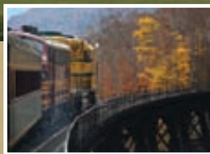
Autum Express – Oct 19 The last Notch Train of the 2014 season