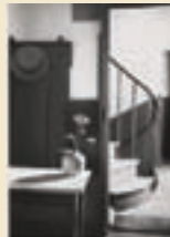
Chez Mondrian , by Andre Kertesz, 1926, gelatin silver print.

Photographs spanning the history of photography, from studies of animal locomotion to contemporary prints (organized by the Kalamazoo Institute of Arts, Kalamazoo, Michigan).