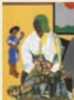
Meckenberg Autumn , by Romare Bearden, 1979, lithograph.

Explores the diversity of experience and expression among American Artists of African descent through painting, photography, sculpture, book arts, and prints (organized by the Kalamazoo Institute of Arts, Kalamazoo, Michigan).