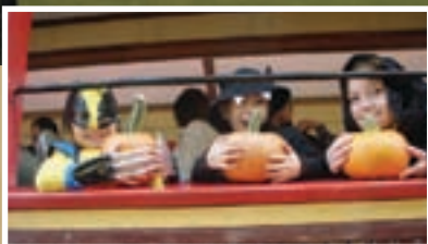
Pumpkin Patch Express Oct 17-19 & 24-26

October is an EVENTFUL month at the Railroad!