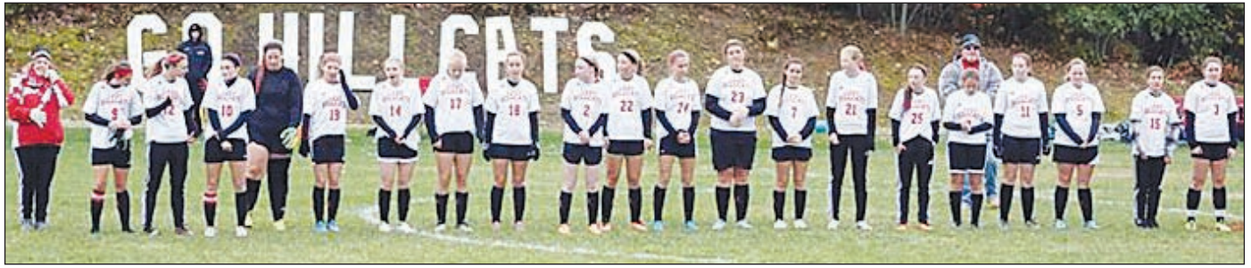
The Lady Hillcats are 14-0 heading into Thursday's game against Campbell.