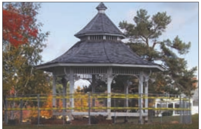
Repairs are underway at New London's Mary Haddad Bandstand.