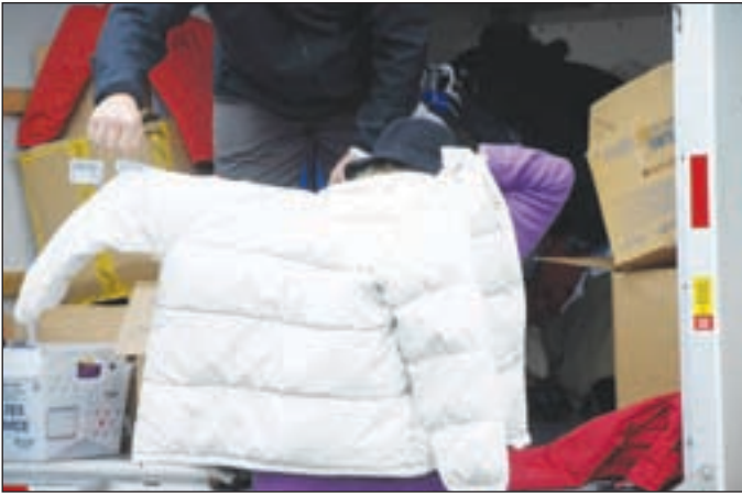
A person tries on a coat at the United Way of Sullivan County's eighth annual Free Coat Friday on the Newport Common on October 16. The Board of Directors of Sullivan County, Lake Sunapee Bank, Claremont Savings Bank, Hubert's Clothing Store and The Perfect Storm boot store in Lebanon donated their time, space and clothing to help area residents in need.