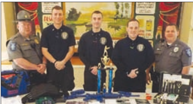
The Deering Police Explorers participated in the Town's Annual Safety Day on Saturday.

On Sunday, October 18 on the HD campus, members of the class of 2017 worked hard to develop, plan for, and carryout a Color Run with the goal of raising funds to create care packages that would benefit the community. The event was well-attended by 56 participants including children, adolescents, adults, and even pets. We raised $350 hosting the event and will be creating laundry care kits, entertainment packages for folks at the Hillsboro House, supply packages for students in need, necessity/hygiene care packs (socks, toothbrushes, etc.), and food baskets for various members of the Hillsboro, Deering, Washington, and Windsor communities and hope to have everything together and delivered in time for the cold winter months.