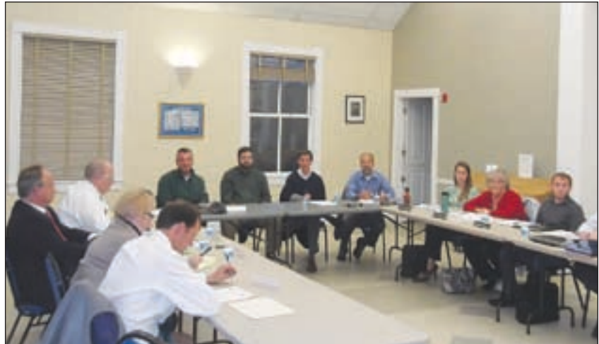
The Hopkinton Selectmen and School Board held a joint meeting Monday evening to discuss mutual concerns.