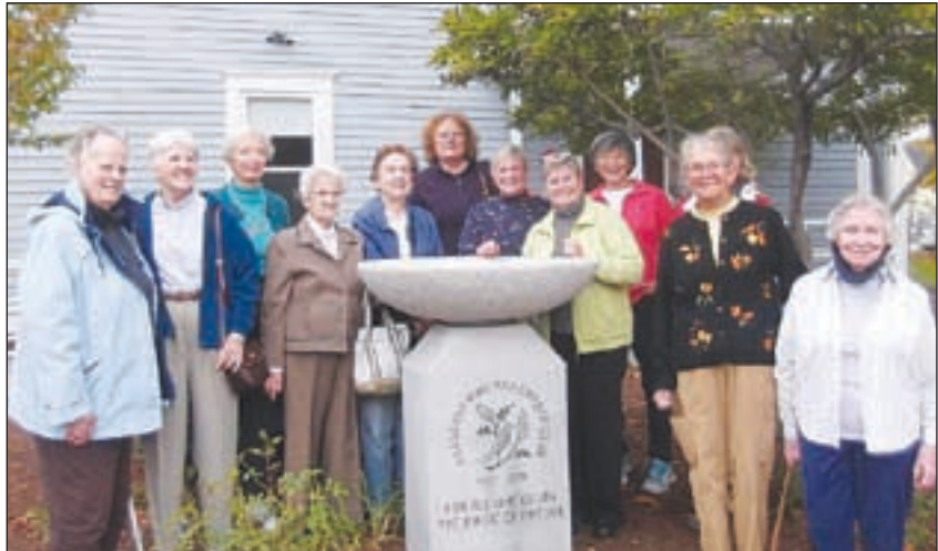
The Hillsborough Bird & Garden Club is disbanding after 110 years. The club's final act was the gift of this Bird Bath at Butler park.