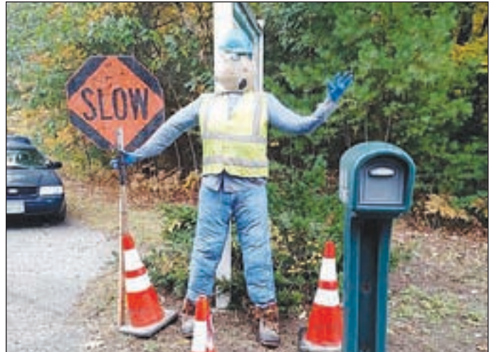
The Department of Public Works purchased a scarecrow kit from the Goffstown Rotary Club and this was the result.

Not a short sale or foreclosure, just a Price Reduction!!! Cute 2BR, one story house on nice lot with road frontage on two sides. Near Henniker St and Park and Ride for easy commute. Priced below assessed value. Hillsboro is about half way between Concord and Keene and near recreational areas such as skiing, golf, hiking, fishing, swimming. $59,900.