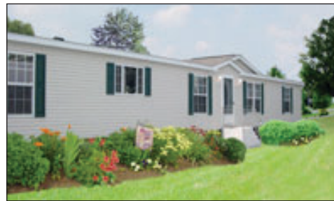
Single Wide Mobile

Land, water, sewer and clearing are extra.