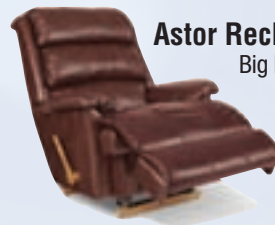
Astor Recliner * Big Mans Leather Recliner.