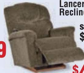
Lancer Recliner *