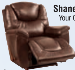
Shane Recliner * Your Choice of Chestnut or Vino Leather.