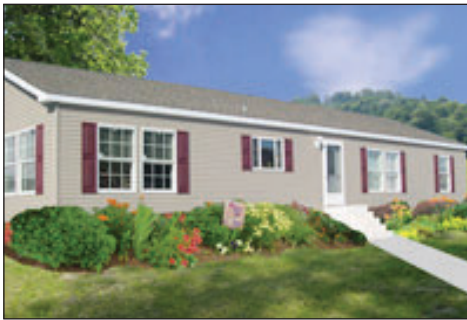
Double Wide Mobile

Land, water, sewer and clearing are extra.