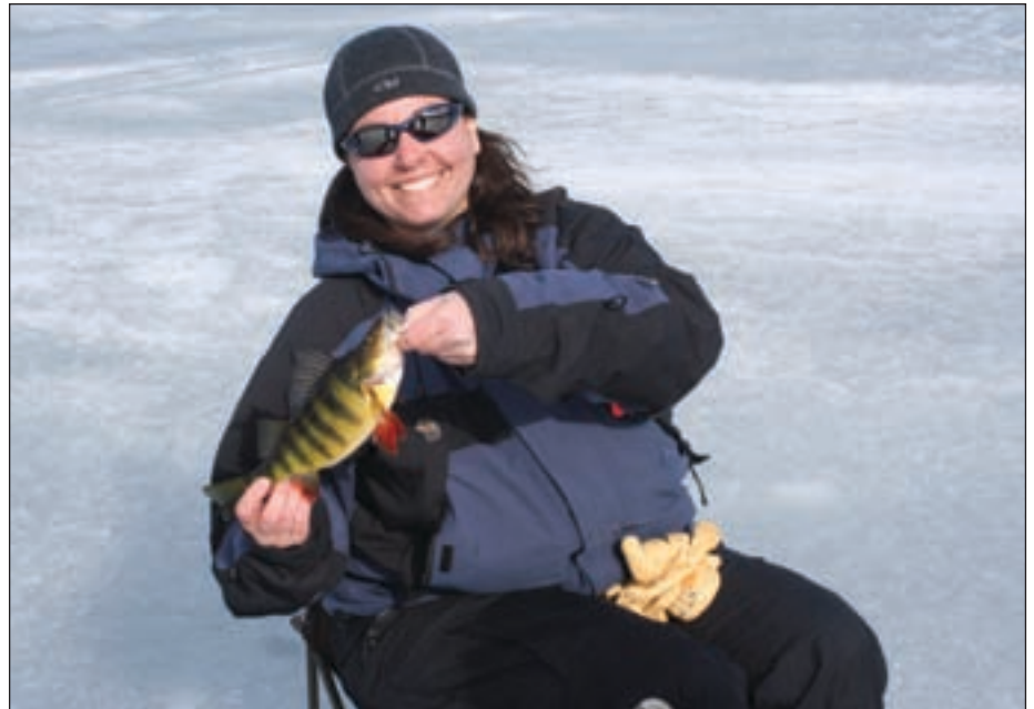
NH Fish and Game

Winter BOW participants choose one outdoor activity to explore during the daylong workshop, with four different options: Ice-fishing, winter outdoor survival, snowshoeing/wildlife tracking, and "Shoe and Shoot" (woodland target shooting on snowshoes).