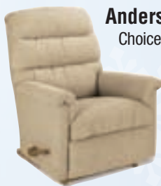
Anderson Recliner * Choice of 4 Colors.