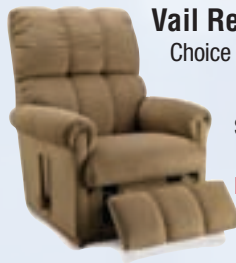
Vail Recliner * Choice of 3 Colors.