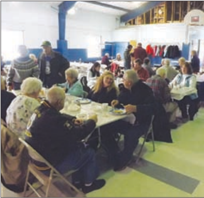
The Bow Men's Club started the year off right with a well attended, hearty breakfast on January 1st.