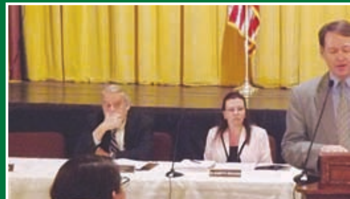
The Mayor's Inaugural Address