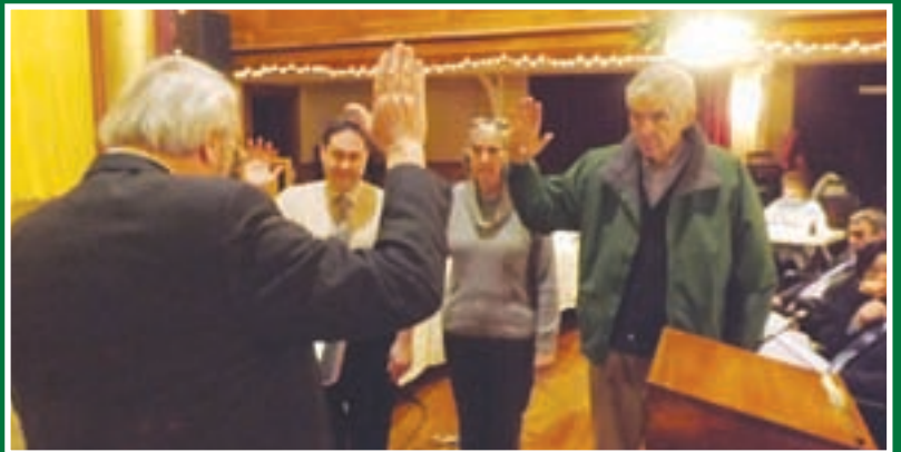
The School Board is sworn in