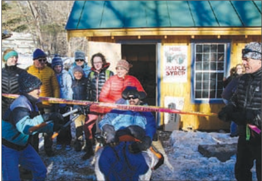
Proctor Academy celebrated the dedication of the Johnson Family Sugarhouse.

agreed to accept $190,220 from the insurance company for the three freightliner trucks refurbished from the fire.