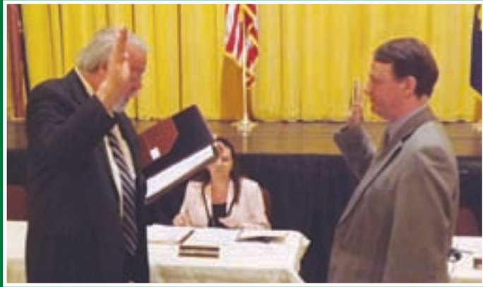
The mayor is sworn in