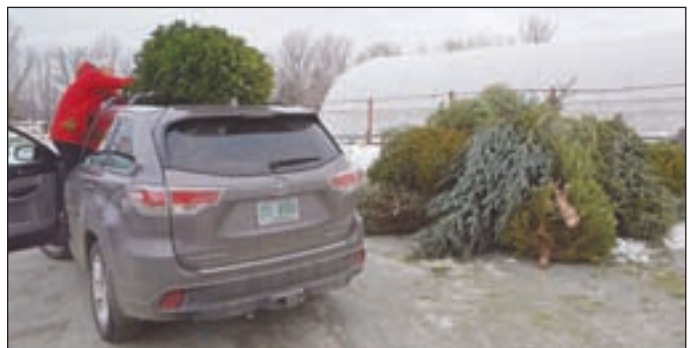
Dan Prince from Newbury drops off his old Christmas tree at Springledge Farm in New London on January 3. The trees will be chipped and used as mulch.