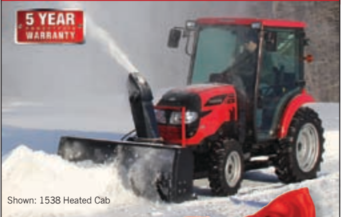
Shown: 1538 Heated Cab