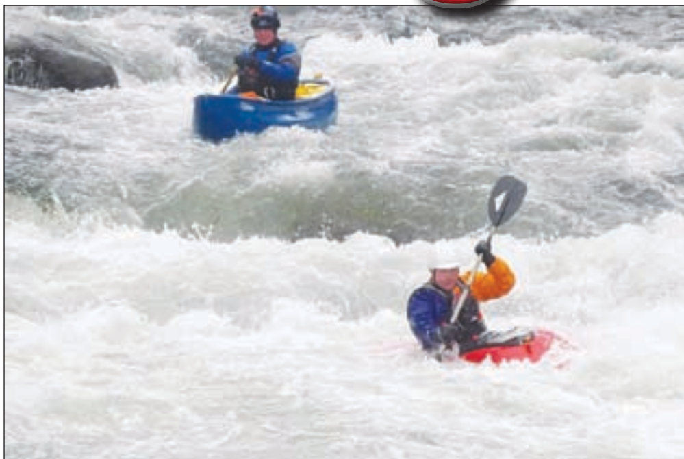
The Merrimack Valley Paddlers held their annual Winnepesaukee River Run on Friday as part of Franklin's First Day Celebration.