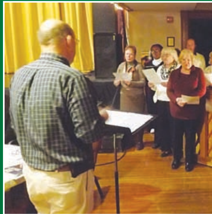
The Serendipity Singers & Three Rivers Chorale