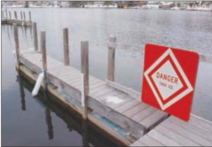
There was still no ice on Lake Sunapee when this photo was taken on January 3, 2016.