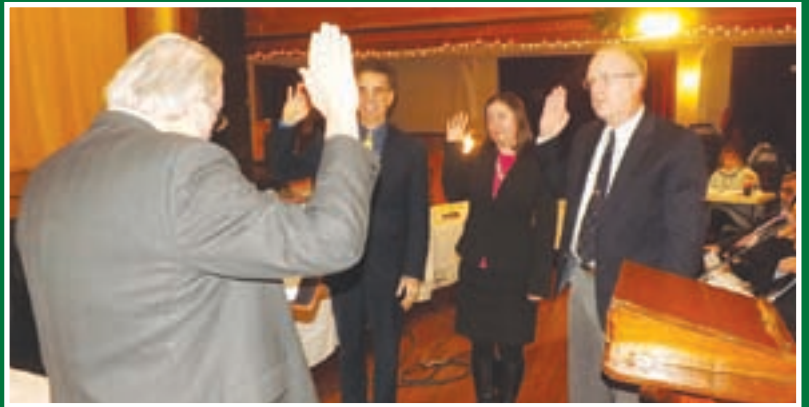
The City Council is sworn in