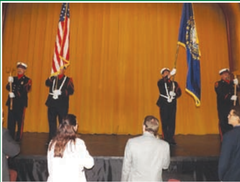
Franklin Fire Department posts the colors