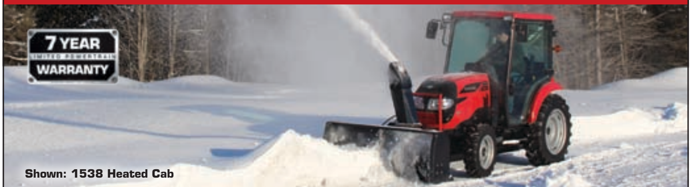
Shown: 1538 Heated Cab