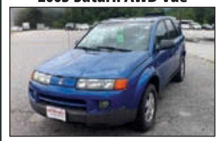
4 Door, Nicely Equipped, Including Sunroof. Blue. Stk# 17A01A