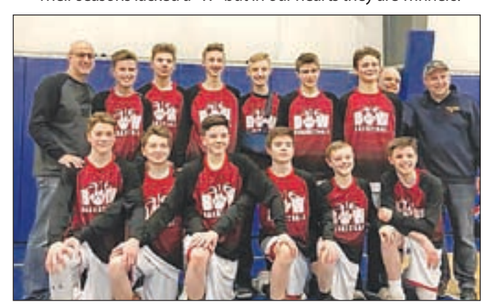
The Bow Memorial School boys' basketball team went 4-0 to win the Division I seventh- and eighth-grade Northeast Winter Championship.

Their seasons lacked a "W" but in our hearts they are winners.