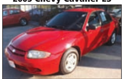
4 Door Sedan, Fully Equipped Including Aluminum Wheels, Economical. Red. Stk#16A12