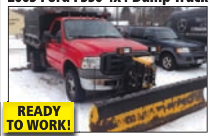
Only 87K Miles, V-8 Gas A/T, 2-3 Yard Dump Body. 9' Fisher M/M Plow. Red. Stk# 17A23