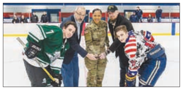
Bow High School recently held a Military Appreciation Night.