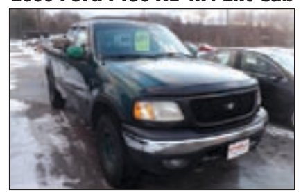
V8 Auto, Runs Well, Good Tires, Sold As Traded. Green. Stk# 13A39A