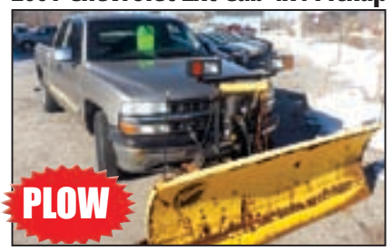
Fisher 7 1/2' Minute Mount PA Plow, New Pickup Bed, Fully Equipped. Silver. Stk# 17A07B