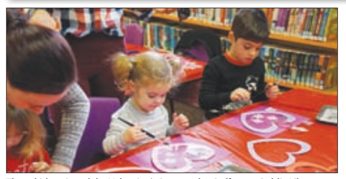
These kids enjoyed the Valentine's Party at the Goffstown Public Library.