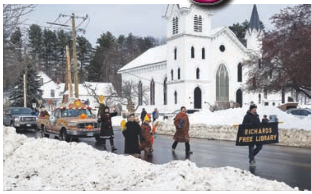
Richards Library won 1st place in the Small Float division of Newport's Winter Carnival Parade.