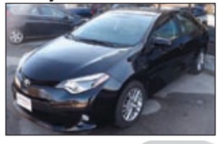
54,000 Miles, Fully Equipped Including Power Sunroof. Black Metallic. Stk# 17A22