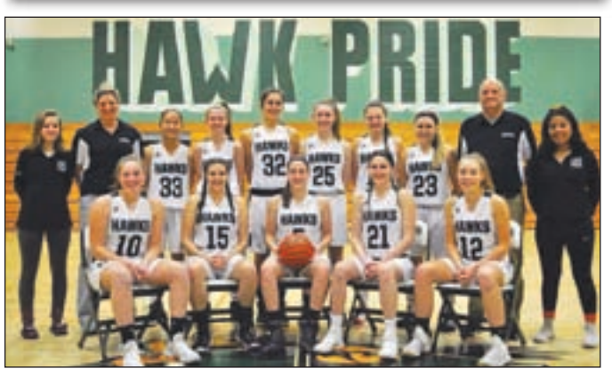
Hopkinton (17-4) will face No. 5 Conant (17-4) in Saturday's championship game at 4 p.m.