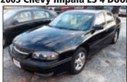
Fully Equipped Including Leather Interior. Two Owners. Very Clean. Black. Stk# 17A13B