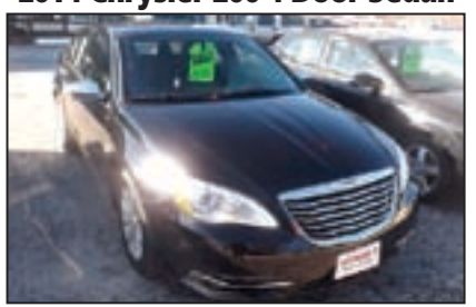
Nice Luxurious Economy Car, Fully Equipped, Incl Sunroof & Leather Interior. New Tires. Stk# 18A02