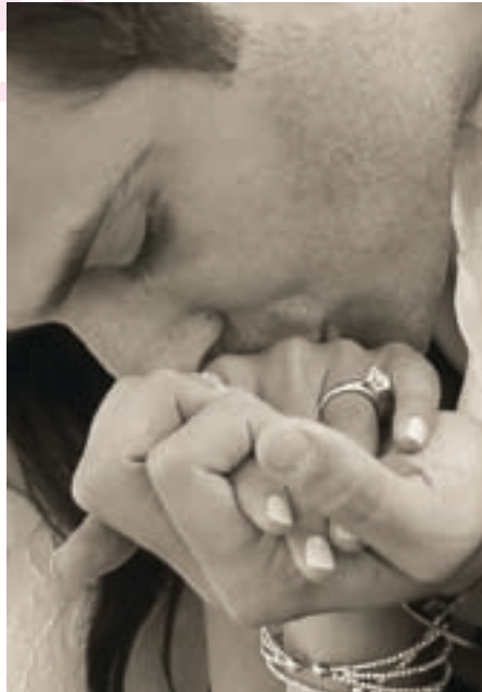
Rebecca Wilhite Photography with a bezel set diamond ensures a timeless look.

Ring type: Instead of anything too delicate or dainty, look for a heavier, more solid design. A simple platinum band or one