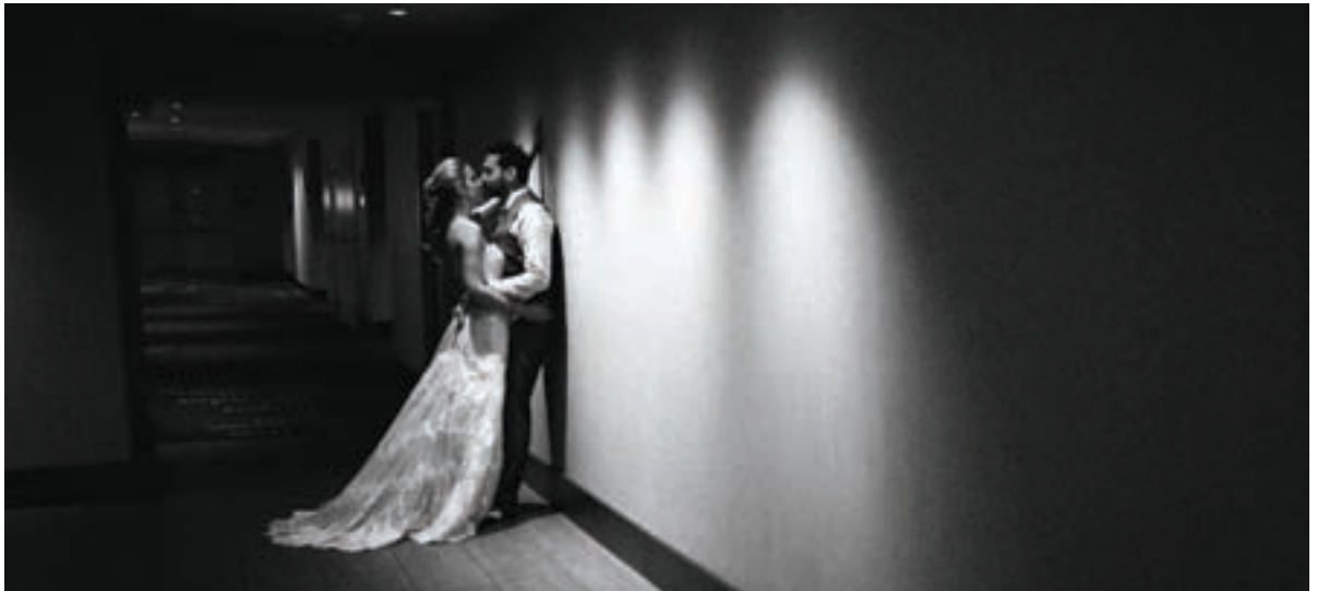
Rebecca Wilhite Photography