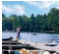
Sandy Beach RV Resort, Contoocook