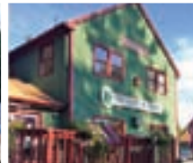
Pine Acres RV Resort, Raymond