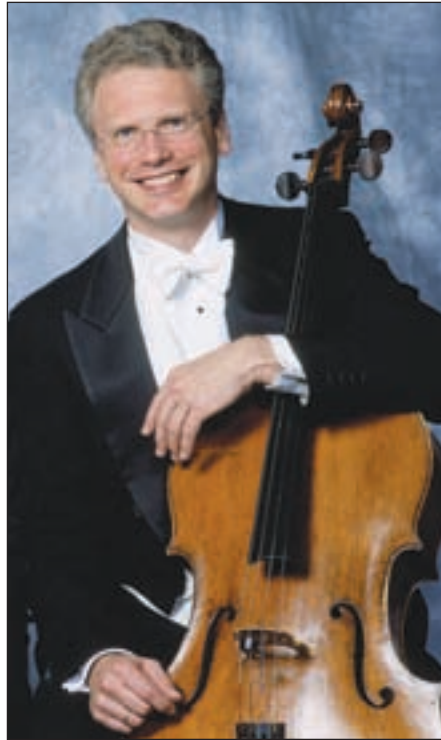
About the Halcyon Music Festival The mission of the Halcyon Music Festival is to create a community where chamber music will be explored and presented at the highest artistic level;

There is a suggested $25 donation for individual concerts. Audience members interested in attending more than one performance are encouraged to purchase one of the discounted subscription options: $150 for the full festival; $130 for six concerts; $110 for five concerts; $88 for four concerts; $65 for three concerts. Advance subscriptions can be purchased at www.halcyonmusicfestival.org .