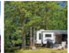
Tuxbury Pond, South Hampton