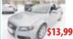
2011 AUDI A4 QUATTRO SEDAN 2.0T #3087