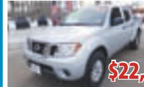
2016 NISSAN FRONTIER CREW 4WD 21,263 MI. #3146