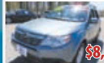
2010 SUBARU FORESTER UTILITY 2.5X #3289