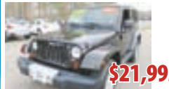
2012 JEEP WRANGLER SUV 2 DR. 4WD #3248