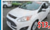
2015 FORD C-MAX ENERGI HATCHBACK 4 DR #3198