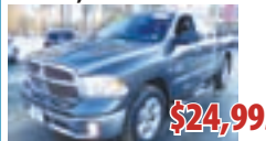
2014 RAM 1500 4WD CREW CAB 73,507 MI. #3098