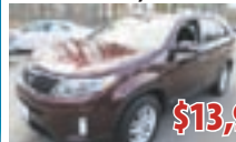
2014 KIA SORENTO SUV 4 DR. AWD 72,754 MI. #3257