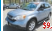
2007 HONDA CR-V SUV 4 DR. 4WD LX #3284