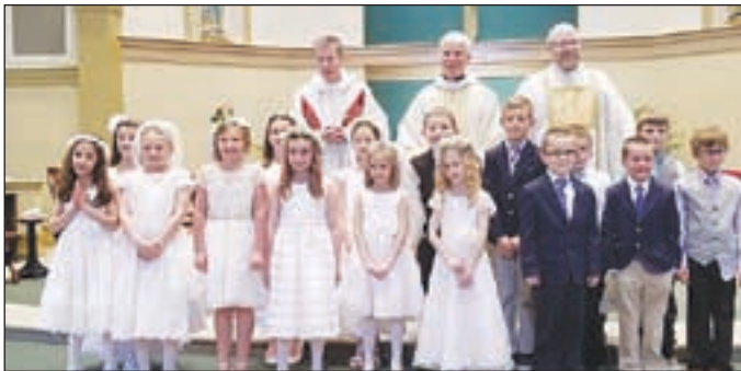
St Theresa in Henniker held 1st Communion on Sunday.