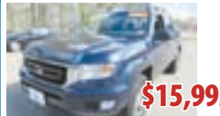
2010 HONDA RIDGELINE CREW PICKUP 4WD #3291