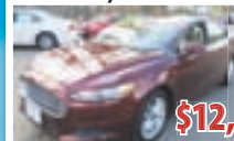
2015 FORD FUSION 4 DR. SEDAN 64,204 MI. #3264