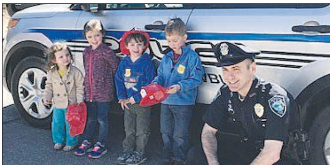
Newbury Police and Fire met with Newbury Youth who were able to see the police cruiser and fire truck.