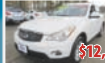
2010 INFINITI EX35 AWD UTILITY 6 CYL #3200