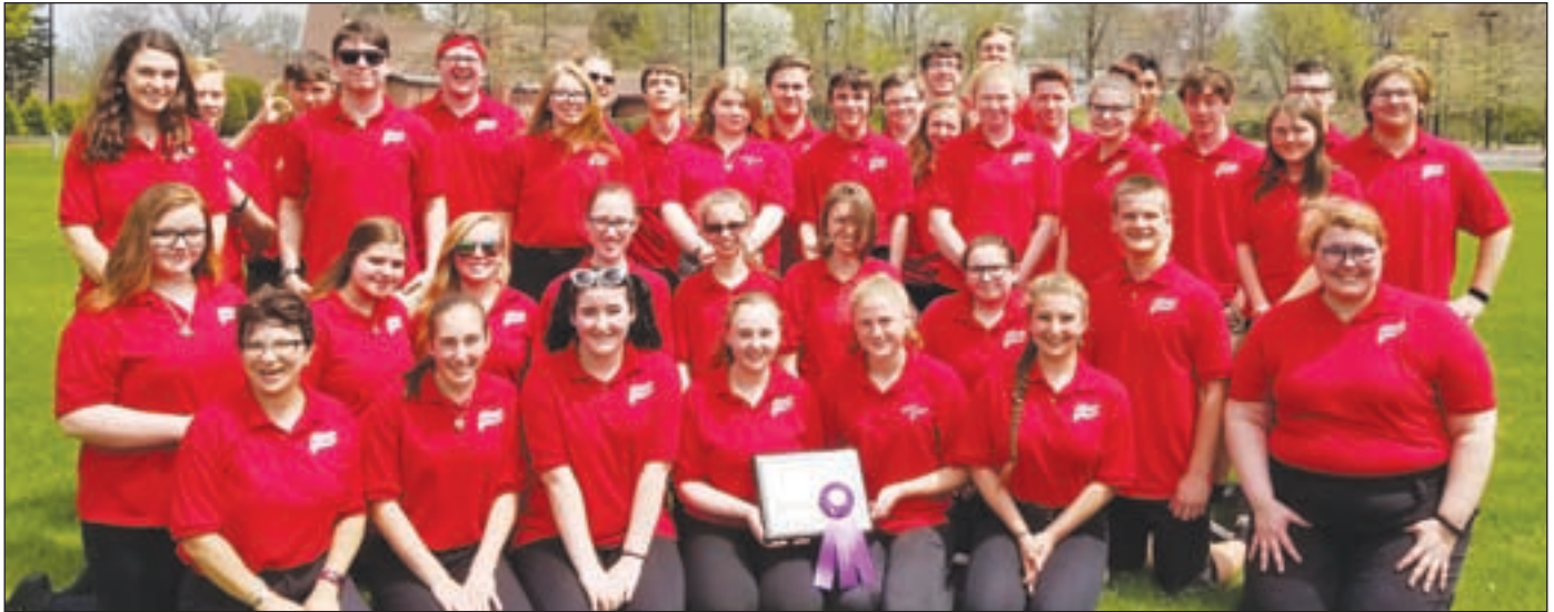
The Hillsboro-Deering Band & Chorus.