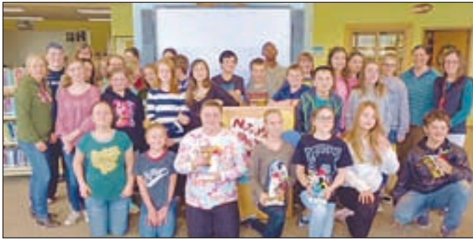
Celebrating National Poetry Month, HDMS had its annual Poetry Jam with thirty-five students and staff in the Media Center to share their favorite poems, or their original poetry.