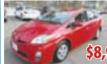
2010 TOYOTA PRIUS HATCHBACK 4 DR #3214