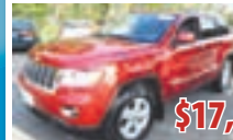
2011 JEEP GRAND CHEROKEE SUV 4 DR. 4WD #2718