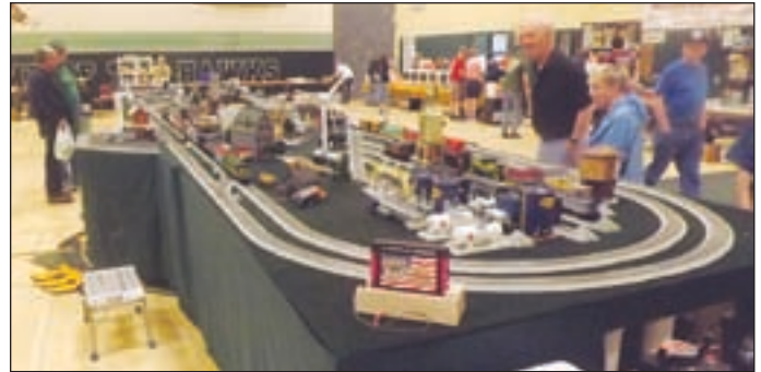
The 2nd annual Model Train show at Hopkinton High School was a success on Saturday.