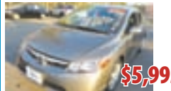
2007 HONDA CIVIC SEDAN 4 DR. #3288