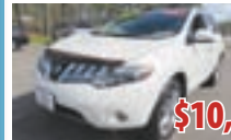
2009 NISSAN MURANO SUV 4 DR. AWD #3282