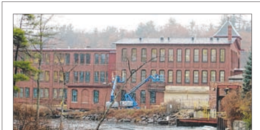
CATCH Neighborhood Housing for the rehabilitation and adaptive use of Franklin Power & Light Mill. Major rehabilitation of derelict mill building for workforce housing in downtown has been recognized by The NH Preservation Alliance.