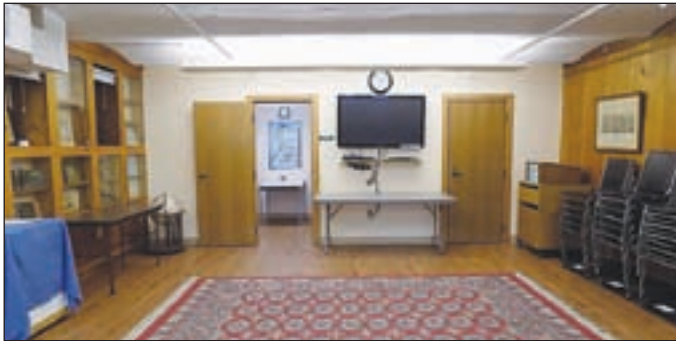
Renovations to Warner's Pillsbury Free Library have been completed.