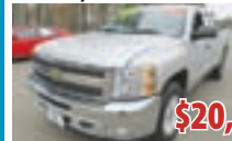
2011 CHEVY SILVERADO EXT CAB 75,297 MI. #3262