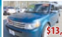
2011 FORD FLEX WAGON 4 DR. AWD #3211