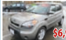
2011 KIA SOUL WAGON 4DR 4 CYL AUTO TRANS #3158