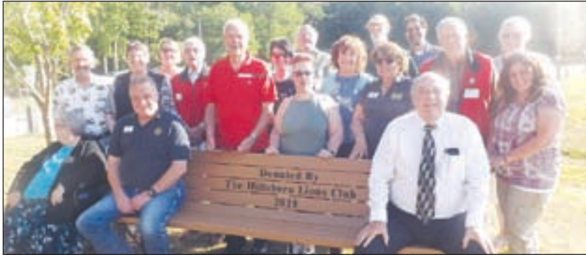
Members of the Hillsboro Lions Club gathered at the newly dedicated benches and shade tree the Club installed at its previously dedicated playground at Grimes Field. The latest installment brings the Lions total investment in the project to over $20,000.

Jefferson was one of our first, and perhaps the greatest Democrat, but if he said these things today, he would be ostracized from his own party.