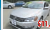
2013 VOLKSWAGEN PASSAT 4 DR. 71,302 MI. #3337