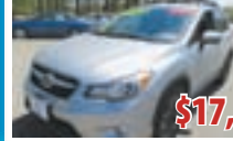
2016 SUBARU IMPREZA WAG 4 DR. 41,449 mi. #3307