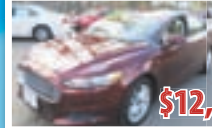
2015 FORD FUSION 4 DR. SEDAN 64,204 MI. #3264