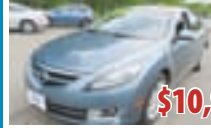
2012 MAZDA6 4DR SDN GRAND TOURING #3336