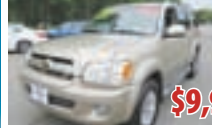
2006 TOYOTA SEQUOIA SUV 4 DR. 4WD #3327