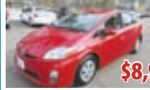
2010 TOYOTA PRIUS HATCHBACK 4 DR #3214