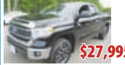
2014 TOYOTA TUNDRA 4WD V8 4X4 50,015 MI. #3339