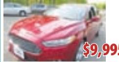
2013 FORD FUSION SEDAN 4 DR. #3323