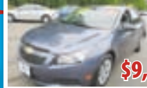
2014 CHEVY CRUZE SEDAN 4 DR. 52,740 MI. #3335