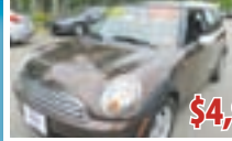
2009 MINI COOPER CLUBMAN WAGON 4 DR. #3357