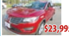
2015 LINCOLN MKC SUV 4 DR. 24,699 MI. #3318