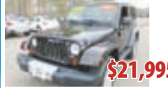
2012 JEEP WRANGLER SUV 2 DR. 4WD #3248