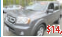
2011 HONDA PILOT UTILITY 4WD 4DR #3292