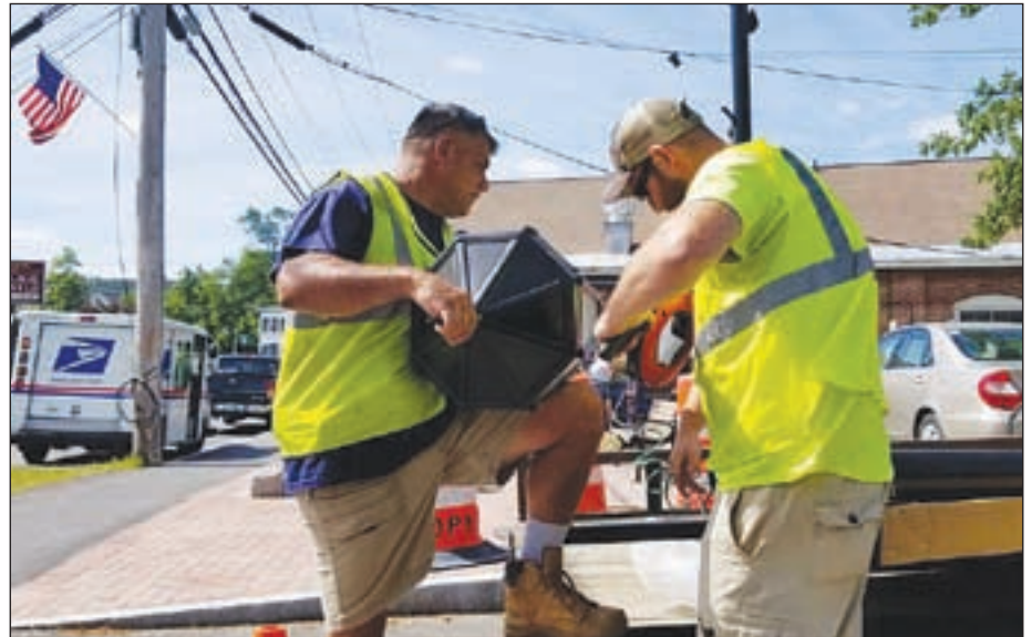
Work on Goffstown's Main Street rebuild continues.