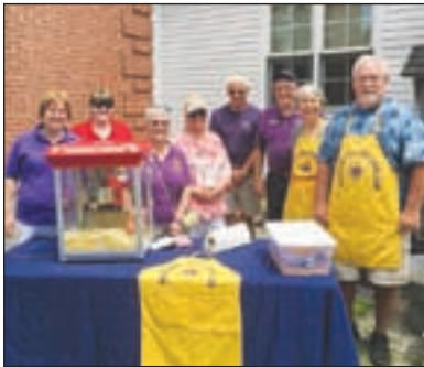
The Antrim/Bennington Lions Club helped open the James Tuttle Library's Summer Reading Program.

these areas need to be accessible by large trucks. The curbing on these islands will be beveled. DPW is still waiting on dates for curbing and cobble install. This work will require a temporary truck detour for the concrete to set and the cobbles to be installed.