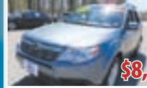
2010 SUBARU FORESTER UTILITY 2.5X #3289