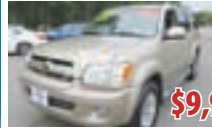
2006 TOYOTA SEQUOIA SUV 4 DR. 4WD #3327