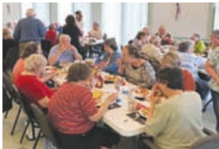
The Hopkinton Lions Club recently hosted a Senior Picnic at the Slusser Center.

overheated machinery may have ignited some of the shredded paper, and that the damage appeared contained and the facility should be back up and running within the next day or two.