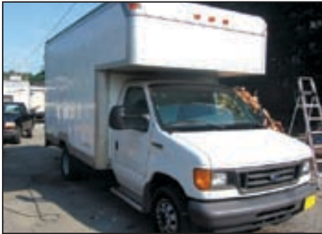
2006 Ford E350 12' Box Truck

With 4' Overhang 5.4, Clean Carfax! Runs Perfect! Needs Nothing!