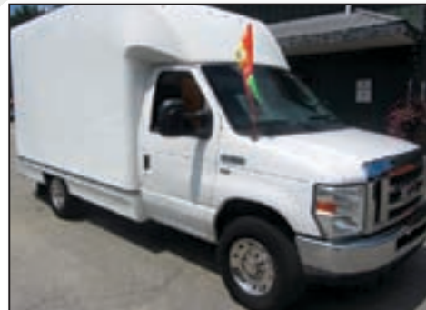
2010 Ford E350 12' Box Truck

With Single Rear Wheels! 5.4, One Owner, Clean Carfax! Comes NH State Inspected & 20 Day Plate!