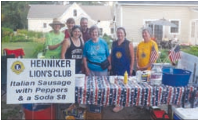
The Henniker Lions Club helped feed the crowd at the recent concert by the 39th Army Band.