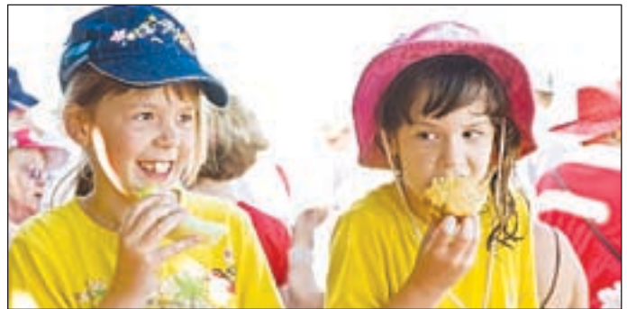
The Peterborough Food Pantry "Summer Snack Program" has begun and will be available in July and August as an additional offering to our clients with children in the form of brown paper lunch bags.