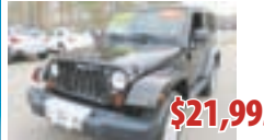
2012 JEEP WRANGLER SUV 2 DR. 4WD #3248