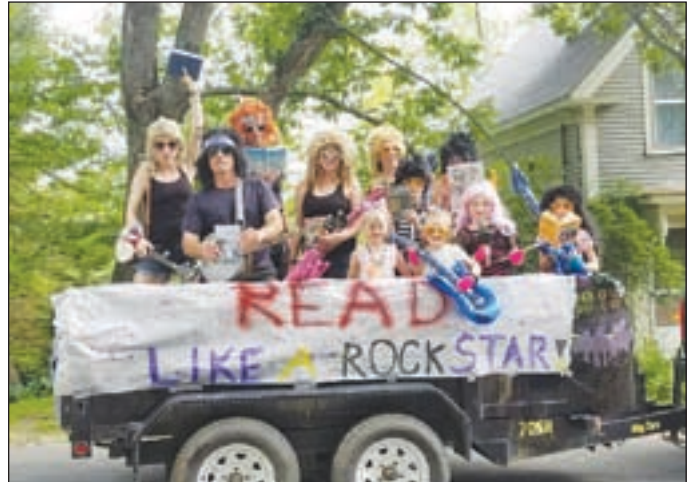
Brown Memorial Library was the Festive Float winner in Bradford's July parade.