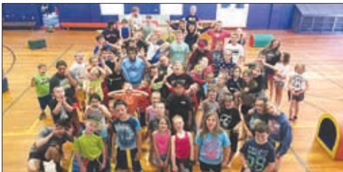
Newport Recreation's Day Camp is off to a flying start.