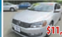
2013 VOLKSWAGEN PASSAT 4 DR. 71,302 MI. #3337