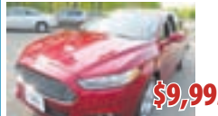
2013 FORD FUSION SEDAN 4 DR. #3323