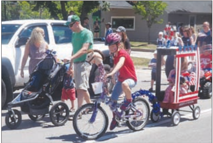
Hopkinton hosted it's annual Children's Parade last Saturday