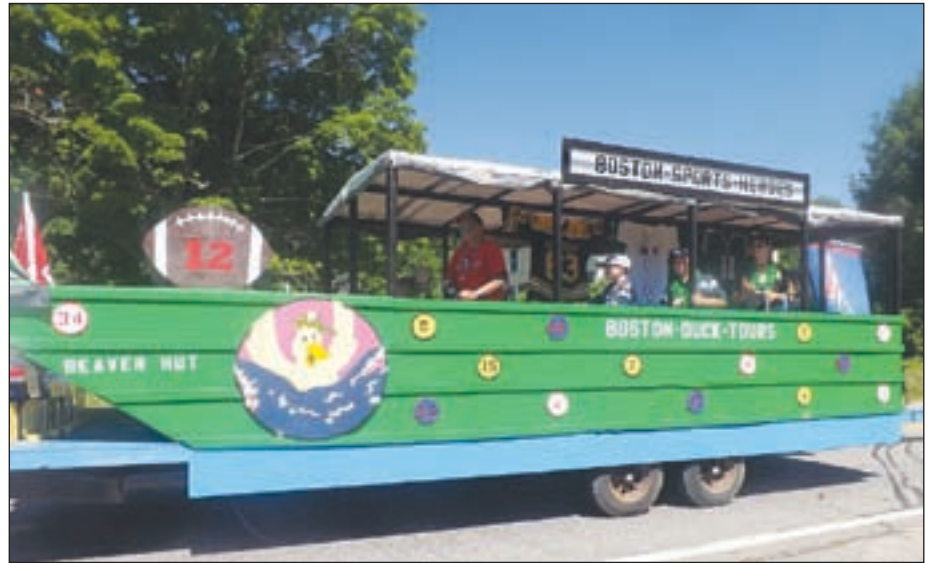
For length, number and variety of entries, and creativity, nobody does a Hometown Parade as well as New Boston.