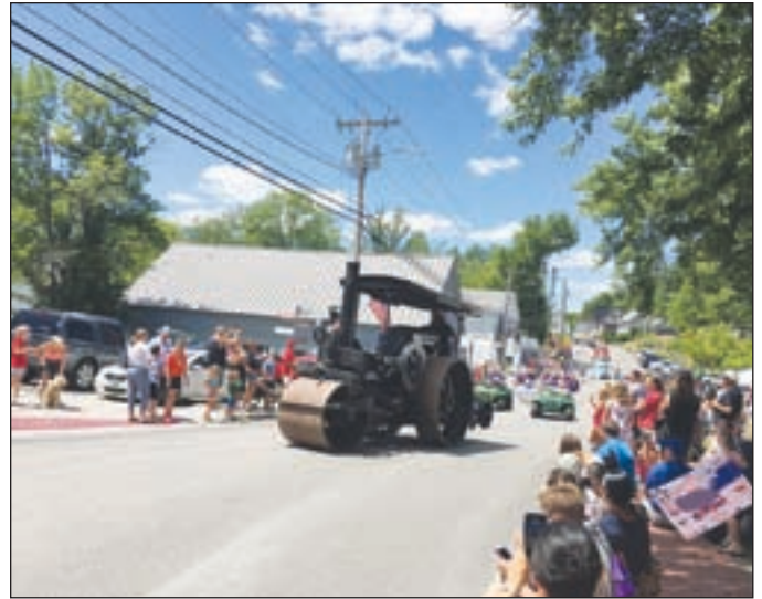
The Towns of Weare (left photo) and Sunapee (right photo) held Independence Day Parades on Saturday.