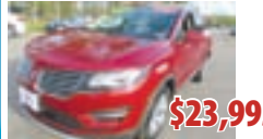
2015 LINCOLN MKC SUV 4 DR. 24,699 MI. #3318