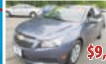
2014 CHEVY CRUZE SEDAN 4 DR. 52,740 MI. #3335