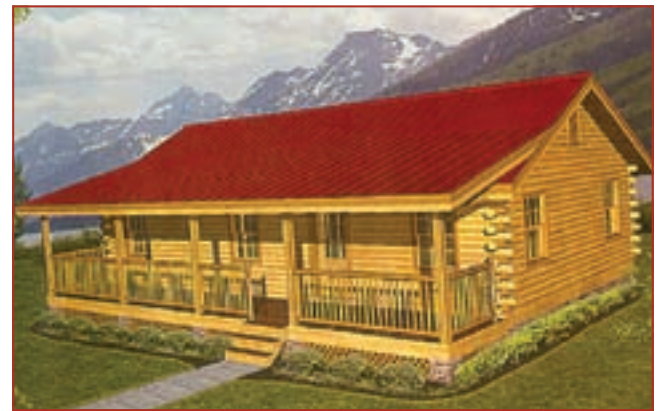
The Colorado 1,364 sq. ft. 3 BR 1 Bath $32,300*