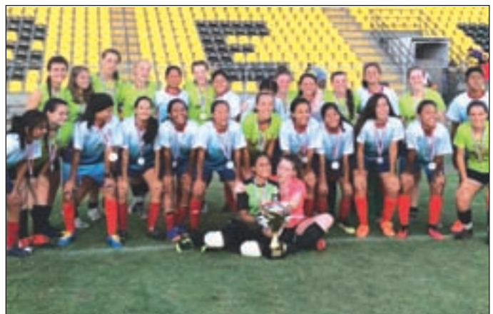
Hillsboro Heat u-18 Team