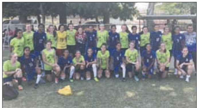
Hillsboro Heat u-16 Team