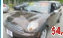
2009 MINI COOPER CLUBMAN WAGON 4 DR. #3357