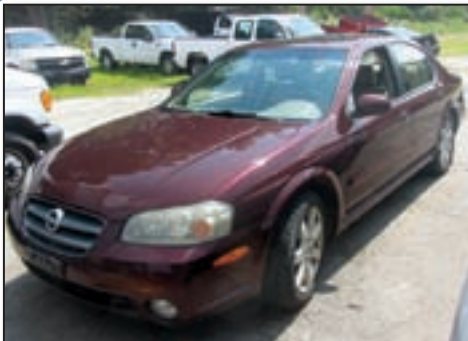
2003 Nissan Maxima GLE

LOADED! With Power Sunroof, Automatic, Runs Perfect! Needs Nothing! Comes NH State Inspected & 20 Day Plate!