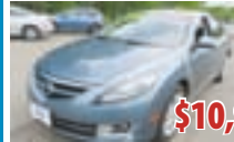
2012 MAZDA6 4DR SDN GRAND TOURING #3336