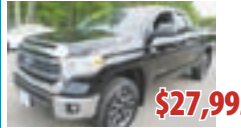
2014 TOYOTA TUNDRA 4WD V8 4X4 50,015 MI. #3339