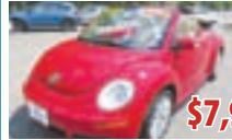
2010 VOLKSWAGEN NEW BEETLE CONVERTIBLE #3252