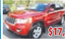
2011 JEEP GRAND CHEROKEE SUV 4 DR. 4WD #2718