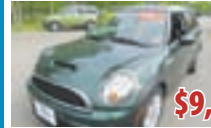
2012 MINI COOPER CLUBMAN 80,467 MI. #3315