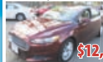
2015 FORD FUSION 4 DR. SEDAN 64,204 MI. #3264