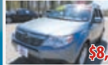
2010 SUBARU FORESTER UTILITY 2.5X #3289