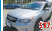
2016 SUBARU IMPREZA WAG 4 DR. 41,449 mi. #3307