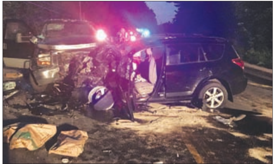
Two men were killed in this Belmont accident.