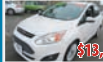
2015 FORD C-MAX ENERGI HATCHBACK 4 DR #3198