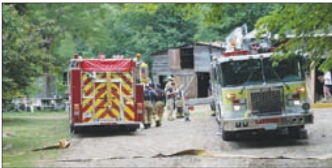
Hopkinton Ladder 1 and Tanker 1 participated in a live burn training exercise in Webster. Crews practiced small room and contents fires as well as close proximity exposure protection.