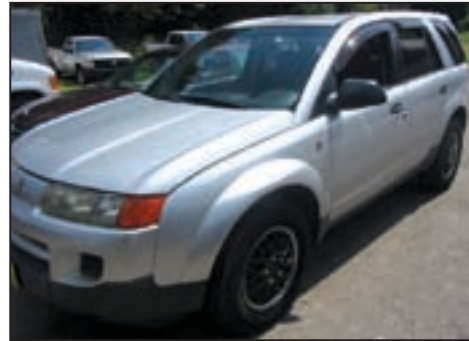
2004 Saturn Vue AWD

Loaded! Runs Excellent! Heated Seats! Comes NH State Inspected & 20 Day Plate!