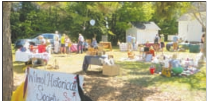
The Wilmot Historical Society's Curiosity Shop will be set up at the Wilmot Farmers' Market on the Wilmot Town Green from 9 a.m. until noon on the first Saturday of the month.