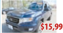
2010 HONDA RIDGELINE CREW PICKUP 4WD #3291