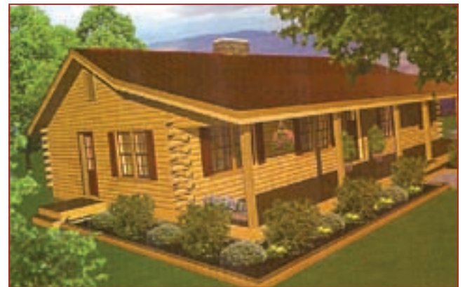
The Yellowstone 2,016 sq. ft. 3 BR 2 Bath $40,200*