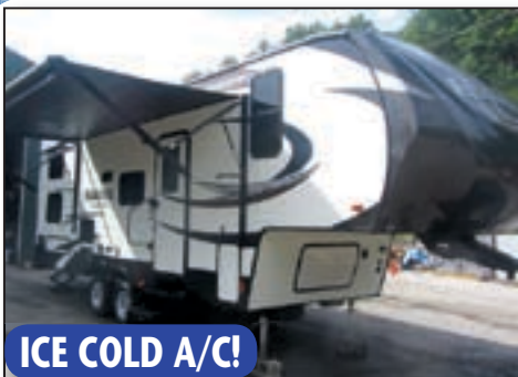
2015 Heartland Elkridge

Xtreme Light E26 5th Wheel with Bunks, Living Room Slide Out, Power Awning! Clean Clean Camper!