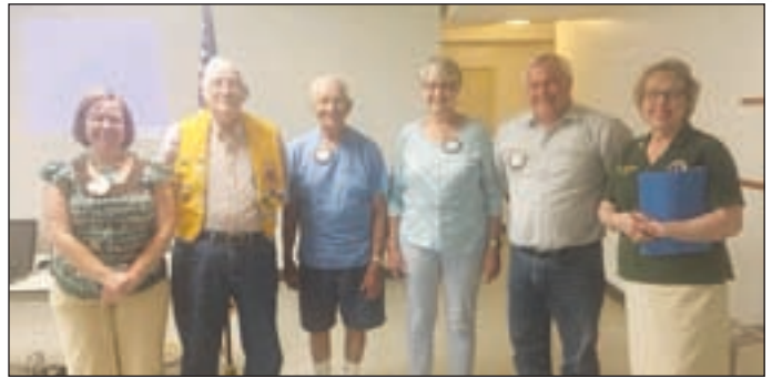
The New London Lions Club recently elected new officers.