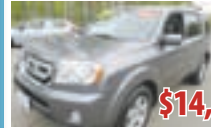
2011 HONDA PILOT UTILITY 4WD 4DR #3292