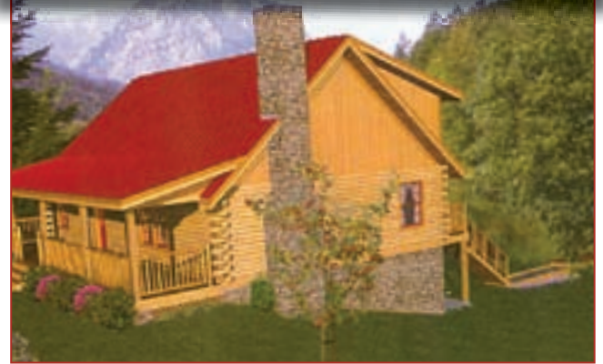
The Texan 2,296 sq. ft. 3 BR 2 Bath $39,800*