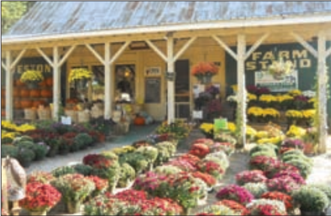
Westons Farm Stand.

with what's fresh that season. For info: hethompsonhouseeatery.com/