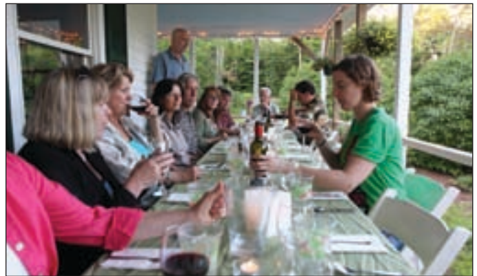
Farm to Table dining at White Gates Farm.

Call 603.433.1100 for more info 14 Hancock Street, Portsmouth, NH 03802 www.strawberrybanke.org