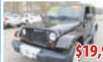
2012 JEEP WRANGLER SUV 2 DR. 4WD #3248