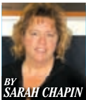
BY SARAH CHAPIN

A new study in JAMA Cardiology shows that the drug fenofibrate might reduce the risk of cardiovascular events in patients with type 2 diabetes who have high levels of triglycerides and low levels of "good" cholesterol, despite being treated with statins. Fenofibrate is primarily used to help reduce elevated levels of triglycerides, or fat, in the blood. But the researchers wanted to know if the drug, when combined with statin treatment, could also reduce the risk of heart disease in people with type 2 diabetes. People with type 2 diabetes are at high risk of cardiovascular-related events, such as heart attacks, stroke, and even death, often because their levels of triglycerides are so high, and their high-density lipoprotein (HDL) cholesterol levels are low.