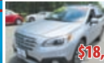
2015 SUBARU OUTBACK WAGON 4 DR. #3377