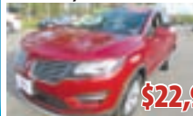
2015 LINCOLN MKC SUV 4 DR. 24,699 MI. #3318