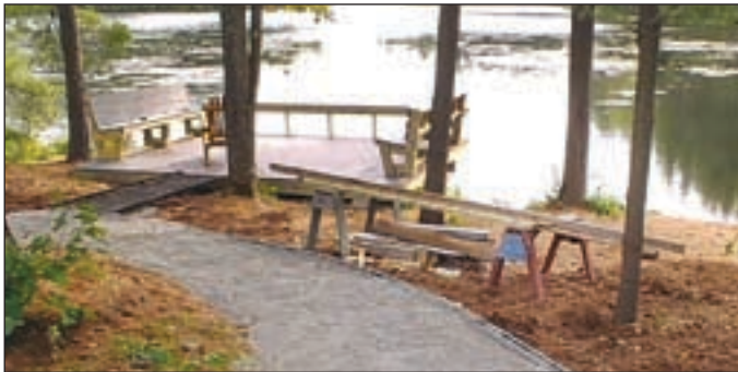
The Hopkinton Lions Club completed the Kimball Cabins handicap accessible fishing dock project in time for the Kimball Lake BBQ.