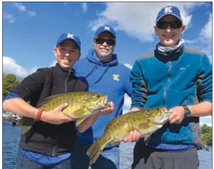
Kearsarge High School Bass Fishing team.