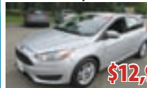
2016 FORD FOCUS 4 DR. HTCHBCK 42,773 MI. #3549