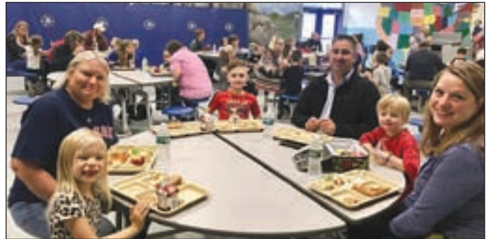
It was a special day at KRES-Bradford on Friday, as each student had the chance to invite a special someone in their lives to lunch in the cafeteria... and lots of special guests came!