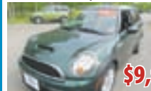
2012 MINI COOPER CLUBMAN 80,467 MI. #3315