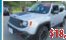
2015 JEEP RENEGADE SUV 4WD 52,688 MI. #3391