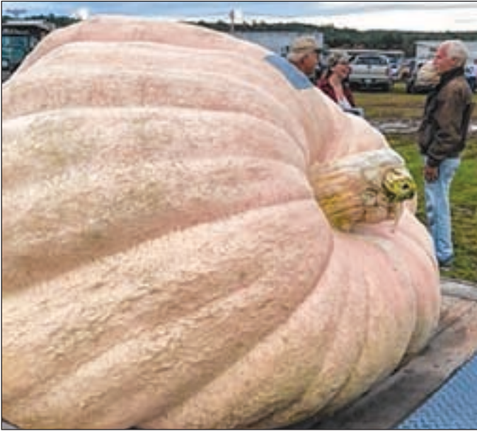
Steve Geddes of Boscawen now holds the record for growing the heaviest pumpkin in North American history. The record-breaking gourd checked in at 2,528 pounds Thursday night at the Deerfield Fair. It is the second heaviest pumpkin ever grown in the world, at only 96 pounds less than the record holder produced in Belgium in 2012.