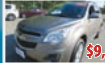
2011 CHEVROLET EQUINOX SUV 4 DR. AWD #3574