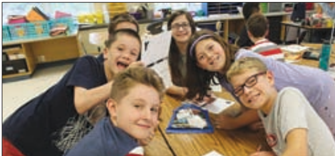
Mountain View Middle School students and staff participated in a school wide Summer Reading Book Chat. This year's activity was to create an ABC Book about the book that they read, which are on display in the Information Center.