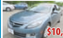
2012 MAZDA6 4DR SDN GRAND TOURING #3336