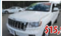
2011 JEEP GRAND CHEROKEE SUV 4 DR. 4WD #3575