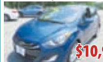
2014 HYUNDAI ELANTRA GT HCHBCK 67,005 MI. #3376