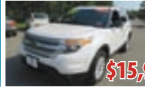
2014 FORD EXPLORER SUV 4 DR. 4WD #3547