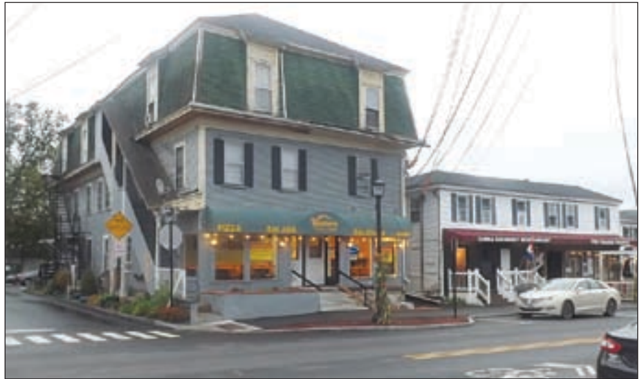
Tax incentives will contribute to a renovation of this building.

Come to our meeting, hear and learn about this nonpartisan issue that passed the NH Senate 22-2 and NH House of Representatives 309-9. Looking forward to seeing you there.