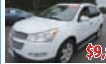
2009 CHEVROLET TRAVERSE SUV 4 DR. AWD #3586