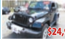
2015 JEEP WRANGLER SUV 4WD 64,449 MI. #3228