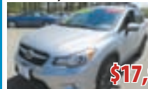
2016 SUBARU IMPREZA WAG 4 DR. 41,449 MI. #3307