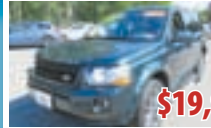
2014 LAND ROVER LR2 AWD SUV 4 DR. 80,698 MI. #3387