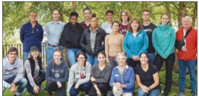
Lake Sunapee Protective Association hosted 12 students from the Kanton-schule, near Zurich, Switzerland. It was a full day for the students, during which they learned about the Lake Sunapee watershed and invasive species.