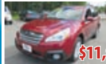
2013 SUBARU OUTBACK WAGON 4 DR. AUTO #3554