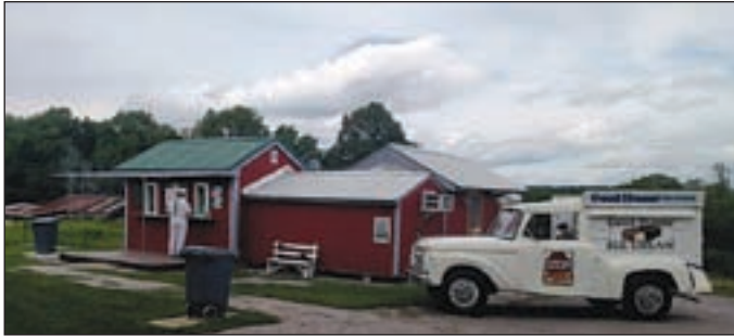
Illey's Ice Cream of Weare brought home two awards from the National Ice Cream Convention in Colorado Springs! A second place ribbon for our Chocolate and a runner up for Best New Flavor with our Apple Butter Ginger Snap!