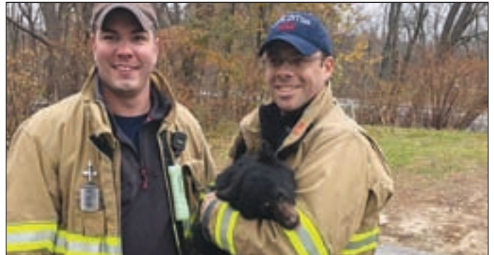
The Hopkinton Fire Department assisted a NH Fish and Game biologist in the removal of a small bear cub in a tree behind Dimitri's Pizza. The bear was tranquilized and relocated.