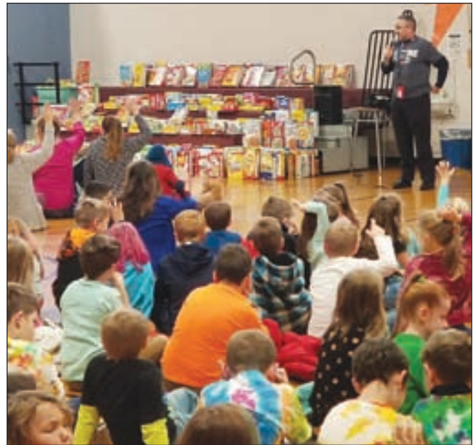
Hillsboro-Deering elementary school collected 375 boxes of cereal for the Hillsboro Food pantry as part of world kindness day.