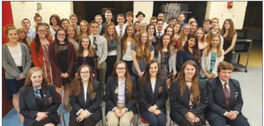
Hillsboro-Deering's 2018-2019 DECA participant

the THRIVE campaign, certify their school based enterprise, and prepare to compete in marketing and business events at the New Hampshire DECA 62nd competition. The DECA State Conference will be held from February 13th - 15th at the Doubletree in Manchester with winners advancing to the International Career Development Conference in Orlando, Florida in late April. HD's 8th graders will compete at the state level middle school conference in the spring.