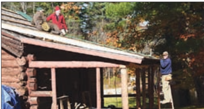
Members of the Hopkinton Lions Club were busy repairing roofs at Kimball Cabins.