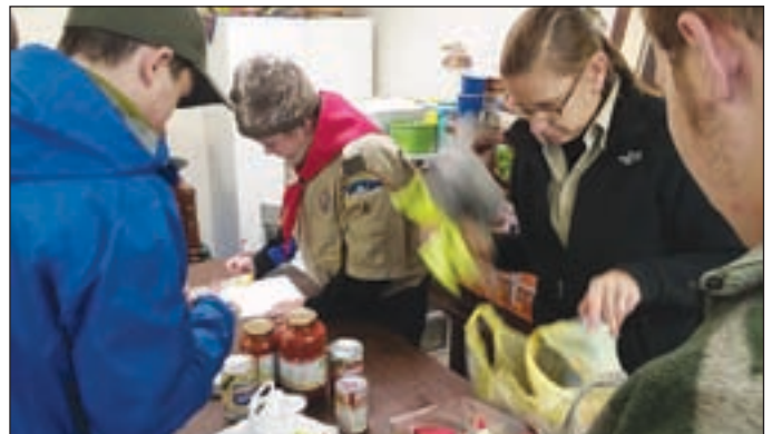
Antim Troop 2 Boy Scouts collected over 3200 food items for the Antrim-Bennington Food Pantry and the families it serves.