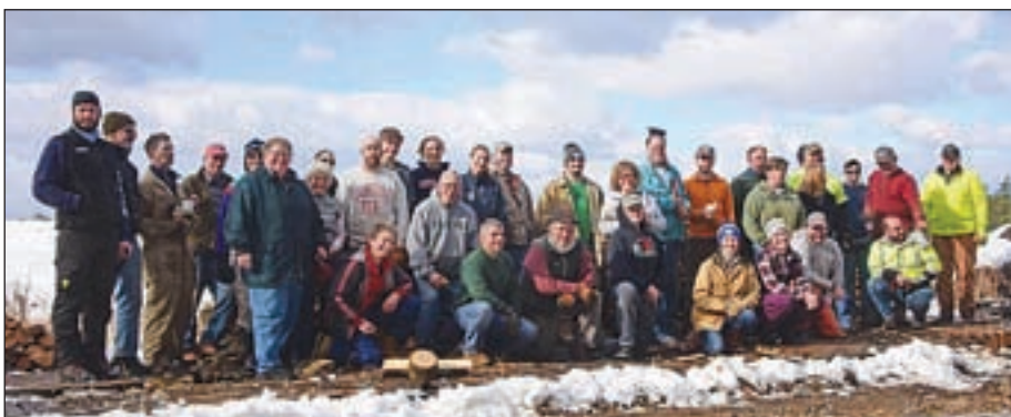
Saturday was "Wood For Warmth Day" in Hopkinton and volunteers turned out in force.