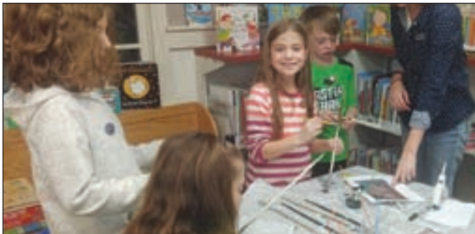
Children made their own wand creations at the Harry Potter After School Club at the Newbury Public Library.