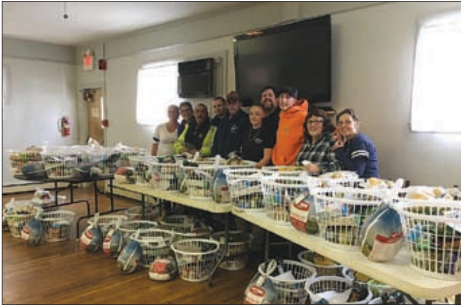
CHARITY BEGINS AT HOME: Hillsboro's Moose Lodge teamed up with Tooky Mills, Mama McDonough's and Angelino's, with help from Shaws and Dollar General to provide a Thanksgiving Dinner to 20 area families. Each family received two baskets full of food and a turkey.

need to get the support of the larger towns in order to win. As a first time candidate I knocked on a lot of doors in Weare and Deering. I lost by one vote in Weare but thanks to the voters of Deering, I was able to win and was chosen as one of the three State Representatives in our District, the other two are from Weare. I will be forever grateful for the voters of both towns who voted for me but I am especially thankful to the residents of my hometown of Deering, for their continued support and confidence in me. I believe it is important for those in the smaller towns to have a voice in our State Government and I am honored to be your Representative. Thank you and I wish you all a Happy Thanksgiving. It's time to get to work!