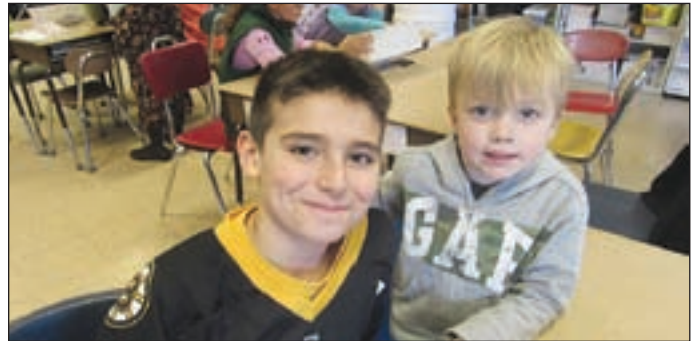
KRES at Bradford did their first Caring Schools Community Cross-age Buddy Activity to help students develop positive relationships by pairing older student with younger students.