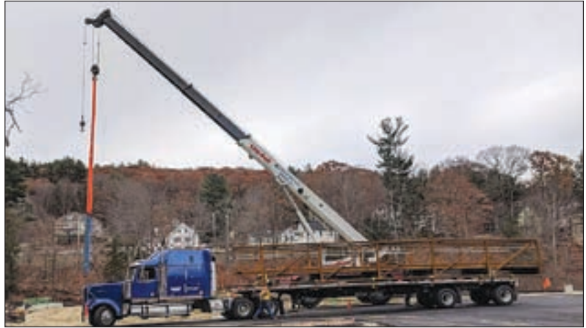
Segments of the new footbridge, which will connect Depot Square Park with the new Riverwalk parking lot have arrived and are in the process of being unloaded & joined, and are scheduled to be installed this week. (weather permitting).

beers brewed on site. The brewery opened this summer, and sells its beer exclusively at its tap room, she said. The business does offer growlers of beer for people to take home.