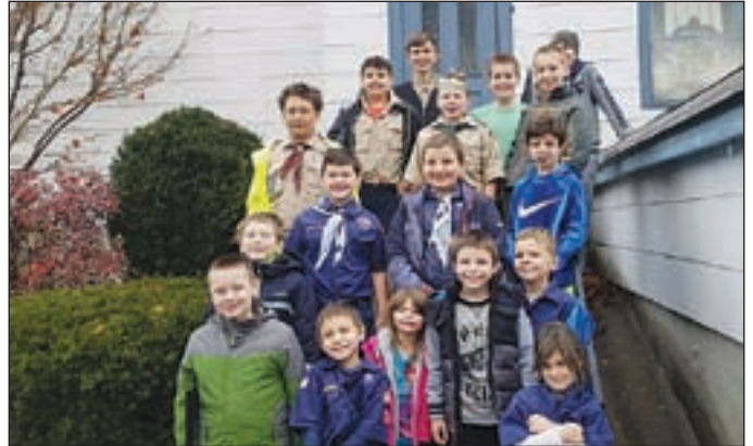
The Scouts from both Pack and Troop 73 of Hillsborough collected 1418 items for the Hillsborough Food Pantry.