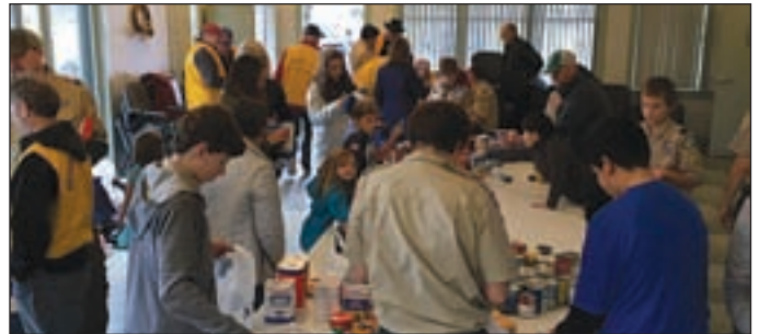
The Hopkinton Cub, Boy, and Girl Scouts teamed up with the Hopkinton Lions Club to sort, pick up, sort, and deliver over 3,000 items for local families.