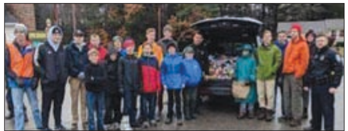
The Bow Police Association presented a trunk full of food to Troop 75 during their Scouting for Food campaign.