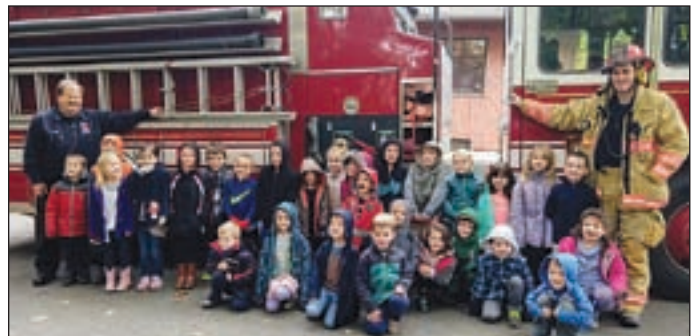
New Boston Firefighters taught Fire Prevention at Chestnut Preschool & Kindergarten.