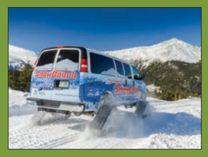
Reservations Are Strongly Recommended

Winter tours on the Mt. Washington Auto Road run daily, leaving from the cozy Great Glen Trails base lodge