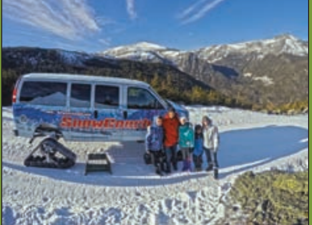
Walk-Ins Welcome Any Day - Call Ahead

Book your tour online at SnowCoachNH.com