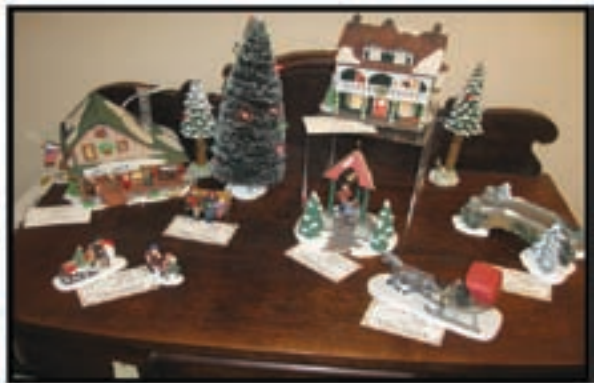
New England Village — Dickens' Village