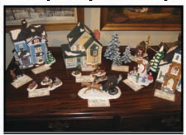
Snow Village — Christmas in the City