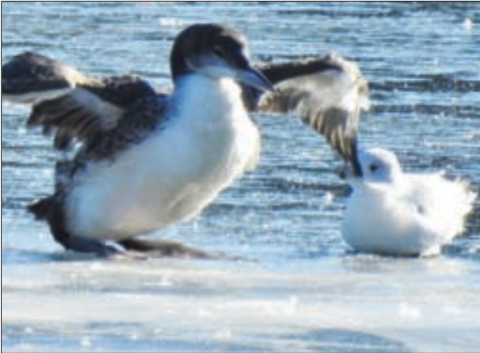
A juvenile common loon was rescued after becoming trapped on Willand Pond in early December.