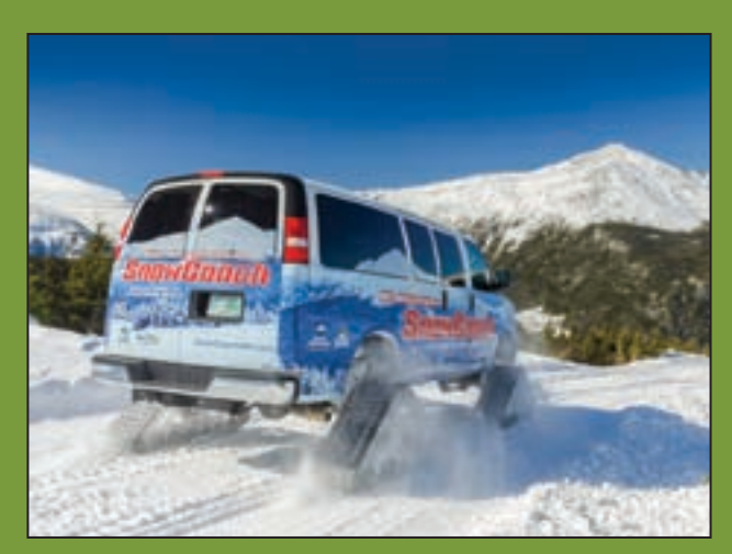
Reservations Are Strongly Recommended

Winter tours on the Mt. Washington Auto Road run daily, leaving from the cozy Great Glen Trails base lodge