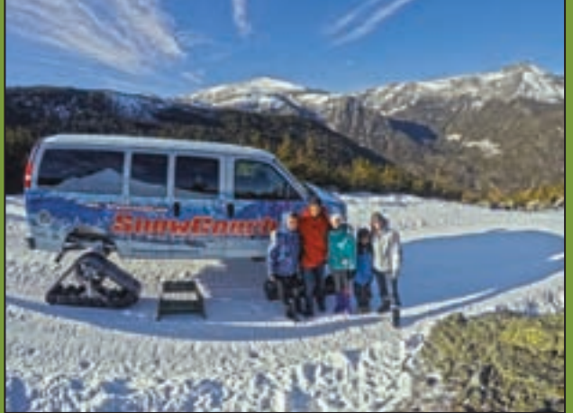
Walk-Ins Welcome Any Day - Call Ahead

Book your tour online at SnowCoachNH.com