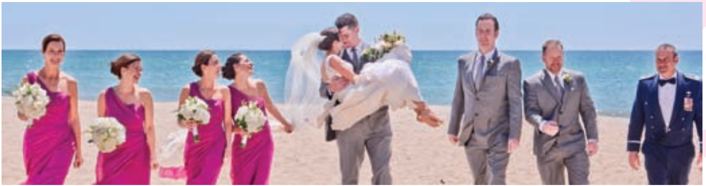
Sometimes a beautiful destination wedding is the way to go. Check with your local travel agent for ideas.