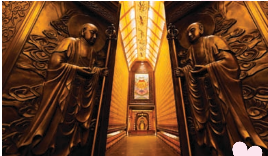
At Nanjing Niushoushan Cultural Park, visitors learn about ancient Buddhist traditions.

imagine. Nanjing Lukou International Airport is 40 miles from the city center, and nonstop flights are available from several North American gateways. Many visitors travel by bullet train to Nanjing, as it is 3 1/2 hours from Beijing and just 90 minutes from Shanghai. More than 100 hotels offer a variety of options, from budget to luxury