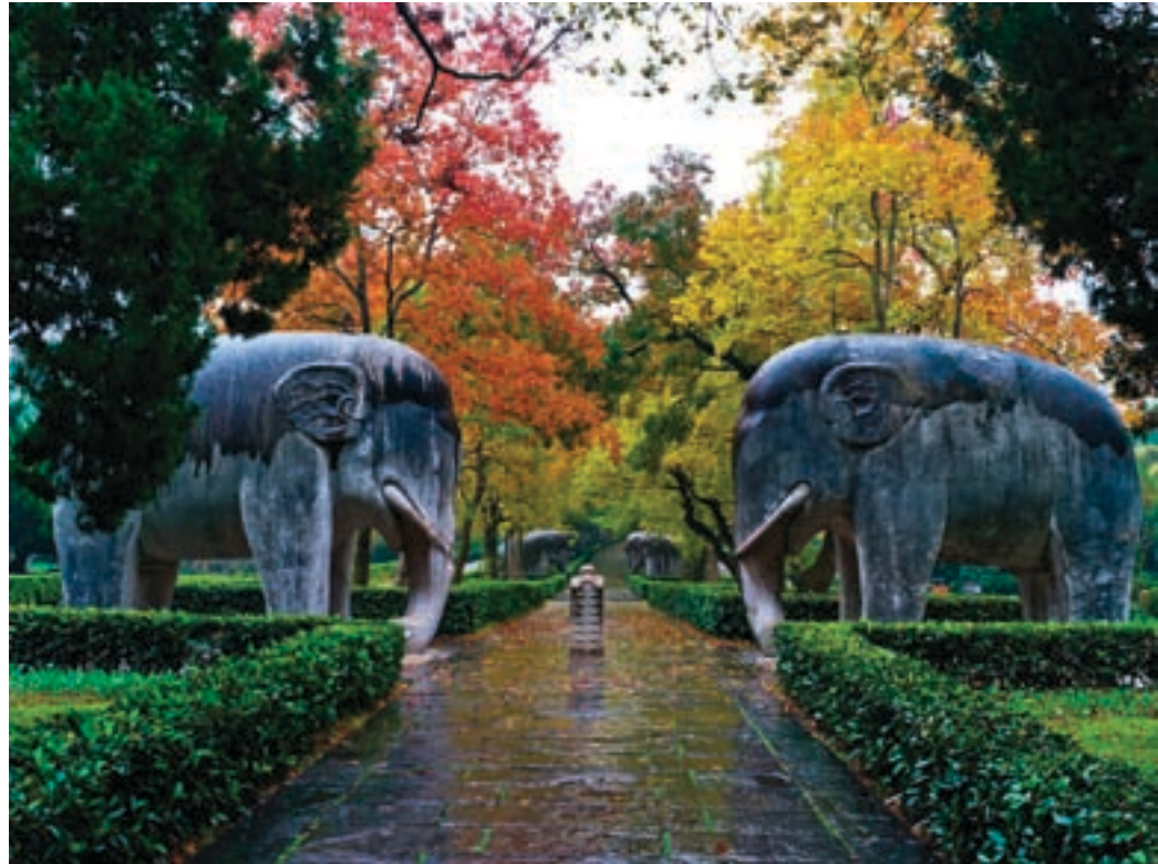
The Sacred Path leads the way to Ming Dynasty-era tombs in Nanjing.

Nanjing Museum is one of the first museums established in China and is still one of the country's largest. Visitors explore exhibits ranging from ancient civilization through the early days of the Republic.