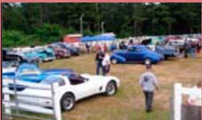
Classic Car Show Wednesday, July 24 6:00 PM Dellinger Ring

Friday, July 26 @ 8:30 PM on THAYER STAGE