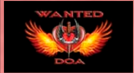
Wanted: DOA The Bon Jovi Tribute Band that will make you remember