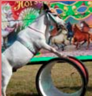
Horses, Horses, Horses