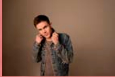
Trent Harmon 2016 American Idol Winner Singing "You Got 'Em All"

Friday, July 26 @ 8:30 PM on THAYER STAGE