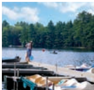
Sandy Beach RV Resort, Contoocook