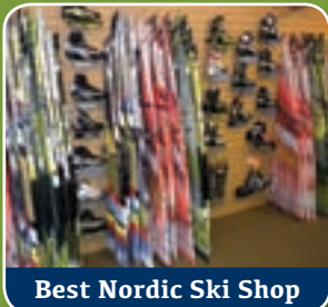
Best Nordic Ski Shop