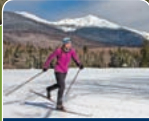
Scenic Trail System