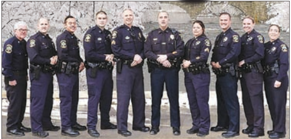
The Messenger salutes not only the brave men and women of the Henniker Police Department, but the officers of all our area Departments. Thank you for keeping us safe.