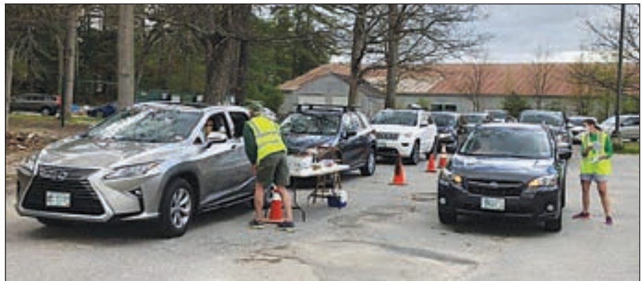
Hopkinton's Drive-By Voting drew such a large turnout that the line of cars resembled those on the way to Gillette Stadium for a Patriot's game, stretching from the backside of the High School to the Mobil Station.

Article 12: No additional comments were received on Article 12. With this, the Moderator recessed the 2020 Hopkinton School District Meeting to Saturday, May 30, 2020, at 8:30 am, at the Hopkinton Middle High School for voting on Article 3, the Operating Budget.