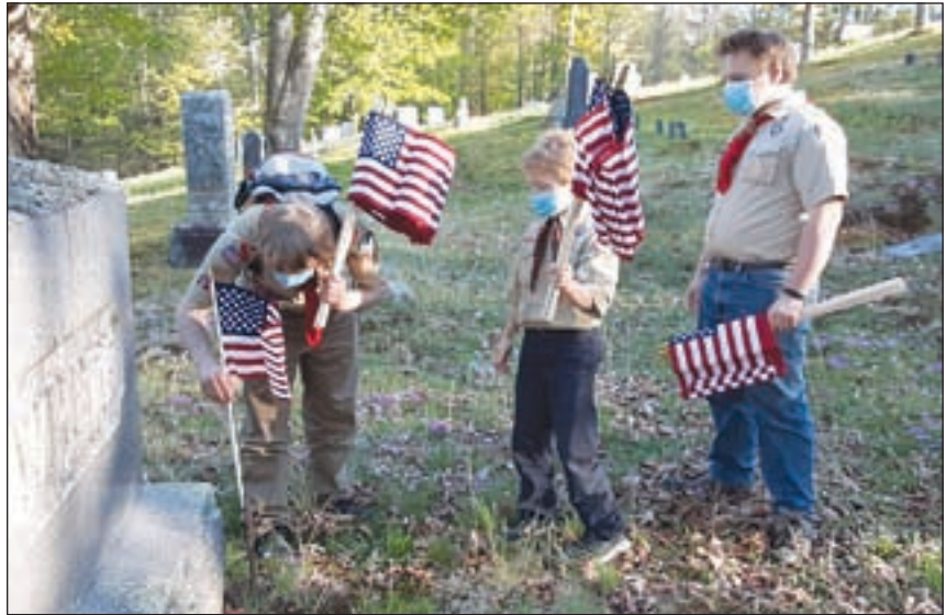
The Boy Scouts of Troop 2, along with the Myers-Prescott-Olson American Legion Post #50, placed US flags on the graves of all the veterans in all five Antrim cemeteries Wednesday.

1882, but the older name didn't disappear until after World War II. It wasn't until 1967 that federal law declared "Memorial Day" the official name.