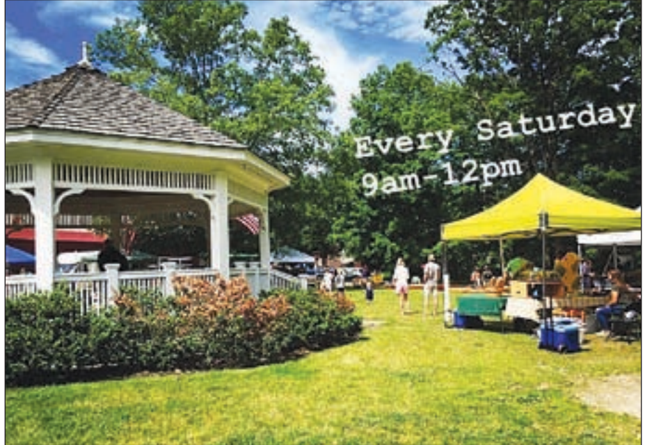
The Contoocook Farmers Market.

no fun! -- KIDDING, we're really looking forward to seeing everyone but ask that you leave the market promptly. Thank you so much for your continued support!