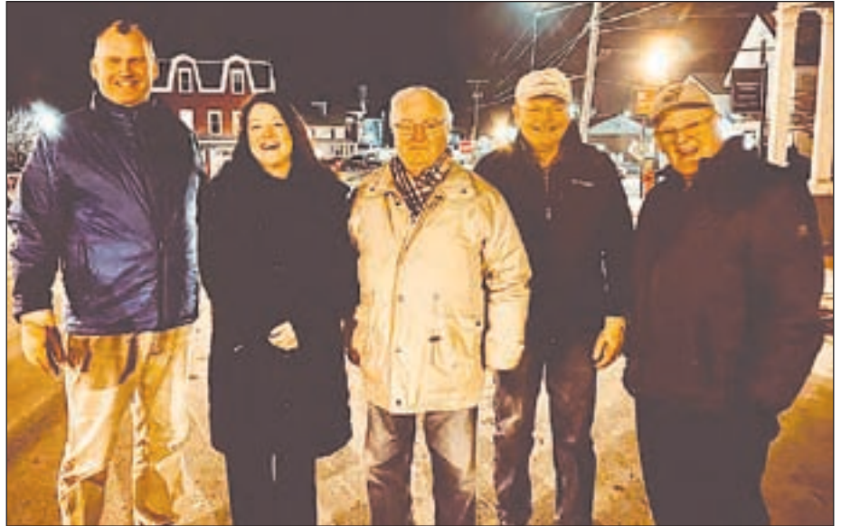
Rumors of a band of vagabonds roaming the streets of Henniker have been proved unfounded.

All Legion participants will be wearing masks and march in open formation, eight feet apart. The public is welcome to attend so long as they are appropriately distanced and wearing masks.