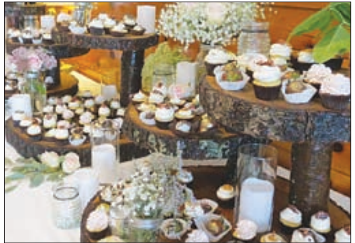
WMUR-TV9 viewers rated Wicked Sweet Cakes and Treats in Warner as the 4th best place to buy cupcakes in NH.

HENNIKER PHARMACY • 603-428-3456 P.O.Box 718 • Proctor Square • Henniker, NH 03242