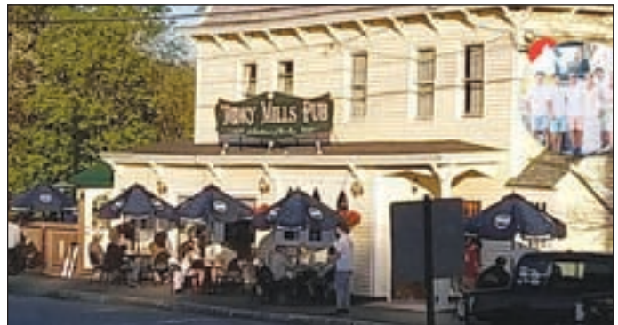
The first day of sidewalk dining at Tooky Mills was a great success.