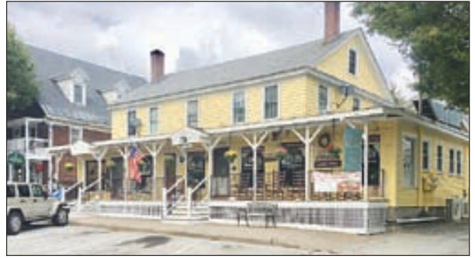
Covid-19 has claimed two popular Warner restaurants. Schoodacs (l) has closed after five years and the Foothills of Warner (r) is up for sale.