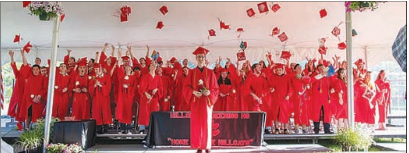
Unfortunately this scene may not be repeated this year, cheating 2020 graduates out of one of the most memorable occasions of their young lives. Nevertheless, we join our readers in congratulating the Class of 2020 and wishing them a bright future.