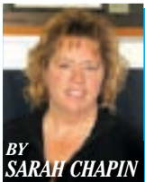
BY SARAH CHAPIN

The use of antibiotics drives the development of antibiotic resistance, a major threat to public health worldwide. But these drugs also carry the risk of harm to individual patients, including children. According to a new analysis published in the Journal of the Pediatric Infectious Diseases Society , antibiotics led to nearly 70,000 estimated emergency room visits in the U.S. each year from 2011-2015 for allergic reactions and other side effects in children. Most of the visits (86 percent) were for allergic reactions, such as rash, pruritus (itching), or angioedema (severe swelling beneath the skin). The risk of a visit varied by child age and type of adverse drug event. Forty-one percent of visits involved children in this age group. Amoxicillin was the most commonly implicated antibiotic in adverse drug events among children aged 9 or younger, while sulfamethoxazole/trimethoprim was most commonly implicated among children 10-19 years old.