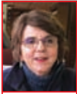
By: Joyce Bosse

Home equity is the dollar-value difference between the balance you owe on your mortgage and the value of your property. When you refinance for an amount greater than what you owe on your home, you can receive the difference in a cash payment (this is called a cash-out refinancing). You might choose to do this, for example, if you need cash to make home improvements or pay for a child's education.