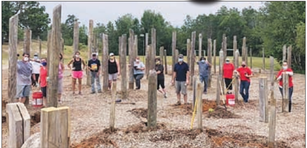
A band of masked vandals virtually destroyed the old HDES playground over the weekend. The H-D PTO plans to finish the job before installing the new one. Great job on a terrific community project.