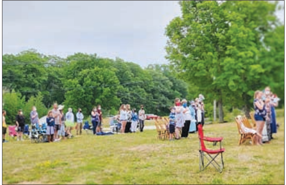
Hawthorne Academy's first graduation ceremony.