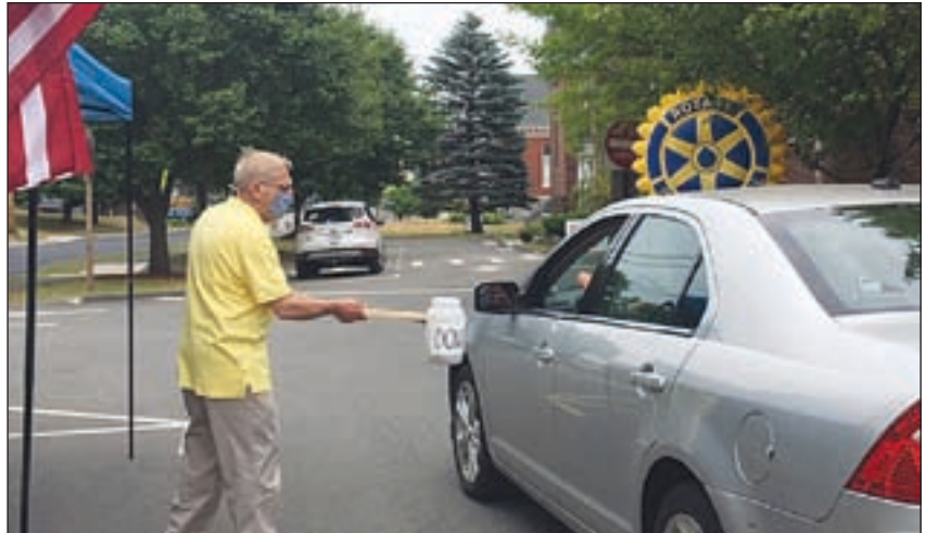
The Henniker Rotary Club participated in MaskUP New Hampshire by distributing free face masks at the Henniker Community School on Saturday and the OSRAM parking lot on Sunday.

Bennington's GEP Dodge Library is celebrating this year's Summer Reading Program entitled "Imagine Your Story." The summer reading program began June 29 and will run through July 31. Registration is ongoing through the start of the program. Please call- 588-6585 or email the library to sign-up to join in the weeks of reading and fun.