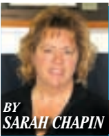
BY SARAH CHAPIN

A new study, published in Molecular Psychiatry , suggests that ezogabine, part of a class of drugs known as potassium channel openers, may have an antidepressant affect in humans. Researchers found that patients with Major Depressive Disorder (MDD) exhibited a significant reduction of depressive symptoms after being treated with ezogabine, an FDA approved drug used to treat seizures. After treatment, patients showed a 45 percent reduction in depression, a significant reduction in anhedonia, the inability to feel pleasure; and a significant increase in resilience.