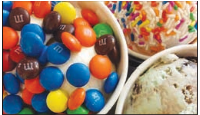
Ilsey's Ice Cream in Weare was voted the 2nd best ice cream shop in NH by Chanel 9 Viewers. It was rated #1 by Union Leader readers. People love the homemade ice cream at Ilsey's Ice Cream, saying that if you haven't been there, you're missing out on some of the best.