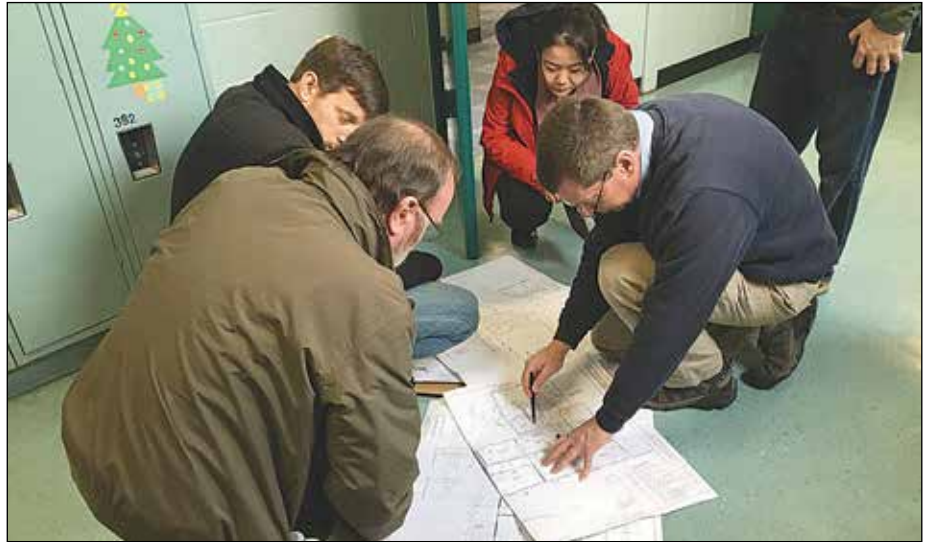
Adjustments are made as the projects continue.

The Board agreed and made the appointment effective when the elected term expires.