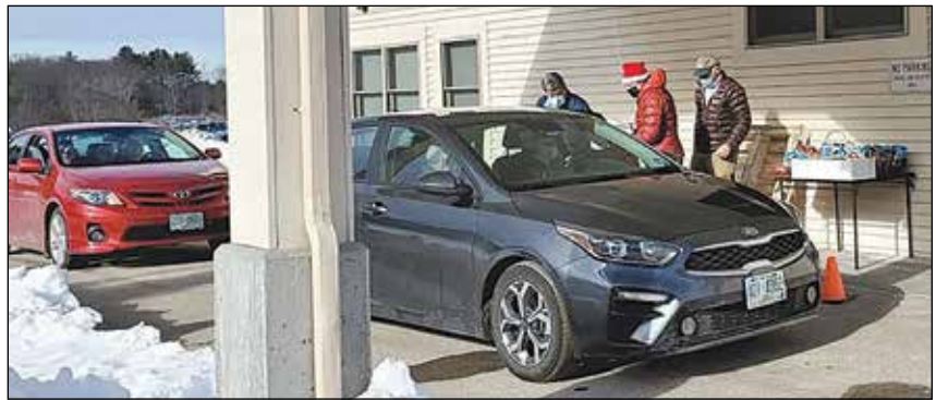
The Hopkinton Rotary Club's annual Senior Holiday Dinner looked a little different this year, but the drive-thru diners were full of good cheer!

Persons wishing to submit warrant articles for inclusion in the 2021 John Stark School District warrant must submit such warrants to the John Stark School Board, c/o Office of the Superintendent no later than January 12, 2021. Voting Day is March 9, 2021.