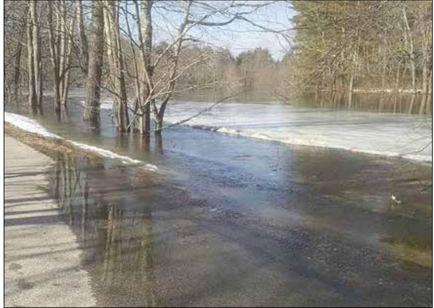
Heavy rains have washed out River Road in Henniker.

immediate short term, "there will be no major changes in the delivery of services" for LRGHealthcare patients.