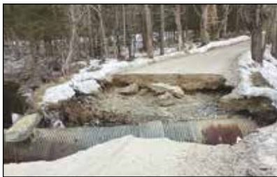
Heavy rains caused this washout on Hillsborough’s Stowe Mountain Road.