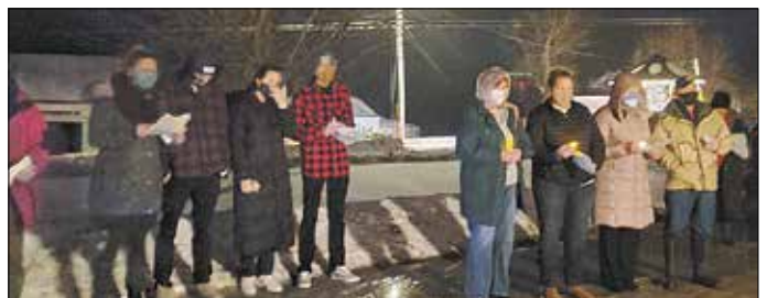
Washington residents gathered on the Common Christmas Eve to sing carols.

Thirteen communities throughout the state will host COVID-19 vaccination centers for first responders and health care workers who provide care outside of hospitals, Gov. Chris Sununu announced Monday. The two groups are included in the Phase 1A priorities of the state's vaccination plan. The locations are in Claremont, Concord, Exeter, Hooksett (SNHU), Keene, Laconia, Lebanon, Littleton, Londonderry, Nashua, Plymouth, Rochester and Tamworth. Based on population density, seven vaccination sites will operate five days a week; six sites will operate two to three days a week. Eligible first responders will be alerted to schedule an appointment through professional associations, licensing boards, provider groups, and their organizations.