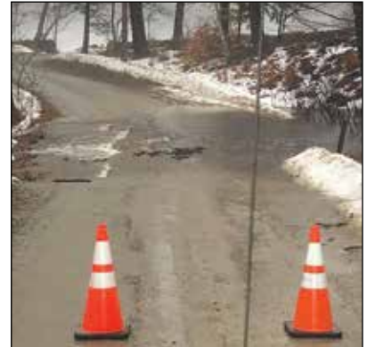
Old Dublin road in Hancock will be closed from the four way at Jaquith to the Harrisville town line.

will create a video that we will post on our website so you can paint whenever you have the time. We will have a limited number of paint kits available for a minimal fee, or you can use your own supplies. Call the library to register, 464-3595.