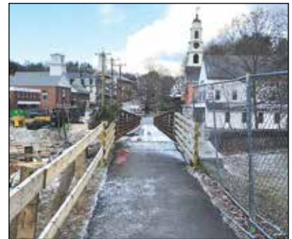
Peterborough's pedestrian bridge has reopened.