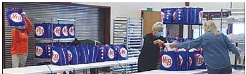
The Cafe staff at John Stark Regional High School prepared 10 meals (five breakfasts and five lunches) each for 62 students to have during the holiday break. They then loaded them up on a bus to be delivered to the students' homes.

pus. For fans who can't get tickets, there will be a way to watch your team this winter. Games at Merrimack Valley, Bow, Stark, Kearsarge and Coe-Brown will all be live streamed using new cameras from the National Federation of High Schools. To subscribe to this service and stream games, go to nfhsnetwork.com . The schools that didn't get the new cameras – Brady, H-D, Hopkinton and Pembroke – have all agreed to stream games at their schools on Facebook.