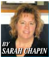
BY SARAH CHAPIN

A study of thousands of patients' health records published in the journal Diabetes Metabolism Research and Reviews found that those who were prescribed cholesterol-lowering statins had at least double the risk of developing type 2 diabetes. Statins are a class of drugs that can lower cholesterol and blood pressure, reducing the risk of heart attack and stroke. More than a quarter of middle-aged adults use a cholesterol-lowering drug, according to recent federal estimates. Researchers found that statin users had more than double the risk of a diabetes diagnosis compared to those who didn't take the drugs. Those who took the cholesterol lowering drugs for more than two years had more than three times the risk of diabetes.