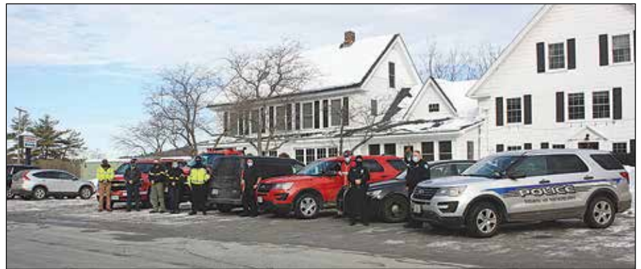
The Fenton family believes in giving back to the community.