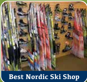
Best Nordic Ski Shop