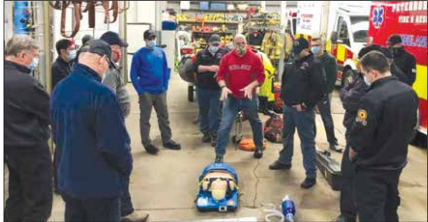
Peterborough Fire & Rescue has moved its training to Monday nights and increased the time focusing on skills mastery. The current series of training nights focused on ice rescue emergencies and post rescue care to include hypothermic and drowning event cardiac arrest care.

(stipend) paid staff is available in Town. This leaves a single individual responding to a call with the ambulance in the hope that the on-call staff member arrives at the location. The Chief agreed to review the weekend staffing.