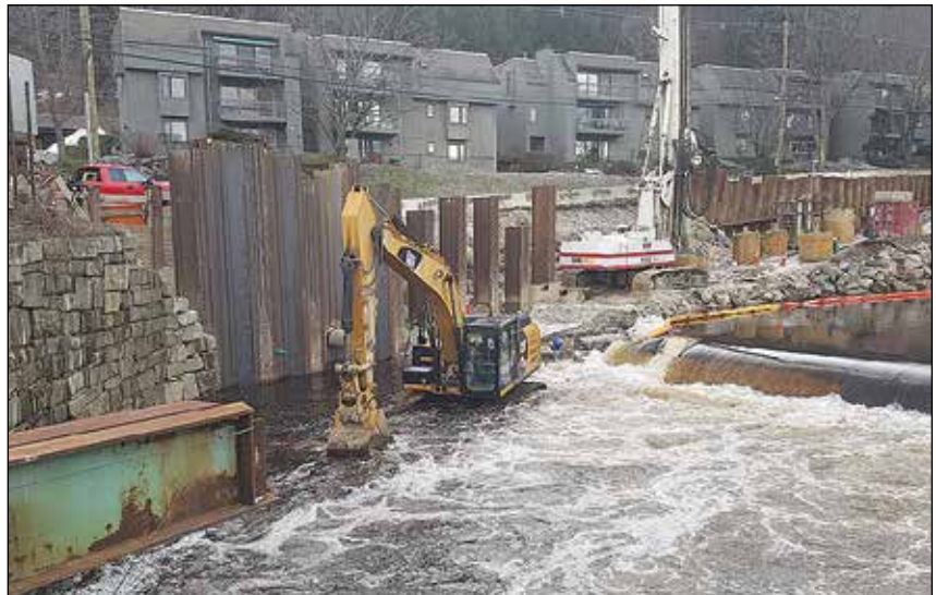
Peterborough construction crews had to wait for the river to subside before pumping down the water in the west cofferdam to gain access and resume working. The flooding will not delay the overall schedule of the Main Street Bridge project.