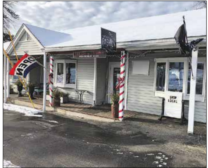
Trends of Fashion was recently burglarized.