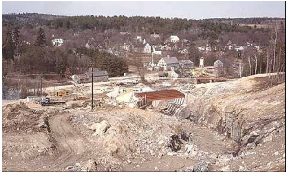
Interstate 89 under construction through Warner.

This evening is the first of an ongoing series of conversations facilitated by the Warner Historical Society. The next will be on Wednesday March 31. We'll use zoom