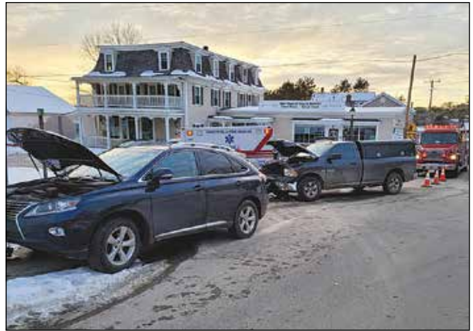
Wednesday afternoon at 3:30, Greenfield Fire, Police and Wilton Ambulance responded to the intersection of Forest Road and Slip Road for a minor motor vehicle accident. Thankfully only minor injuries. Traffic was impacted as this is a bad time of the day and Slip Road was closed. The vehicles were removed quickly and traffic resumed.