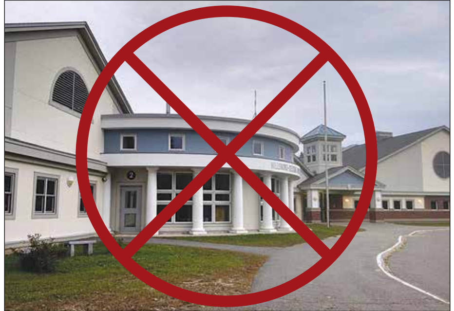
Hillsboro-Deering Middle School.

resumes as a hybrid. Skiing and bowling will be allowed to continue due to social distancing and cleaning protocols at the event sites.