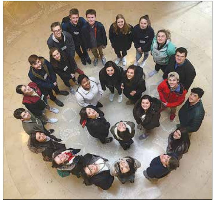
Capital Area Student Leadership Class of 2020 touring the New Hampshire Historical Society last year during History & Culture Day.