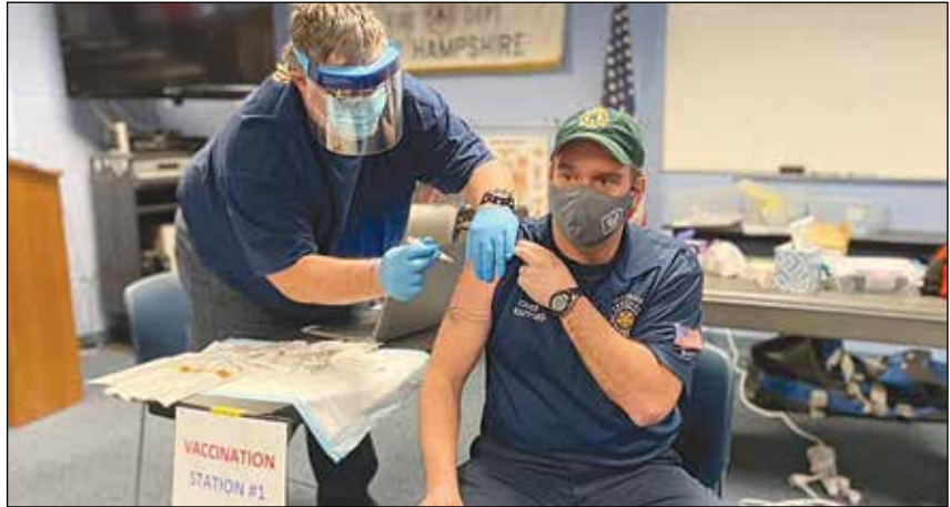
Hillsborough's First Responders have begun receiving their Covid-19 vaccinations.