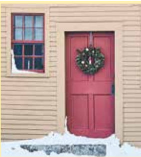
Canterbury Shaker 6 Village receives Grant