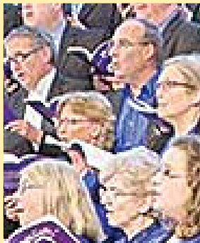
Concord Chorale is 4 free virtual concert