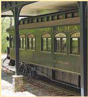
1903 Pullman car named 3 Sunbeam at Hildene