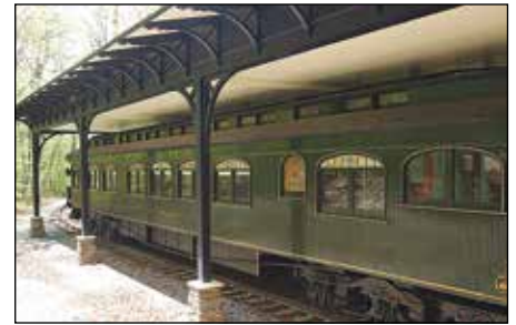
Hildene's prized Pullman car, Sunbeam.

Elephant Sanctuary, Tennessee. Tuesday, February 9 at 2:00pm. Please register prior to Monday, February 8 "The Elephant Sanctuary in Tennessee exists to provide captive elephants with individualized care, the companionship of a herd, and the opportunity to live out their lives in a safe haven dedicated to their well-being, and to raise public awareness of the complex needs of elephants in captivity, and the crisis facing elephants in the wild. Located on 2,700 acres in Hohenwald, TN, The Elephant Sanctuary is the largest natural habitat refuge in the country dedicated solely to the care of African and Asian elephants retired from zoos