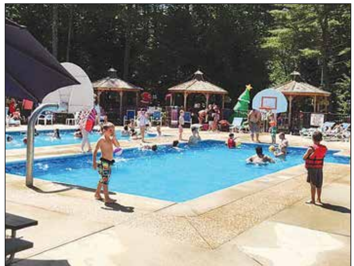
WMUR TV-9 viewers voted Friendly Beaver Campground as #1 in the state.