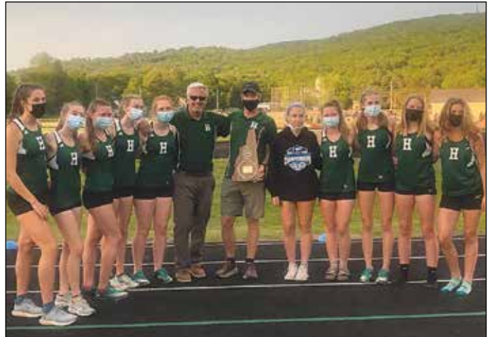
Hopkinton's Championship Track Team.