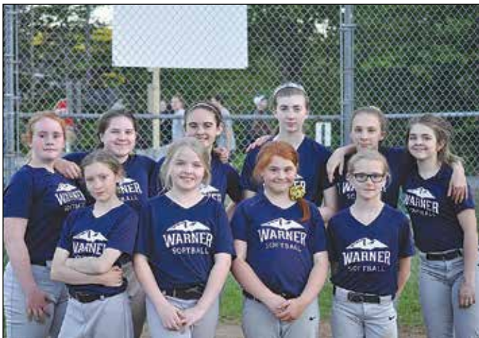
Warner's Youth Girls Softball Team.