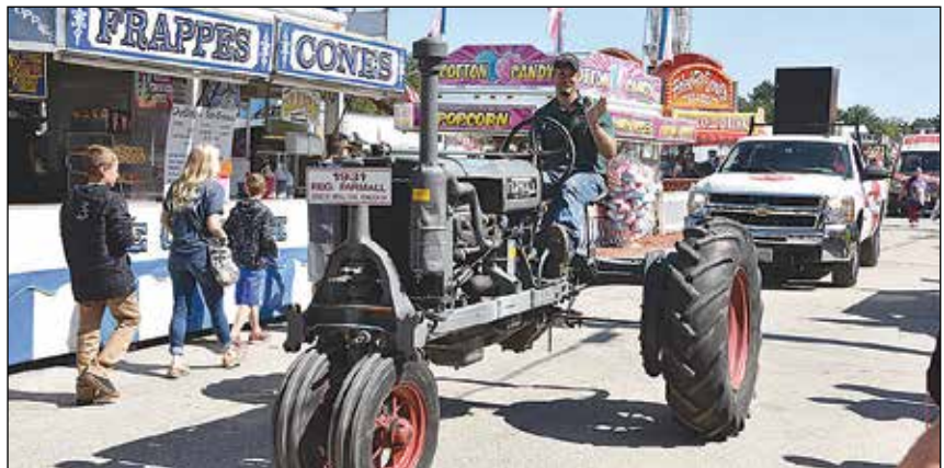
Hopkinton State Fair is officially opening for 2021. In fact, they have added an additional day. The fair will open its gate on Thursday at 5pm and run through Labor Day (Monday). We are looking forward to welcoming everyone back to the fairgrounds.

Lakes provides a grant that partially covers the cost of boat checks by Lake Hosts for invasive aquatic species. The remaining cost is funded by Deering taxpayers via designated trust funds.