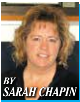
BY SARAH CHAPIN

As the antimalarial drugs hydroxychloroquine and chloroquine have drawn attention as potential therapies for COVID-19 and are being widely used off-label, it's now more important than ever to have a thorough assessment of the safety of these medications. A recent analysis published in the British Journal of Clinical Pharmacology provides new insights. In the analysis of real-world data from the Food and Drug Administration Adverse Events Reporting System, a global database of post-marketing safety reports, hydroxychloroquine and chloroquine were associated with higher rates of various cardiovascular problems, including life-threatening heart rhythm events, heart failure, and damage to the heart muscle itself (termed cardiomyopathy).