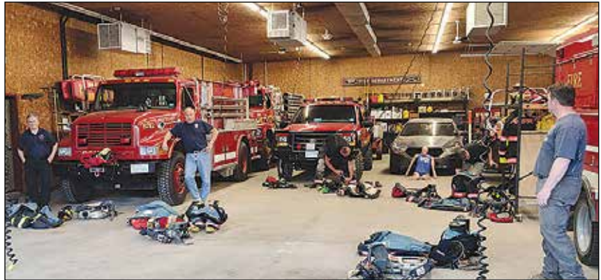
Bradford Firefighters recently performed several different evolutions to continue refining their craft. Members practiced donning their protective ensemble in the allotted time frame, setting up a rural water supply operation, operating multiple hand-lines and roof operations. Our members continue to strive to be their best for our community. We look forward to seeing you soon.

decision. "Instead of clearly "designating building envelopes," specifically stating what "public benefits" they felt important... Planning Board relied on opinions and concerns which were subjective, legally undefined, or unreasonable in denying this subdivision."