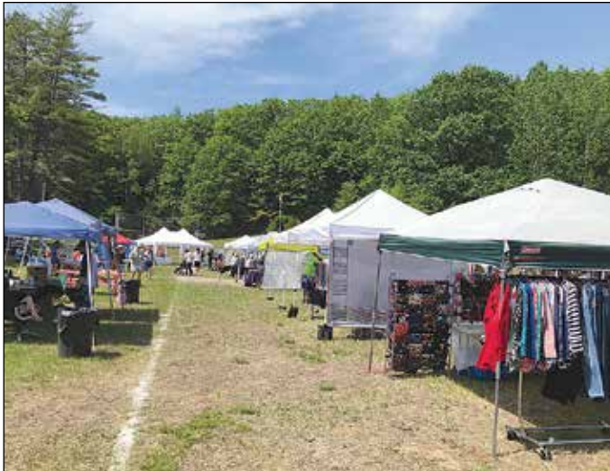
Bennington held another successful Rhubarb Festival on Saturday.