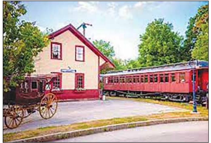
The Contoocook Railroad Museum and Visitors' Center.