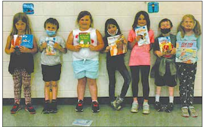
The Hillsboro Lions Club recently expended $2,500 to supply every K-5 student in the Hillsboro-Deering and Washington Schools with a free book of their choice. The Club also purchased Dictionaries for every 3rd grader in this school. Shown are Washington kindergarteners (L) and 1st Graders (R).