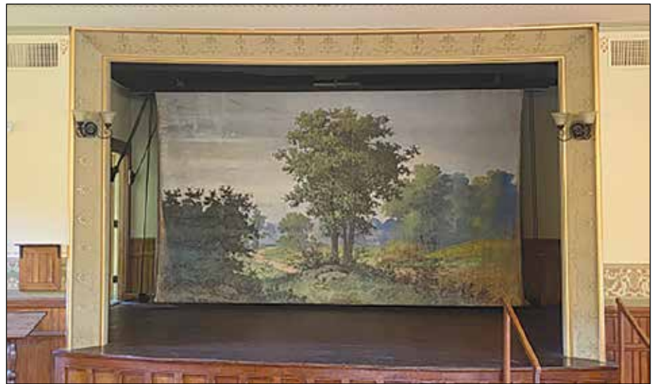
Historic stage curtains restored.

Conservators expertly cleaned the curtains of existing dust and dirt, mended the curtains by stabilizing any rips and tears throughout, and stabilized raw edges at top, bottom and side edges as needed to prevent vertical or horizontal rips. They selectively in-painted mended areas and disfiguring stains using appropriate paints. The conservators, with Town staff and HDC volunteers, replaced the curtain top boards, installed new ropes with