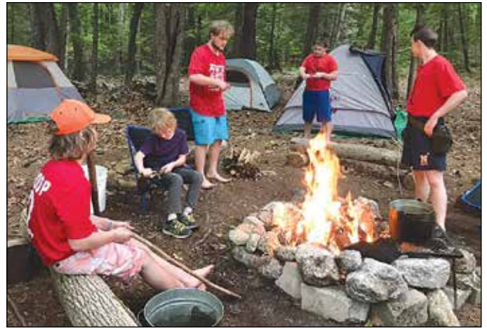
Antrim's Troop 2 has returned from a great weekend campout at Gregg Lake. Battle Boats, night paddles, swimming, fishing, Manhunt, s'mores and some chopping of wood.

Contact: deb.chandler@robinhillfarm.com or call 603-464-1321