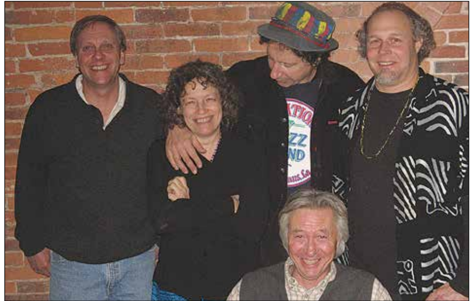
Tattoo to perform at Henniker Summer Concert Series on July 13.

There is no provision for moving indoors this summer.