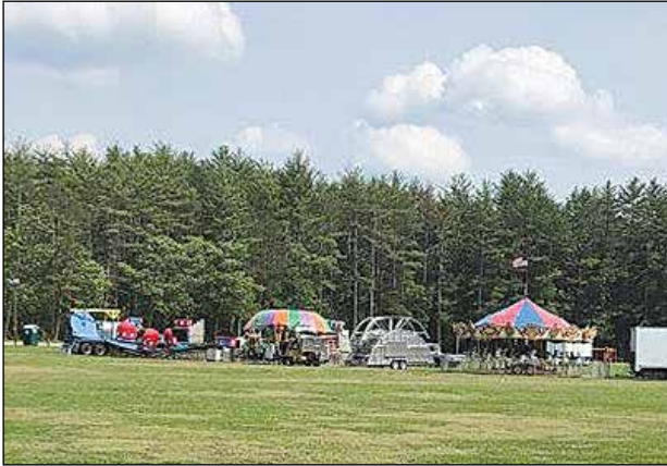
Miller Amusements and some of the other vendors have begun to arrive for the kick-off of Hillsborough's SummerFest. See the schedule on page 2.