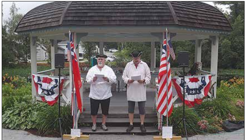
Reciting the Declaration of Independence.