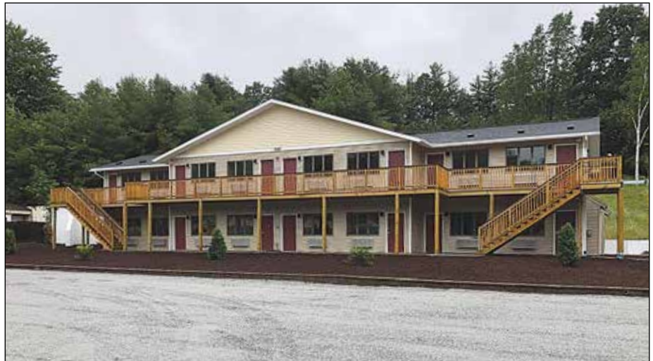
Bridge Street Recovery Center.

Bridge Street Recovery, Bennington's new transitional housing facility for those in recovery from addiction, opens its doors next week, according to its co-founders. The facility, at the long closed Highland Inn across from the Crotched Mountain ski resort, broke ground last fall at 608 Frances-town Road. The 40-bed residential care and transitional housing facility will provide both emergency and long-term care to New Hampshire residents recovering from addiction. The company also plans to open a 64-bed detox facility in Peterborough in 2022.