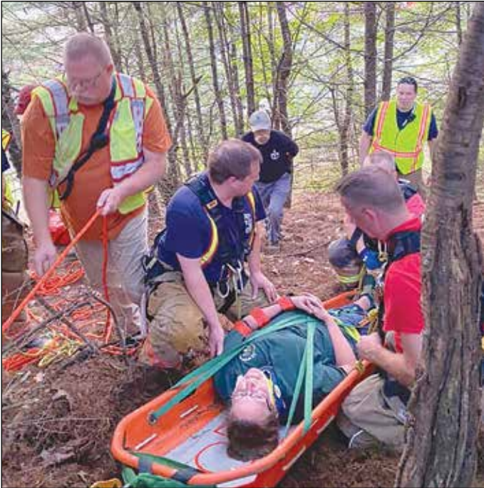
New Boston Fire Department conducted training on a rope rescue scenario behind Central School.