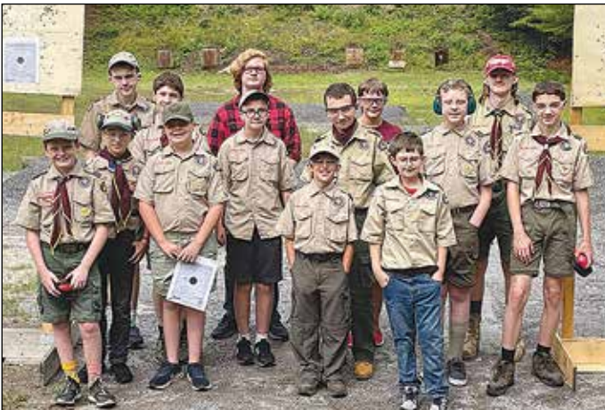
It was a busy and fun weekend for Troop 99. Starting out with a troop shoot on Saturday at Goffstown Fish & Game Association, (above) followed up with an 8-mile hike at Tower Hill Pond in Auburn on Sunday, (below).