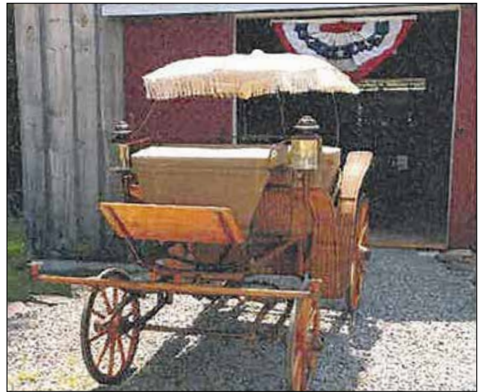
A lifetime journey - starting in 1850 in Ogantz, PA destined for Hob & Nob Farm in Francestown, NH, then on to Charleston, SC from where it once again returned to Francestown, NH for quite likely what will be its final home in the Francestown Heritage Museum.