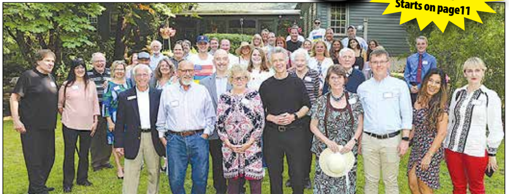
U.S./Ukraine relations were fostered at a Henniker gathering Saturday.