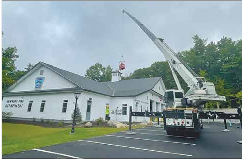
Newbury Fire Station.

The $3,750,000 new station approved at the 2020 Town Meeting, constructed by North Branch Construction, and coordinated by construction manager and on-call firefighter Ken Holmes has been completed. The new station will meet the needs for space; present and future equipment; safe traffic patterns for the trucks and firefighters on foot; adequate training space; and will serve an Emergency Operations Center. The 9,973 sq. ft. building is equipped with 3 drive through bays capable of housing 6 pieces of apparatus; gear room; wash area; short- and long-term contamination areas; storage; EMS and administrative offices; janitor area; radio room; kitchenette; and day room. The