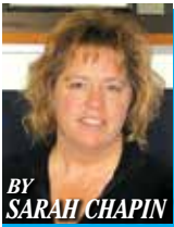
BY SARAH CHAPIN

A common drug, already approved by the Food and Drug Administration (FDA), may also be a powerful tool in fighting COVID-19, according to research published recently in Antiviral Research . SARS-CoV-2, the virus that causes COVID-19, uses a surface spike protein to latch onto human cells and initiate infection. But heparin, a blood thinner also available in non-anticoagulant varieties, binds tightly with the surface spike protein, potentially blocking the infection from happening. This makes it a decoy, which might be introduced into the body using a nasal spray or nebulizer and run interference to lower the odds of infection. Similar decoy strategies have already shown promise in curbing other viruses, including influenza A, Zika, and dengue.