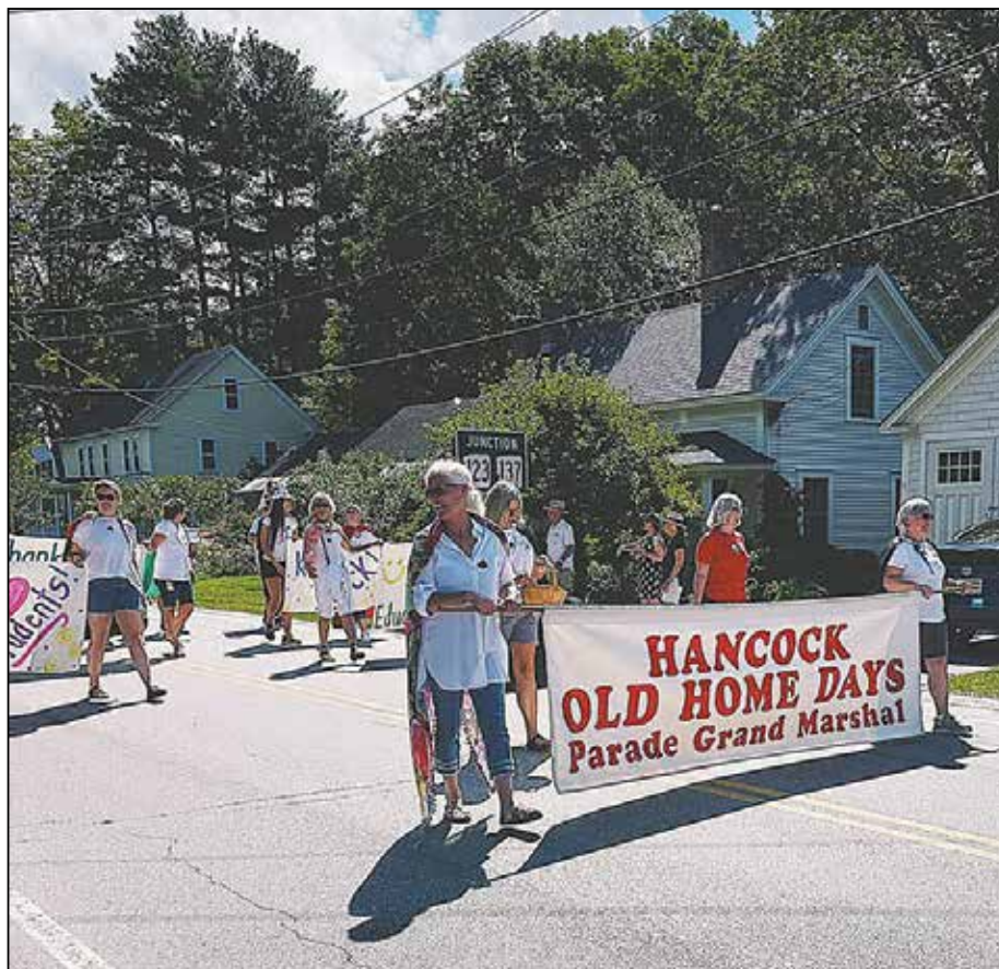
Hancock celebrated another successful Old Home Days.

Get off your backsides and join one of these groups today. Yes, the pay is low and the hours long, but what you receive is priceless. You meet new friends, share satisfying experiences, gain a sense of satisfaction in helping others, not to mention having a hell of a lot of fun doing it.