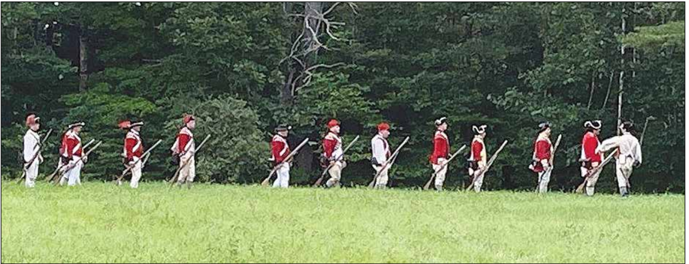
History Alive visitors were thrilled by the authentic French and Indian and Revolutionary War reenactors, multiple demonstrations and varied vendors at the town's fun-filled locations last weekend.