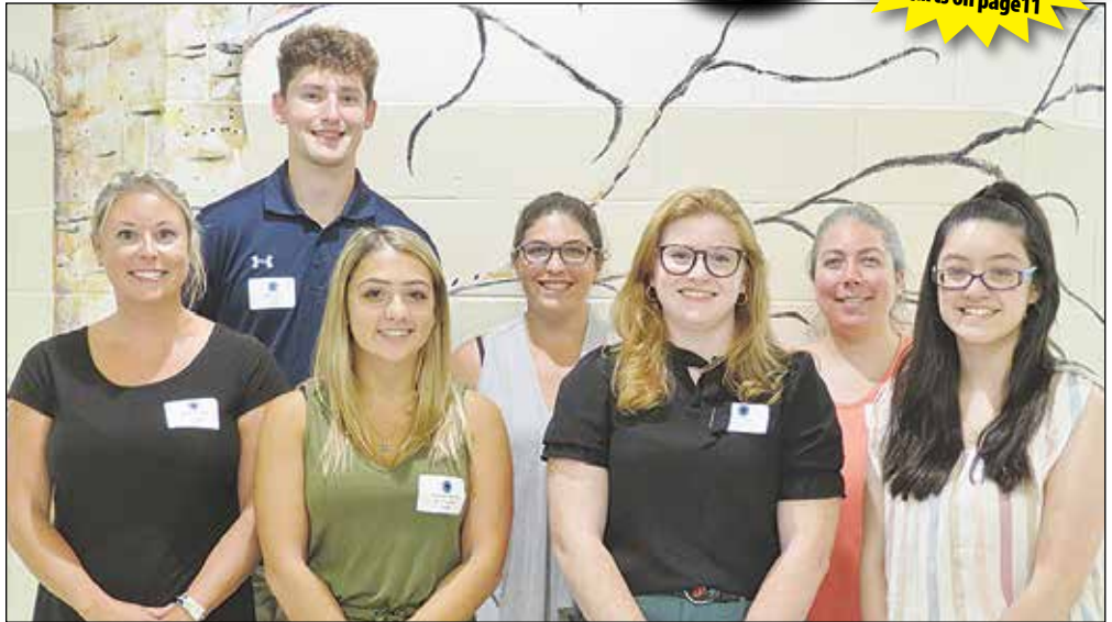
These John Stark graduates are now teaching in local schools.