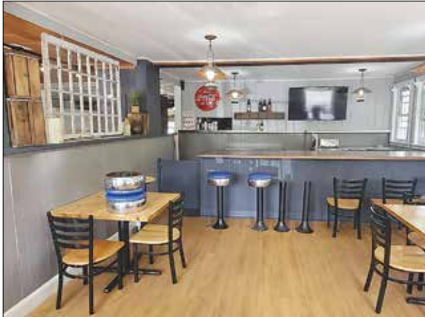
The Kitchen Restaurant in Warner, located in the former Foot-hills of Warner location, plans to open Friday September 3rd.