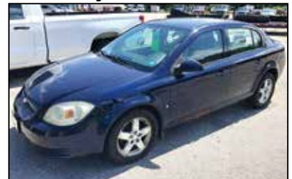
2009 Chevy Cobalt 4 Door Sedan

4 Cyl., Auto., A/C, Nicely Equipped. Dark Blue, Stk# 21A02A