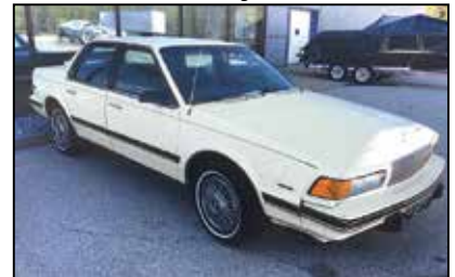
1989 Buick Century Custom 4 Door

One Owner, Senior Driven Car. Nice Shape, Well Maintained. 94K Miles. White. Stk# 19A10