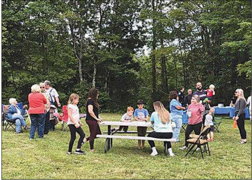
Deering residents enjoyed a Community BBQ last Saturday.

The Board scheduled a Site Walk for September 11 at 6:15 with a hearing following.