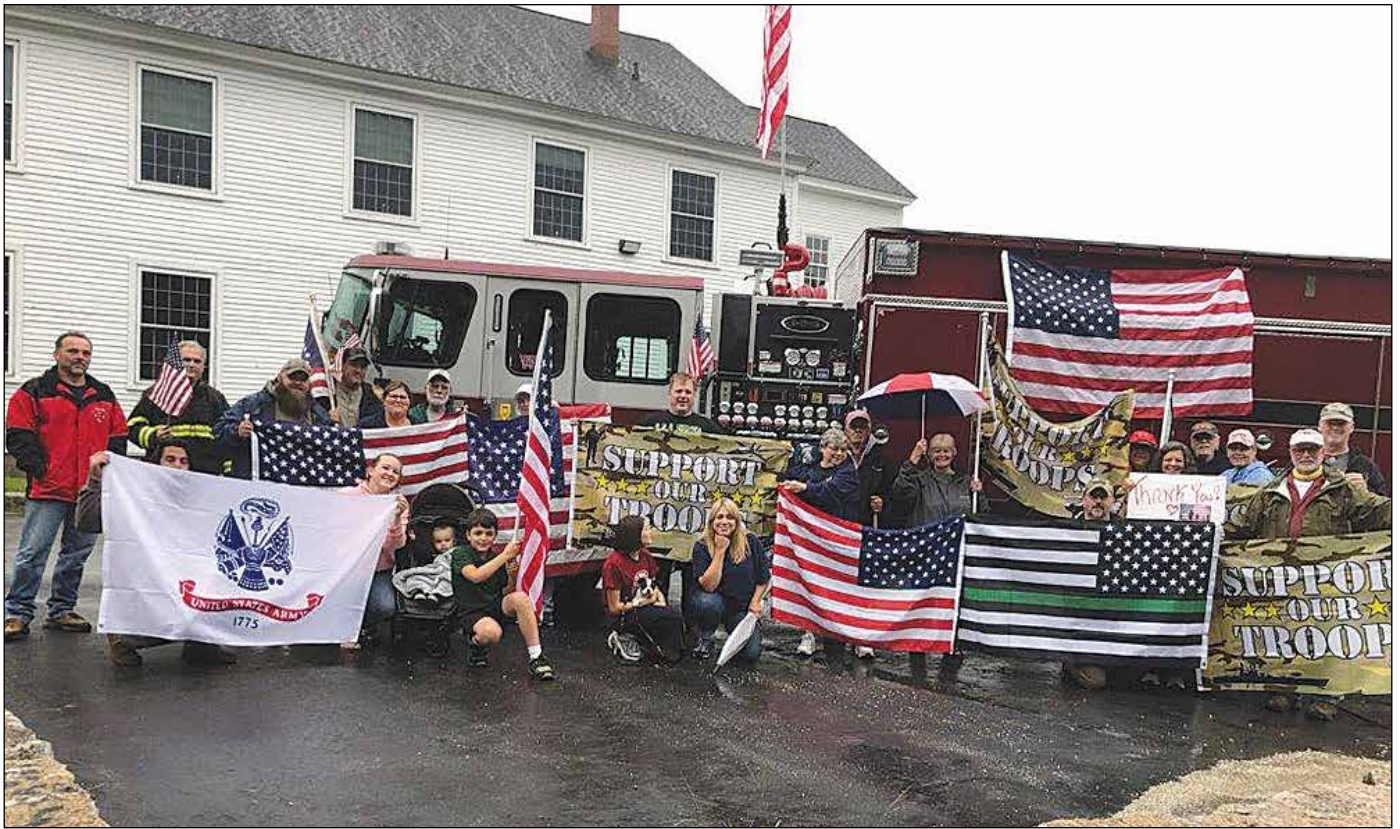
Deering residents turned out Wednesday evening to join an impromptu, state-wide "Come Together NH and Stand For Our Troops" rally. After this picture, they stood on both sides of Route 149 sending the message to passersby.