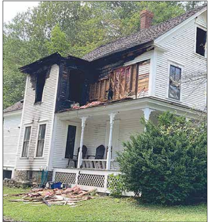
The owners were away when the fire started.