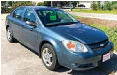
2009 Chevy Cobalt 4 Door Sedan

1 Owner. 4 Cyl, 5 Speed. A/C. Well Maintained. Clean Car! Green. Stk# 21A04