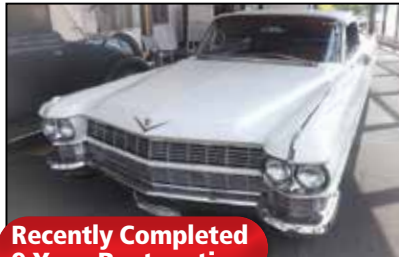
1964 Cadillac Convertible