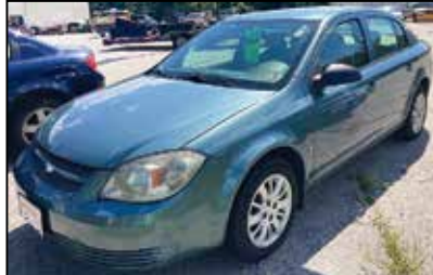
2009 Chevy Cobalt 4 Door Sedan

1 Owner. Perfectly Maintained. Excellent Shape. Well Equipped. Green Exterior. Stk# 21A03