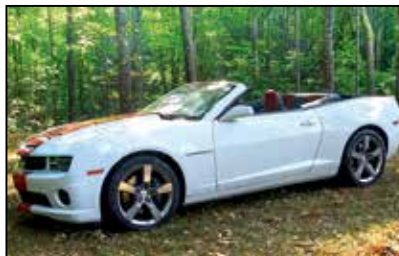
2011 Camaro 2SS Convertible

Fully Equipped w/ Every Available Option. Indy 500 Striping Pkg. 6.2 High Perf. Engine w/ 6 Spd Transmission. 8,000 Original Miles. Stored Winters.