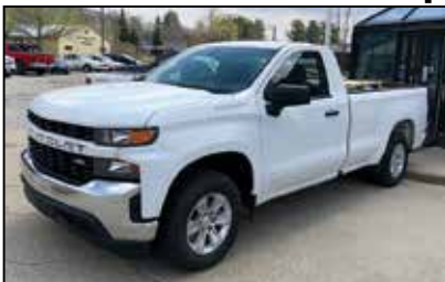
2020 Chevrolet 2WD Pickup

8' Pickup Box, 8 Cylinder Auto., Tow Pkg., Nicely Equipped and Well Maintained. Has 11,000 Miles. White. Stk# 21A01