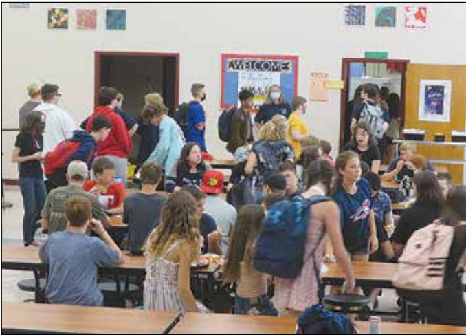
Freshman Orientation Fest was held at John Stark Regional High School on Friday, August 27. The first day for all students was August 30. The class of 2025 toured the building with Peer Leaders, met in their advisory group, and moved through the building following their class schedule. Lunch in the Cafe was followed by each student receiving a JSRHS t-shirt.