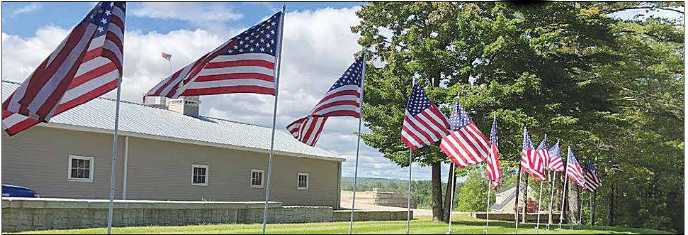
Henniker's Mitchie Corp, in conjunction with the Henniker Rotary Club's Flag Project, erected 13 American Flags to honor the 13 service men and women who lost their lives in the ISIS suicide attack in Afghanistan and the 20th Anniversary of 9/11.