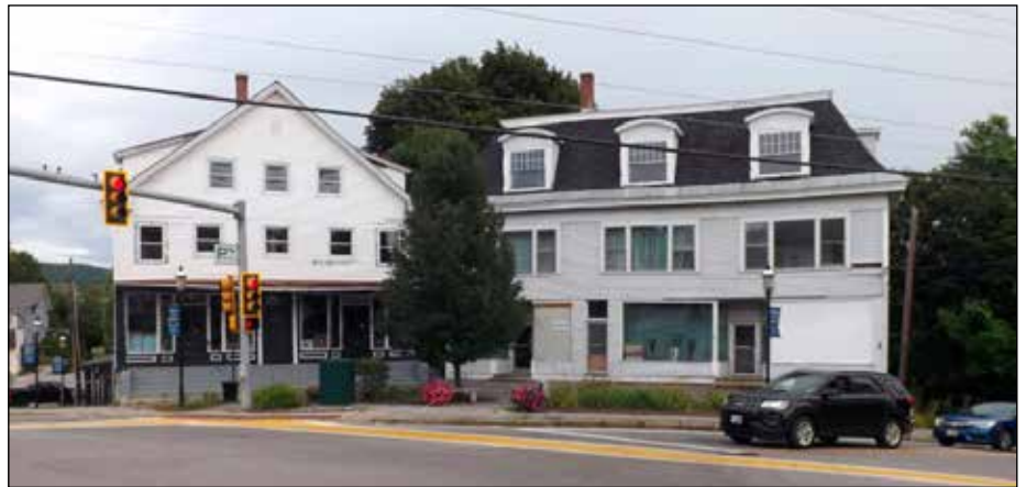
A developer is exploring renovating or replacing these empty buildings.