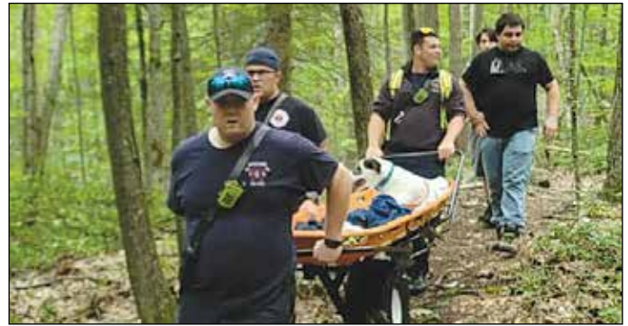
Another successful rescue.