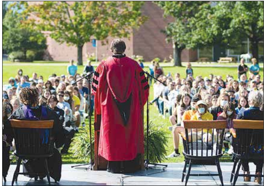
Welcome Class of 2025! Colby-Sawyer held its annual Convocation ceremony in which the college officially kicked off its 184th academic session. After the ceremony, first-year students said goodbye to their loved ones and headed straight to orientation.

hearing for next Wednesday when approval is expected.