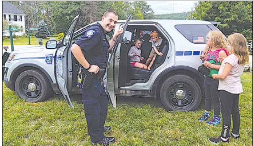
The Deering Police Department reports the breaking of a major crime ring with the arrest of four of its suspicious leaders.