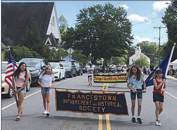
Franchestown held another spectacular Labor Day Celebration Monday.