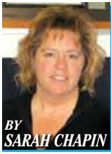
BY SARAH CHAPIN

International guidelines for asthma treatment recommend clinicians find the minimum effective dose that can control symptoms, yet asthma patients are increasingly prescribed high doses of medication. A study published in PLoS Medicine found that stepping-down medication doses did not increase asthma exacerbations and could significantly reduce medication costs. Over 5.4 million people receive asthma treatment in the UK and asthma medication comprises 13% of total primary care prescribing costs. Additionally, prolonged use and higher doses of asthma medications are associated with a higher risk for systemic adverse effects and high medication costs.