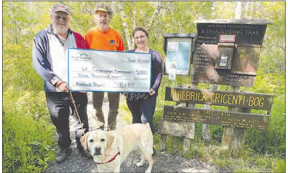
Bar Harbor Bank generously donated $3000.00 toward the walkway project at the Philbrick-Cricenti Bog trail. The first section of the new walkway has been installed, so make a visit and check it out. Future donations received will help install new walkway sections to other areas of the Bog trail.

The NLCC library box at the Clark Lookout Trail has been a successful addition to our trail system. Visitors to the trail can borrow or lend books, free of charge, when they use the trail.