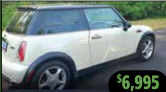
2006 MINI COOPER