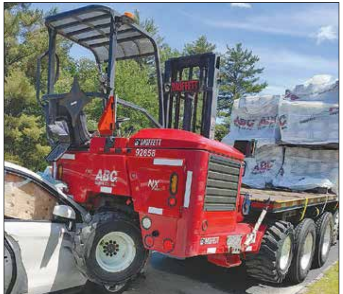
Peterborough Fire & Rescue responded to the area of 108 Hancock Road for a reported two-vehicle accident. A car had struck the rear of a truck and the two vehicles were locked together. The driver of the car was transported to Monadnock Community Hospital with minor injuries. The driver of the truck was evaluated on the scene and did not require transport.