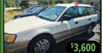
2004 SUBARU OUTBACK LEGACY