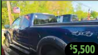
2008 FORD F150