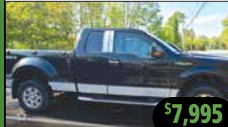
2009 FORD F150