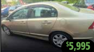
2007 HONDA CIVIC LX