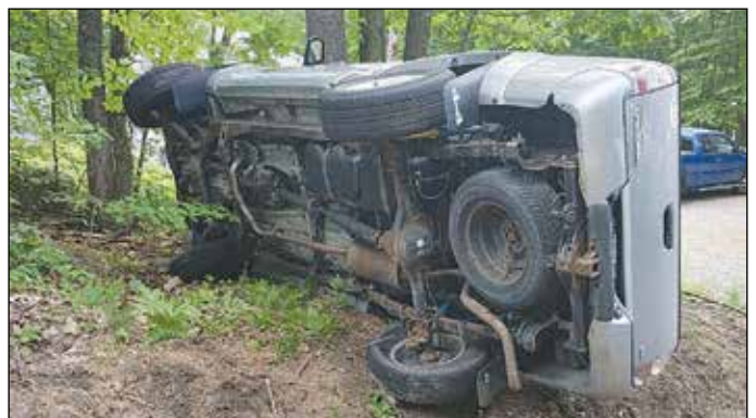
Peterborough Fire & Rescue responded to the area of 307 Wilton Road for a reported rollover accident. The driver (sole occupant) was able to self-extricate from the vehicle and was evaluated by EMS personnel while the crew from Engine 1 ensured the scene was safe and assisted Peterborough PD until the vehicle was removed.