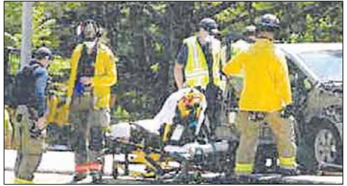
Concord police, firefighters, and EMTs were sent to Hopkinton Road for a crash between a car and a construction vehicle near Loop Road. When police arrived, they found the door of a Toyota Prius had been clipped off after crashing with a CAT front loader. The passenger was complaining of a neck injury and one person was taken to Concord Hospital later and a tow truck was requested for the Prius.