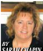
BY SARAH CHAPIN

New research presented at this year's European Congress of Clinical Microbiology & Infectious Diseases suggests that three commonly prescribed classes of drugs that are not themselves antibiotics — proton pump inhibitors (PPIs), beta-blockers and antimetabolites — could lead to antibiotic resistant infections caused by bacteria from the Enterobacteriaceae family. These antibiotic-resistant infections are in turn linked to longer hospital stays and potentially greater risk of death. The observational study underscores the importance of commonly used non-antimicrobial drugs (NAMDs) as a risk factor for antibiotic resistance, researchers say. Bacteria are thought to develop antibiotic resistance largely due to repeated exposure through over-prescribing, making recent antibiotic use a key risk factor for drug resistance. But in up to half of patients harboring drug resistant bacteria when they are admitted to hospital, there is no identifiable risk factor.