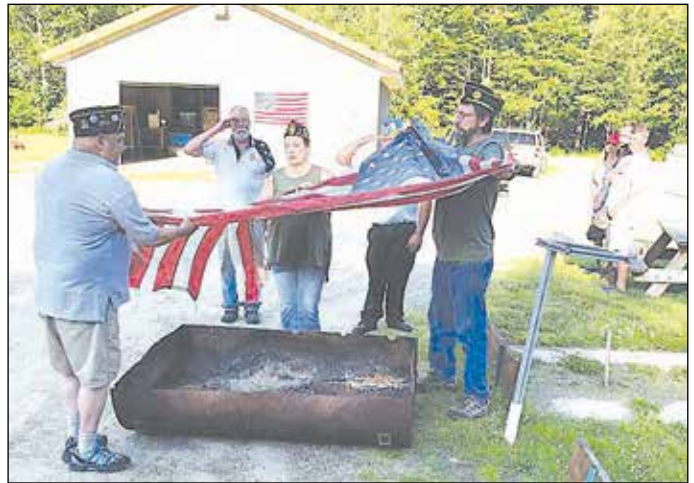
Hillsborough Post #59 American Legion.