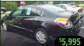
2012 NISSAN ALTIMA