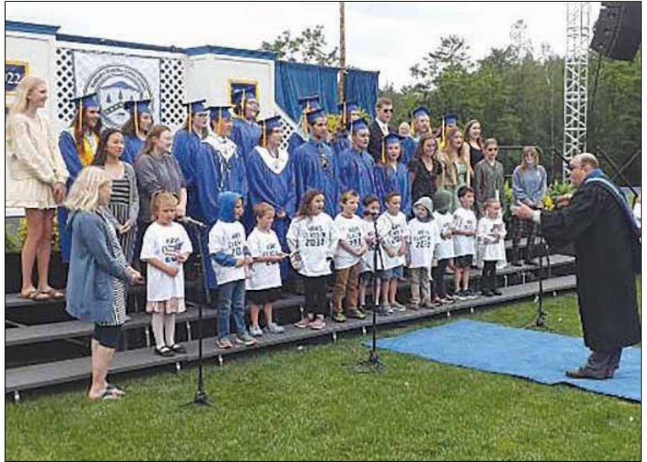
The Kearsarge High School Class of 2034 joined in the Class of 2022's Graduation.