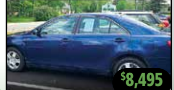
2010 TOYOTA CAMRY