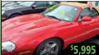
1999 JAGUAR XK8