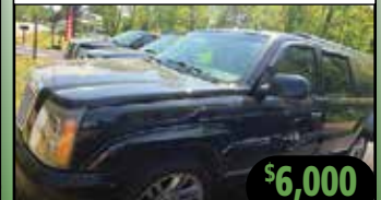
2004 CADILLAC ESCALADE