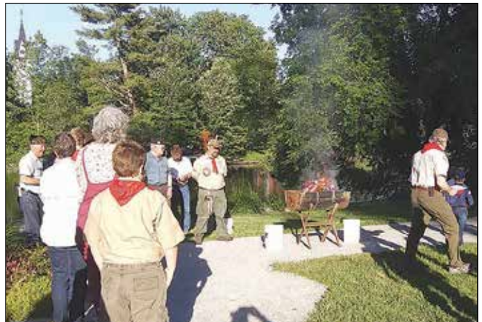
Anttrim's Post #50 American Legion and Troop 2 Boy Scouts.