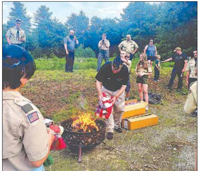
Henniker Post #78 American Legion and Troop 529 Boy Scouts.