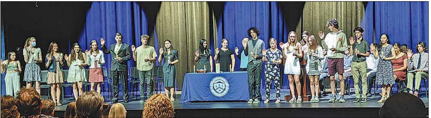
Congratulations to the newest inductees of the Kearsarge High School National Honor Society.