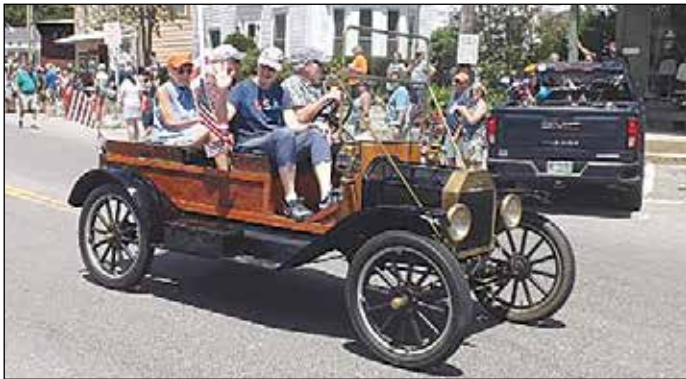
Along For The Ride.