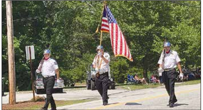
The Color Guard.