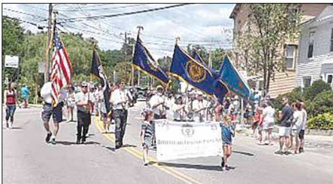
The American Legion.