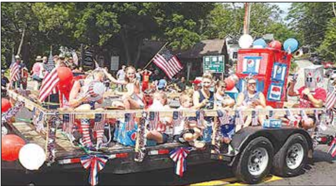
A Fun Ride.