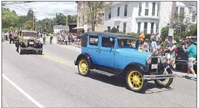
Fantastic Antique Cars.