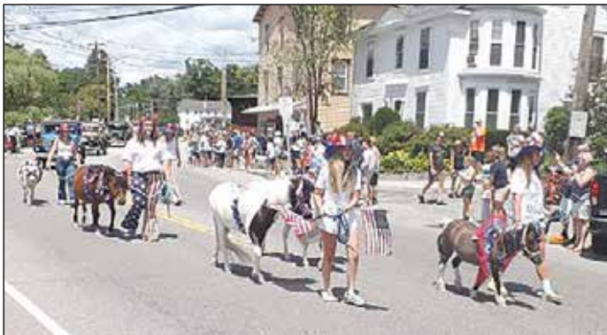
A Pony Parade.