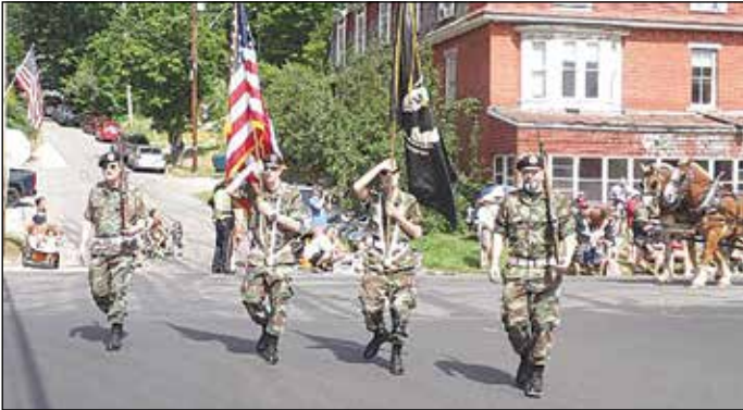
The Color Guard.