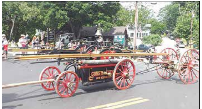
An Old Timer.