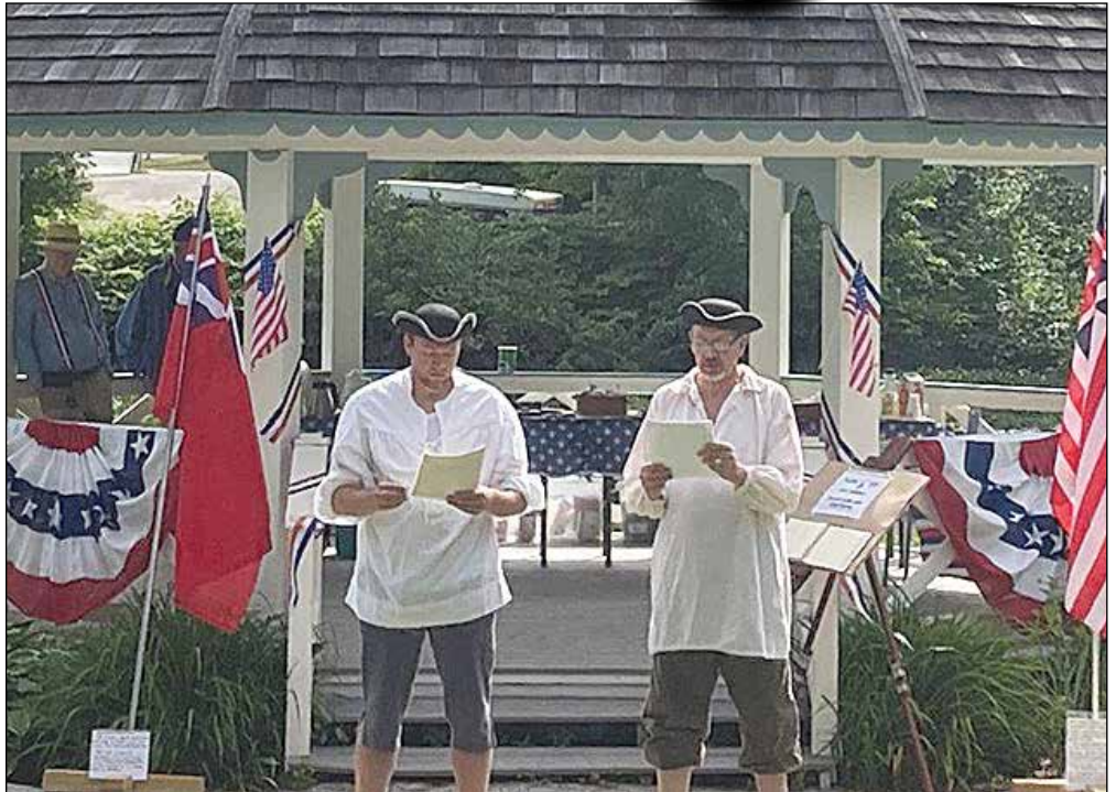
Following a tradition of over 25 years, the Declaration of Independence is recited as part of Antrim's Independence Day Celebration.