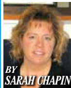
BY SARAH CHAPIN

A new study has found that the antibiotic azithromycin was no more effective than a placebo in preventing symptoms of COVID-19 among non-hospitalized patients, and may increase their chance of hospitalization, despite widespread prescription of the antibiotic for the disease. Azithromycin, a broad-spectrum antibiotic, is widely prescribed as a treatment for COVID-19 in the United States and the rest of the world. The hypothesis is that it has anti-inflammatory properties that may help prevent progression if treated early in the disease, but this was not the case. The study appears in the Journal of the American Medical Association .