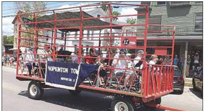
The Hopkinton Town Band.