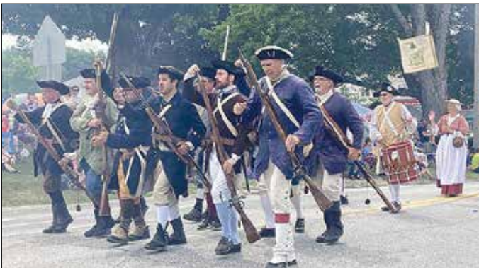
The Revolutionary Guard