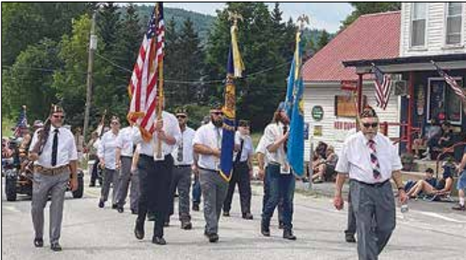
Weare American Legion