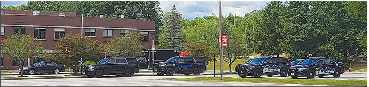
Area Police conducted two full days of active shooter training at Hillsboro-Deering High School. Hillsboro, Deering, Washington, and Antrim Departments participated.