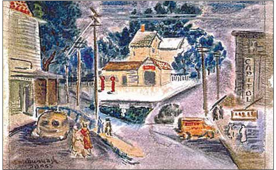
"Village" 1938 W.P.A. watercolor by Nat Burwash showing Central Square in Hillsborough, NH, showing the Socony service station (now the "Volvo Museum") and the old Capitol Theater (which stood between the former location of Mama McDonough's and Tooky Mills).

In a 1987 Messenger interview, Nat explained his organic approach to carving " ... the quality and feel of a piece of wood often determines the form it becomes. Nothing is preconceived, although the grain can have a strong influence." He continued to