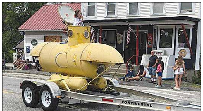
3rd Place Jon Wallace's Yellow Submarine