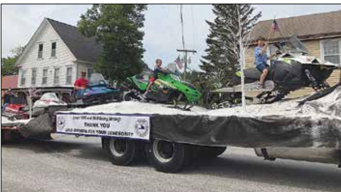
2nd Place Weare Winter Wanderers