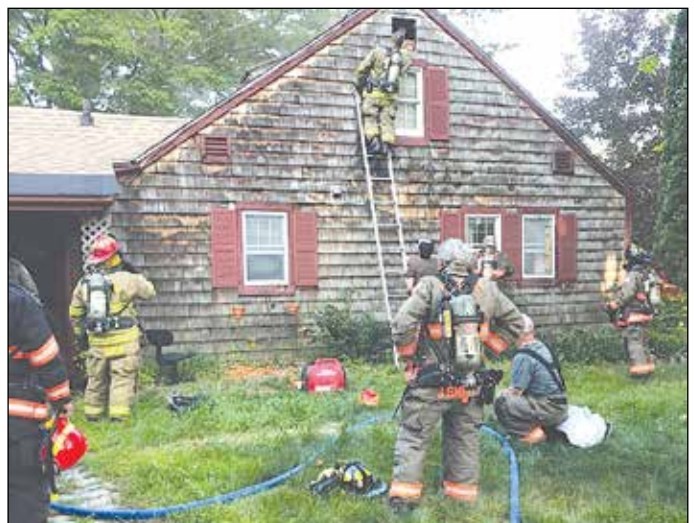
Newbury Fire Rescue Engines 2 & 4, Rescue 1, Tanker 1, a Bradford engine and tanker and a Sutton engine and tanker along with New London Ambulance and Newbury and Bradford Police responded to a house fire on Newell Road, Wednesday evening. The crews were on scene for about two hours. There were no injuries.