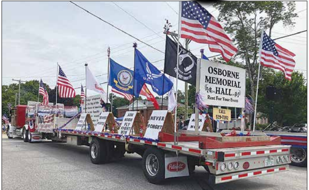
The Town of Weare held its traditional Patriotic Celebration over the weekend. See more photos on page 3.

Lady Diana Spencer marries Prince Charles