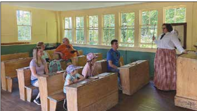
The One Room Schoolhouse