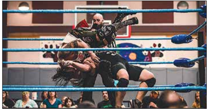
250th's Big Time Wrestling