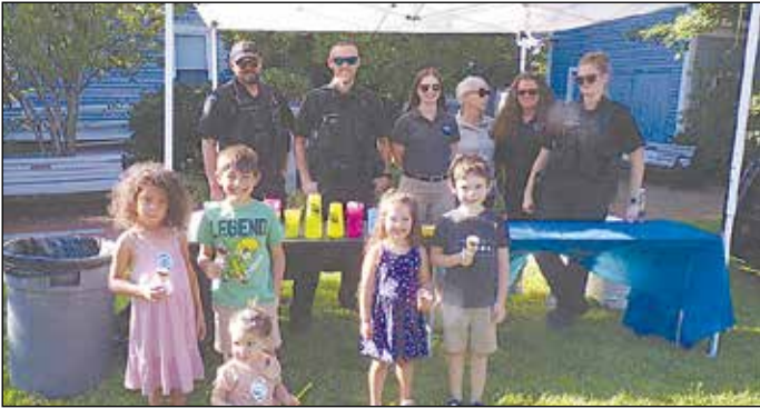
Hillsborough's Cone With A Cop