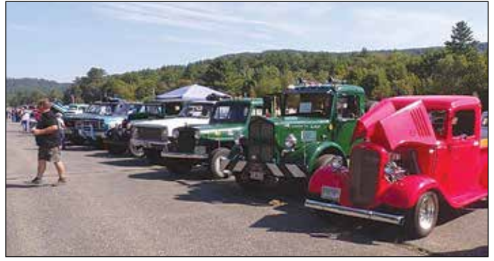
Deering's Antique Truck Show