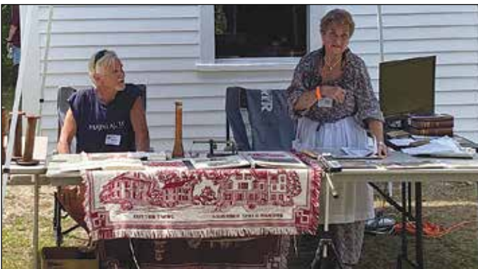
Woolen Mills History