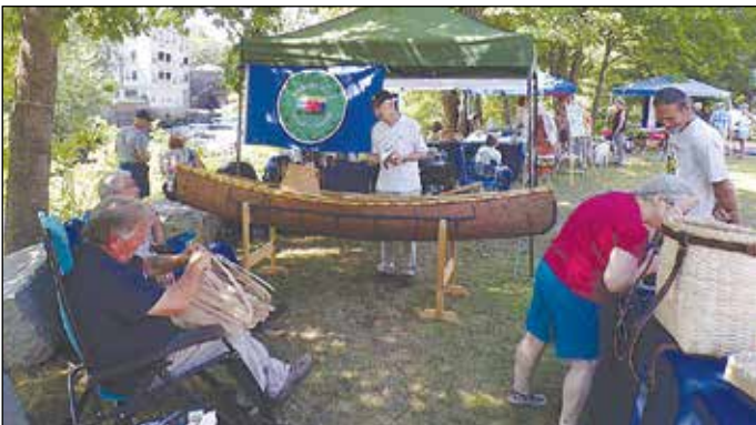
Abenaki Canoe Making