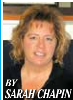
BY SARAH CHAPIN

New findings from a large study led by researchers at Yale Cancer Center shows the addition of the drugs oleclumab or monalizumab to durvalumab improved progression-free survival for patients with locally advanced non-small-cell lung cancer (NSCLC). The data was presented at the annual meeting of the European Society for medical Oncology (ESMO).