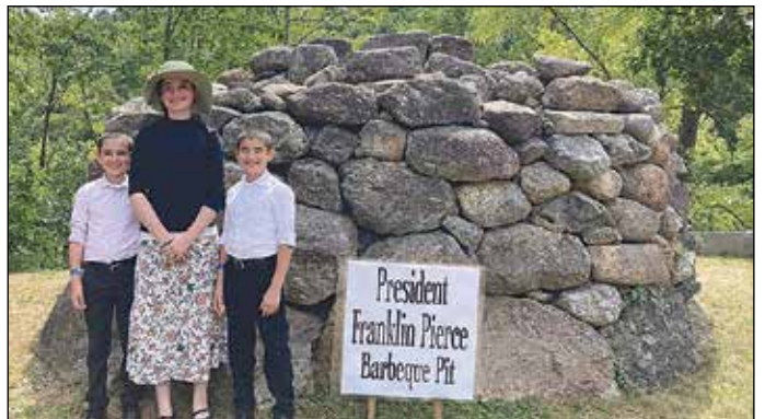
President Pierce Barbeque Pit