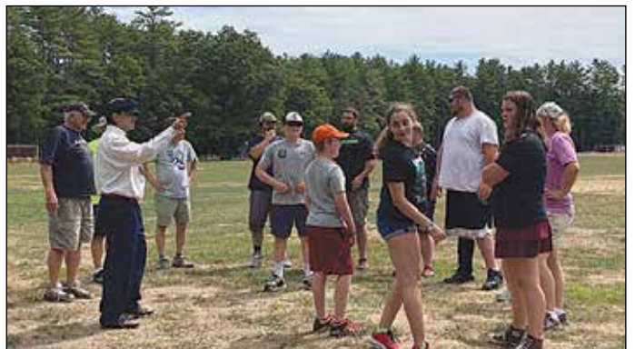
Old Time Baseball