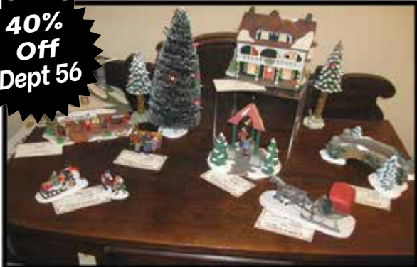
New England Village – Dickens' Village