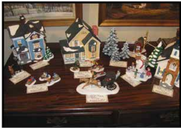
Snow Village – Christmas in the City