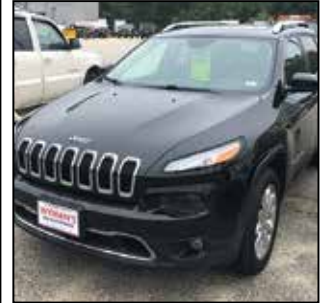
2015 Jeep Cherokee Limited

Exceptional Shape. Includes Sunroof & Leather Interior. Well Maintained. Black Metallic. Stk# 21A38