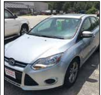
2014 Ford Focus 4 Dr Hatchback SE Pkg

Complete with Sunroof. Fully Equipped. Well Maintained. 79k Miles. Silver. Stk# 21A27