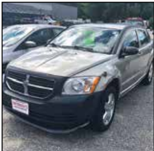
2009 Dodge Caliber 4 Dr Hatchback

4 Cyl. Auto. Air Conditioned. Well Maintained & Ready To Go! Tan w/ Saddle Interior. Stk# 21A37