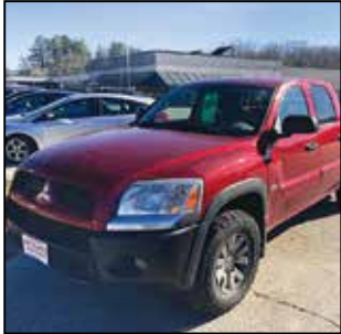
2006 Mitsubishi Raider Duro Cross Double Cab 4x4

Nicely Equipped, Well Maintained. Maroon. Stk# 21A43