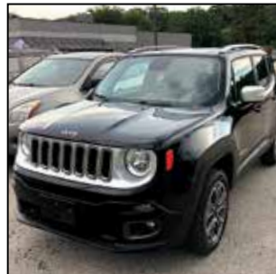
2016 Jeep Renegade Limited

Fully Equipped, Including Sunroof & Leather Interior. Excellent Shape, Well Maintained. Black. Stk# 21A28