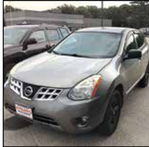
2012 Nissan Rogue 4x4

4 Cyl Automatic, A/C, Gray with Black Cloth Interior. Stk# 21A30