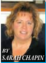
BY SARAH CHAPIN

A new medication has been added to the treatment options for children with moderate-to-severe asthma. In a late-stage clinical trial, the biologic agent dupilumab reduced the rate of severe asthma attacks and improved lung function and asthma control for children ages 6 to 11. The findings, reported in the New England Journal of Medicine , supported approval of dupilumab for the treatment of moderate-to-severe asthma in this age group by the Food and Drug Administration in October 2021.