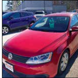
2011 VW Jetta SE 2.5 Sedan

4 Cyl. Auto., A/C, Nicely Equipped, Well Maintained. 115k Miles. Sporty Red. Stk# 21A42