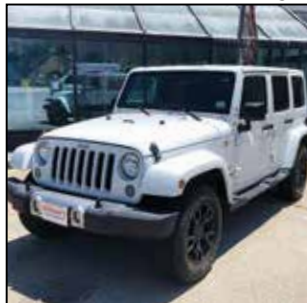
2018 Jeep Wrangler JK Series 4 Door with Sahara Pkg

Absolutely Fully Equipped, Only 35,000 Miles, Full White Body Paint, Clean Inside & Out!