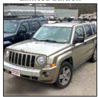
Well Cared For. Excellent Maintenance Record. Tan. Stk# 21A44A