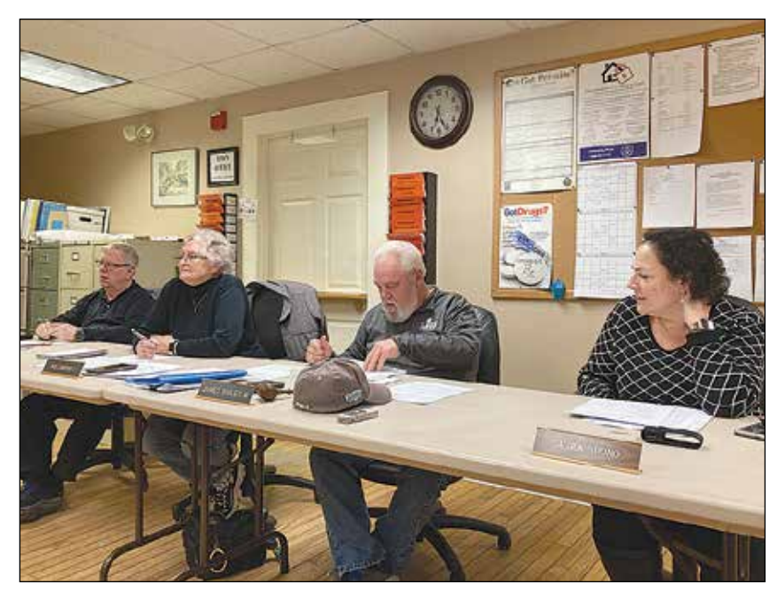
The Hillsborough Select Board conducted a Budget Hearing Tuesday evening.

Accept Old Mill Farm Road, a private road.