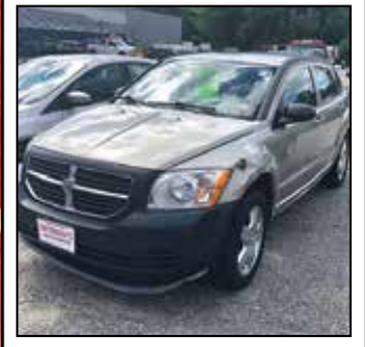
4 Cyl. Auto. Air Conditioned. Well Maintained & Ready To Go! Tan w/ Saddle Interior. Stk# 21A37