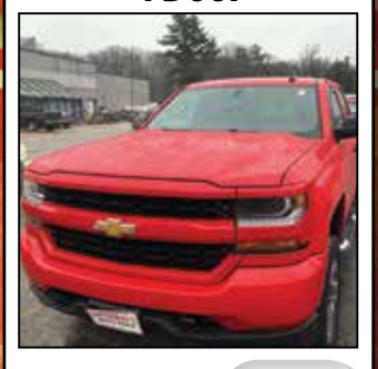
Very Clean and Well Maintained. Red. Stk# 21A45