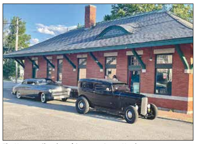
The Newport Chamber of Commerce's new Headquarters.

Bank and Trust. Understanding the valuable work the Newport Chamber provides our community, Bar Harbor donated the building to the Chamber, so we can continue serving and growing our community.