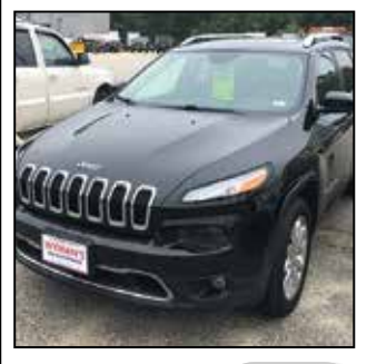
Exceptional Shape. Includes Sunroof & Leather Interior. Well Maintained. Black Metallic. Stk# 21A38