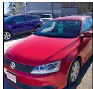
4 Cyl. Auto., A/C, Nicely Equipped, Well Maintained. 115k Miles. Sporty Red. Stk# 21A42