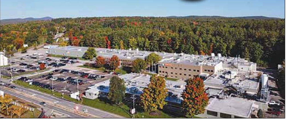
Built for but never occupied as a shoe factory, Sylvania purchased the original building in 1956.