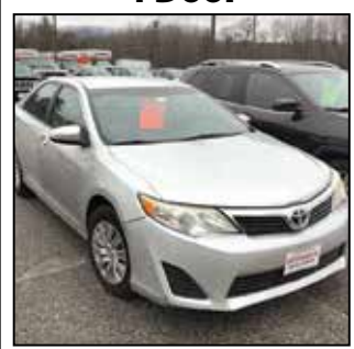
Low Mileage. Auto., A/C, Well Maintained. Silver. Stk# 21A53