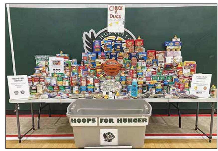
Over the past week, "Hoops for Hunger" collected money and food items at basketball games for the Hopkinton Food Pantry. With generous donations from individuals and businesses, 302 items were collected, and $1538 was raised.

capital reserve fund to come from the unassigned fund balance.