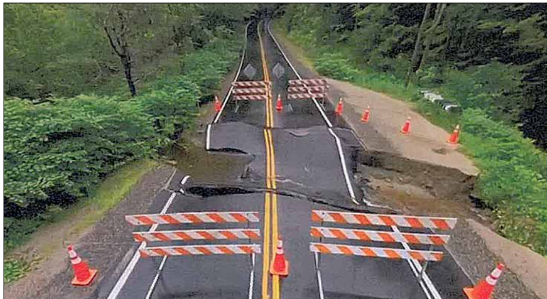
The town of Hillsborough has some road repairs ahead of them. The photo shows rushing water eating away at East Washington Road. Several feet of the road is buckled and impassable. Antrim reported road damage as well on Sunday with multiple road closures around town.

charged with speeding, disobeying a police officer, reckless driving, unsafe passing, operating without a motorcycle license and uninspected motorcycle, according to a news release from state police.