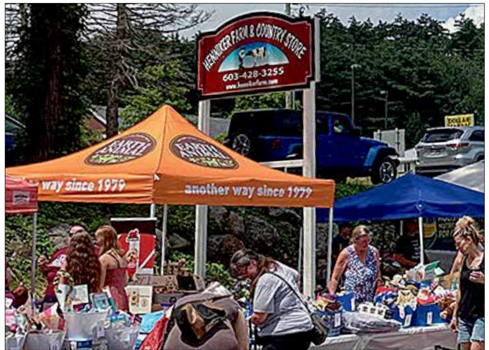
Henniker Farm & Country Store's 20th Anniversary Celebration.