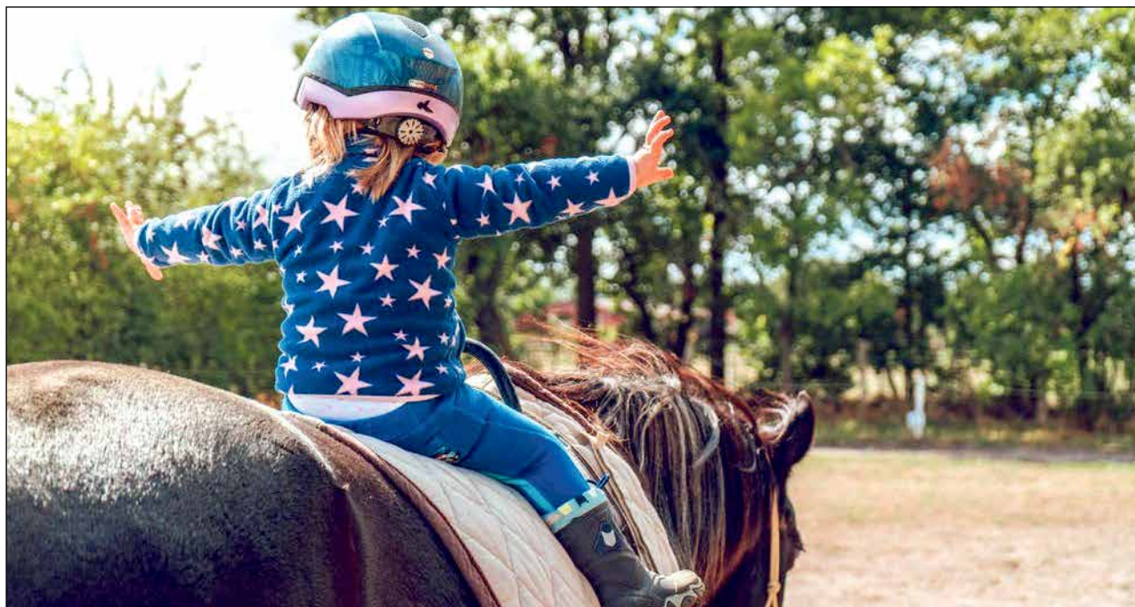
Saving Grace Farm.