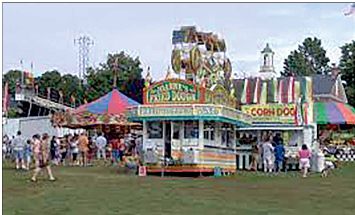
The carnival offerings remain the same.

“The community expressed a desire to know exactly what event proceeds were supporting, and a recommendation was made to use this as an opportunity to highlight an area of