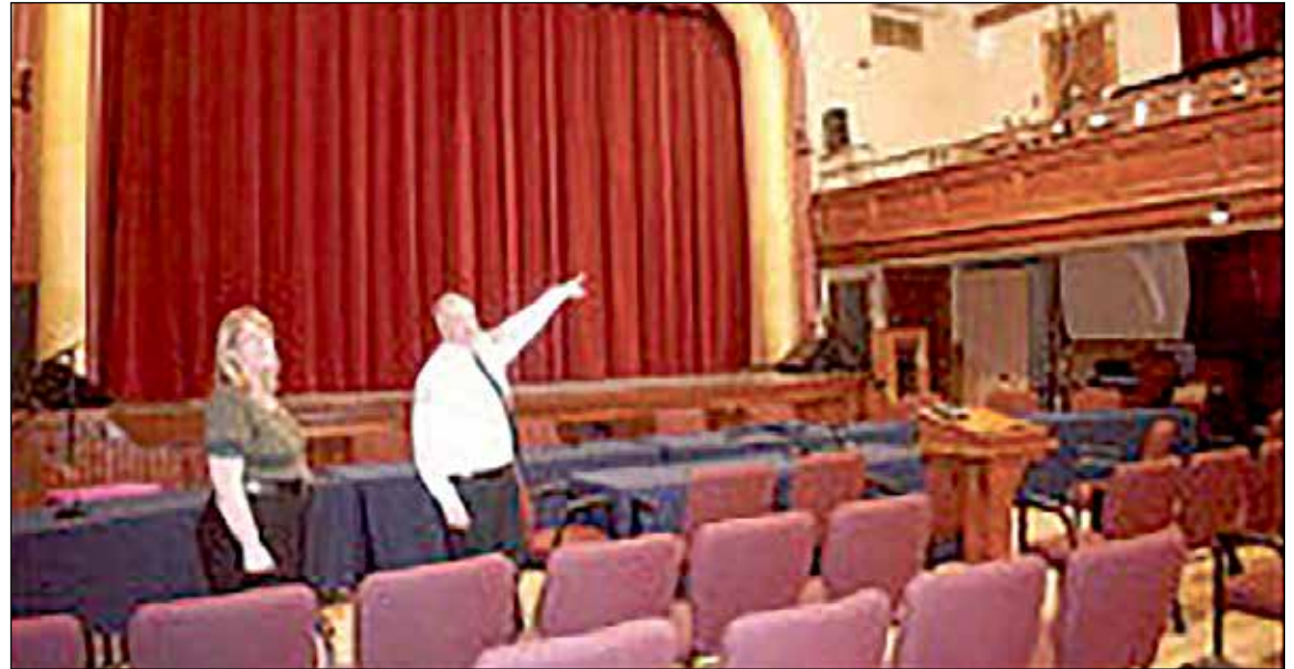
Inside the Franklin Opera House, located within City Hall.

Performances of "Beauty and the Beast" by the Franklin Footlight Theater are still planned for this weekend and next.