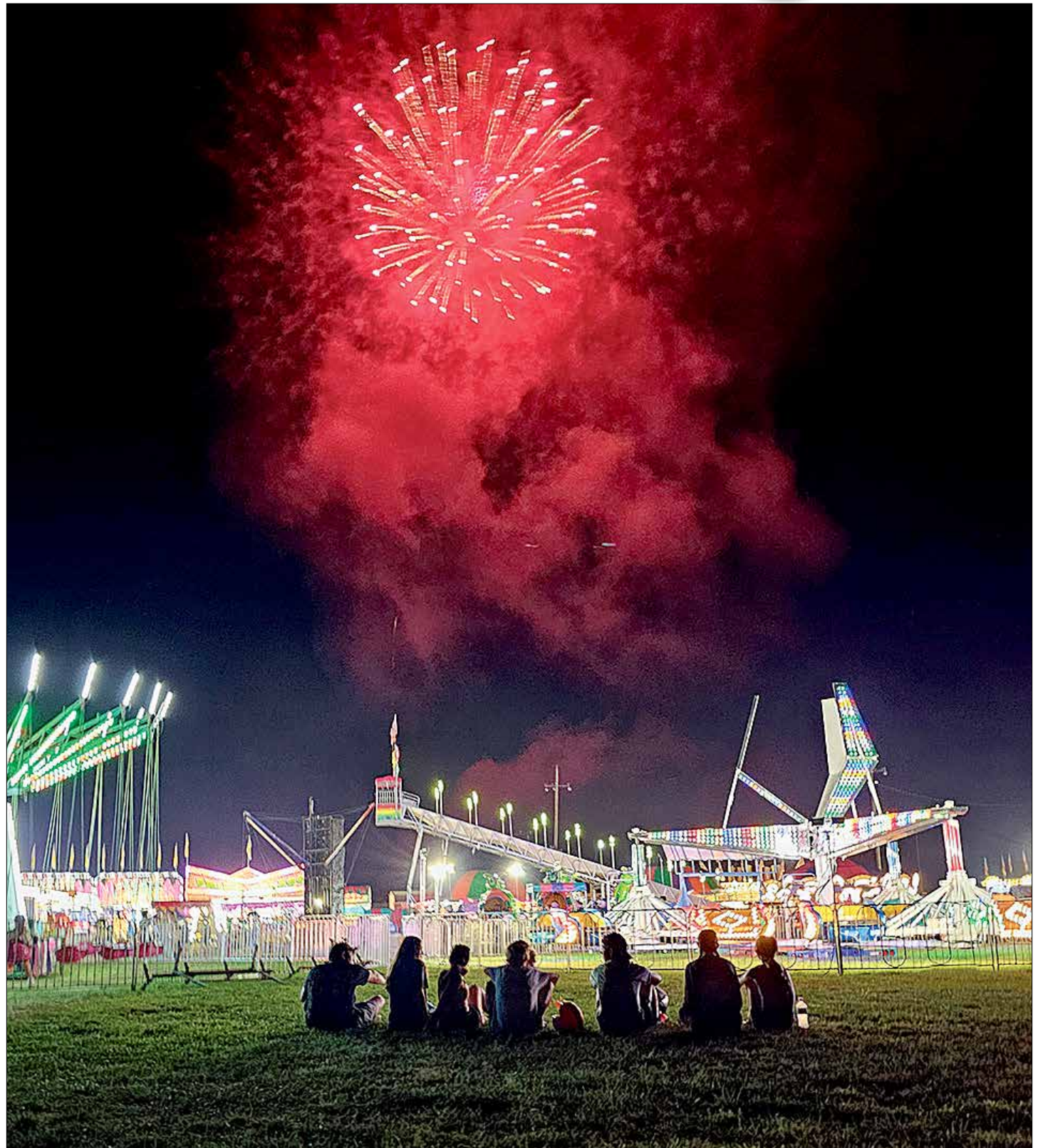
A spectacular fireworks show was a fitting way to end Hillsborough's 2023 rain-shortened Summer Festival.