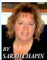
BY SARAH CHAPIN

A six-year study of nearly 100,000 women published in Lancet Global Health has provided new evidence that relatively inexpensive daily diet supplementation of iron, folic acid and vitamin supplementation in pregnancy can reduce complications at birth. Researchers found that iron and folic acid supplementation (IFAS), as well as iron and folic acid plus essential vitamins and trace minerals (multiple micronutrient supplementation, or MMS), are associated with significantly lower rates of babies born at low birthweight and other complications at birth, compared to iron or folic acid alone. For example, the rate of low-birthweight birth was under 10.5 percent for women supplementing their diets with multiple micronutrients, the lowest rate of any comparison group.