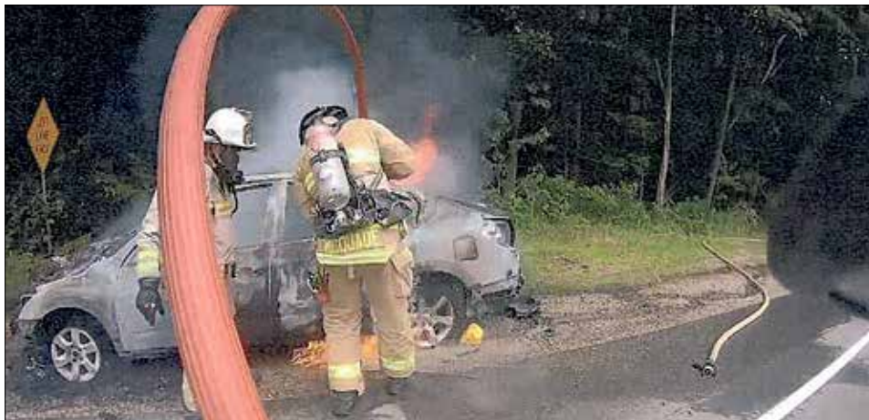
Members extinguished the fire. The occupants of the vehicle escaped unharmed from this incident.