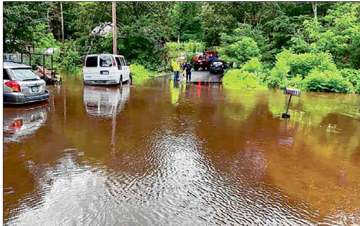
The latest round of storms has hit Antrim hard.

detours on Stacy Hill and Old North Branch Road. Emergency vehicles will also be able to access those streets.