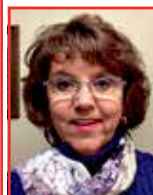
By: Joyce Bosse

For most people, the biggest tax break from owning a home comes from deducting mortgage interest. If you itemize, you can deduct interest on up to $750,000 of debt ($375,000 if married filing separately) used to buy, build or substantially improve your primary home or a single second home. (For pre-2018 mortgages, interest on up to $1 million of debt is deductible.) Improvements are "substantial" if they add value to the home, extend the home's useful life or adapt the home for new uses. Basically, additions and major renovations are "substantial," but basic repairs and maintenance are not.