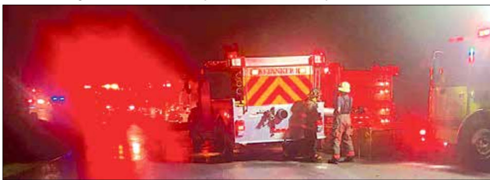
Newbury Engine 2 and Tanker 1, along with apparatus from New London, Wilmot, Bradford and Warner responded to a second alarm building fire on Brown Road, Sutton.