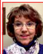
By: Joyce Bosse

What if you rent out a part of your home, such as a room or the basement? You'll owe tax on your rental income, but you can deduct expenses for the rental space. Potentially deductible expenses include insurance, repair and general maintenance costs, real estate taxes, utilities, supplies, and more. You can also deduct depreciation on the part of your house used for rental purposes, and on any furniture or equipment in the rented space. You don't have to itemize to deduct the rental-space expenses on Schedule A, either. Instead, you claim them on Schedule E (Form 1040) and subtract them from your rental income.