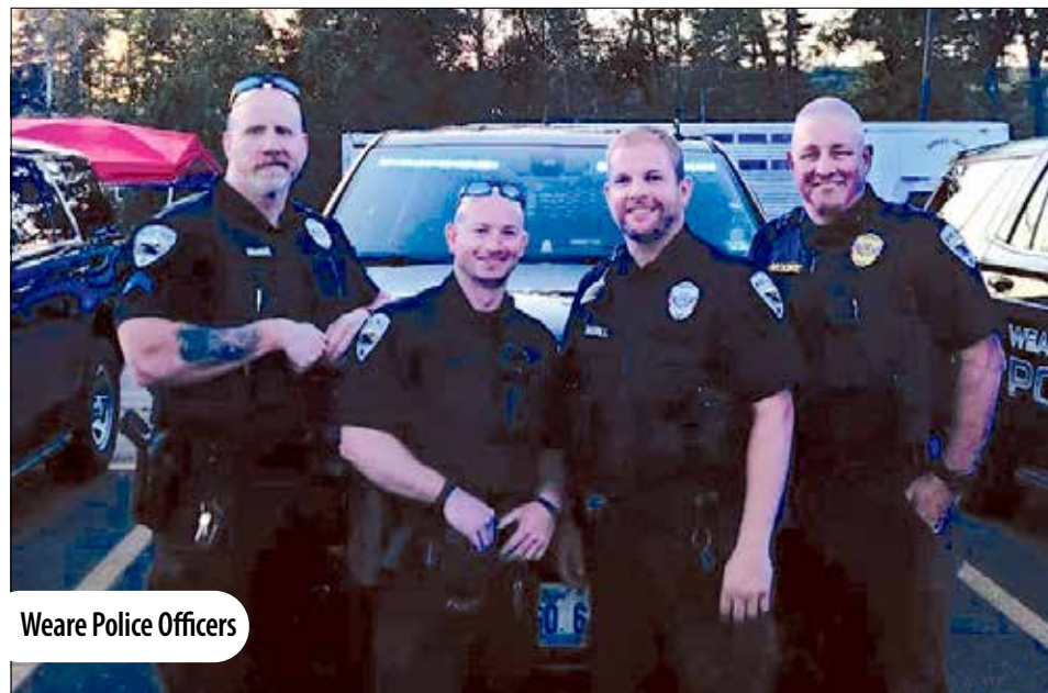
Weare Police Officers