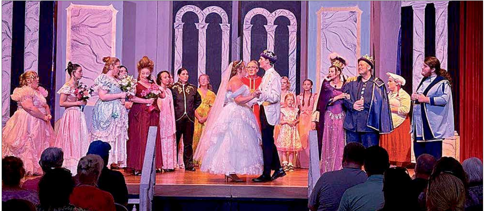
Hillcat Theater presented three performances of Rogers & Hammerstein's Cinderella at the Hillsboro-Deering Middle School to rave reviews.