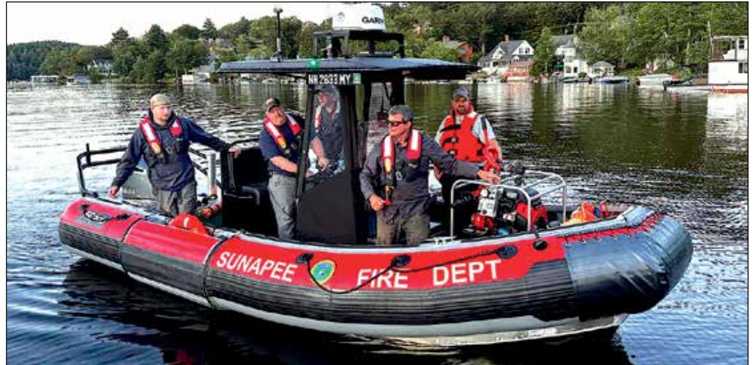
The Sunapee Fire Department conducted Water Rescue Training on Lake Sunapee. Sunapee Fire utilized Boat 1 and Boat 2, along with two "victims," to run through numerous different scenarios.