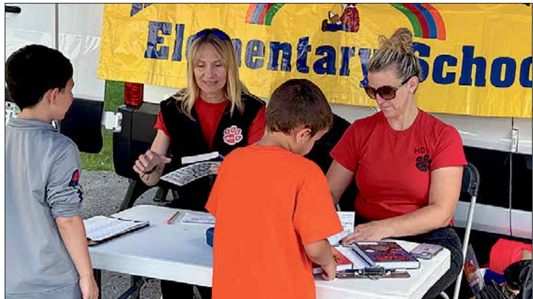
The Hillsboro-Deering Bookmobile was distributing free books around town last week.

passwords of 27 former clients to log into Fidelity brokerage accounts and make trades, causing a lockdown of those accounts.