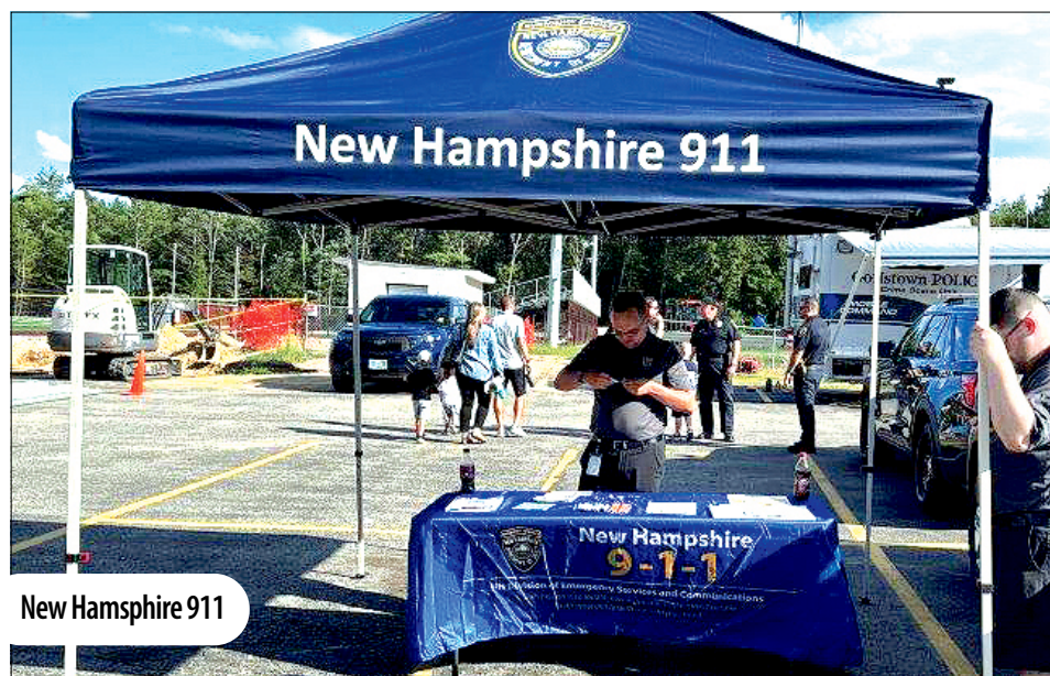
New Hampshire 911