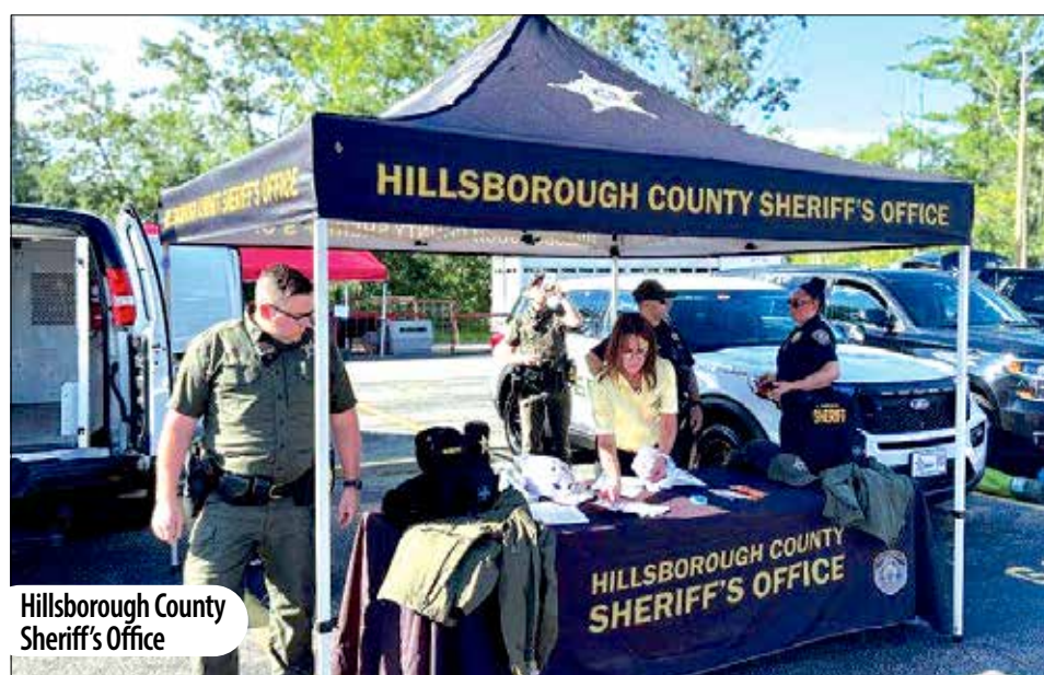
Hillsborough County Sheriff's Office