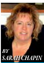
BY SARAH CHAPIN

Pfizer's oral antiviral drug (a combination of nirmatrelvir and ritonavir tablets) is strongly recommended for patients with non-severe covid-19 who are at highest risk of hospitalization, such as unvaccinated, older, or immunosuppressed patients, with lack of vaccination as an additional risk factor to consider, says a WHO Guideline Development Group of international experts in The BMJ . The experts explain that nirmatrelvir/ritonavir likely represents a superior choice for these patients because it may prevent more hospitalizations than the alternatives, has fewer potential negative side effects than the antiviral drug molnupiravir, and is easier to administer than intravenous options such as remdesivir and antibody treatments. However, they recommend against its use in patients at lower risk, as the benefits are trivial. And they make no recommendation for patients with severe or critical covid-19, as there are currently no trial data on nirmatrelvir/ritonavir for this group.