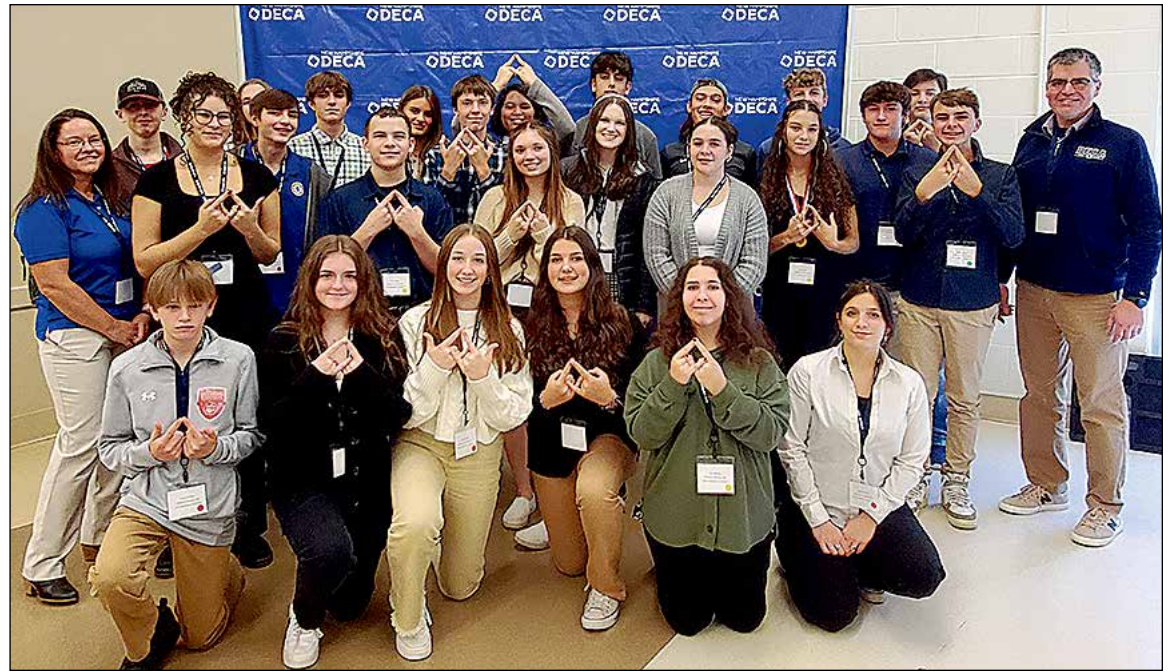
Hillsboro-Deering DECA received International honor.

DECA members participated in the high school open house,