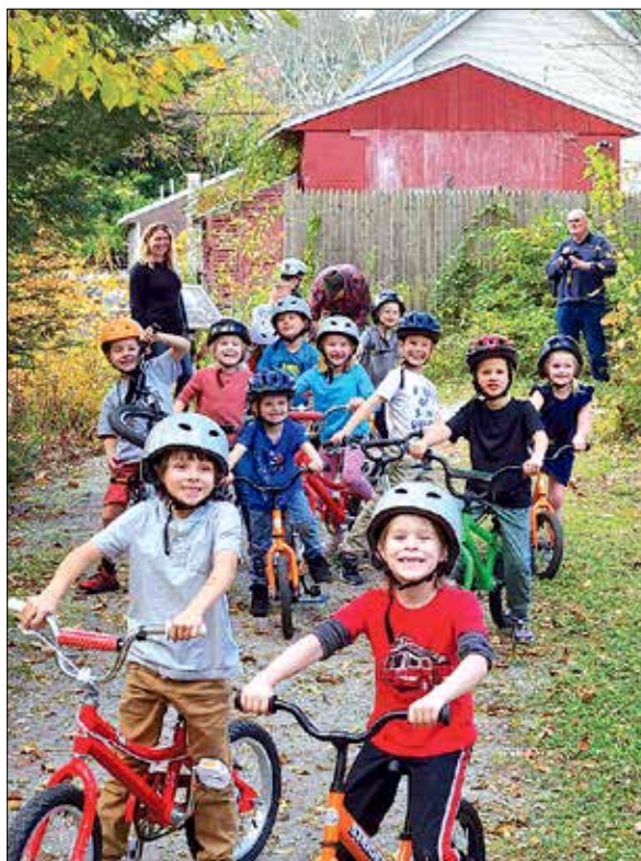
Kearsarge Biking Adventures with Kindergarteners and First Graders.