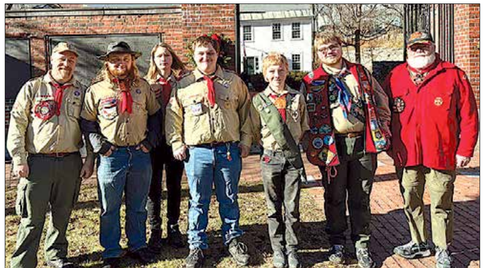
Antrim's Troop 2 participated in the Wreaths Across America program.