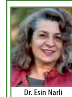
Dr. Esin Narli

Q: What are the bones that make up the mouth? A: Five major bones make up the structure of the mouth. They are the mandible, which is the lower jawbone; the maxilla, the two bones of the upper jaw, and two bones called palatal bones that form the roof of the mouth.