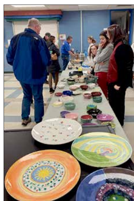
The Empty bowls event was a huge success at KRHS! Ms. Balla's art students did an amazing job at creating beautiful bowls! Chef Ross's culinary and pastry students created decadent soups and yummy rolls. They sold out of almost everything and raised over $600.