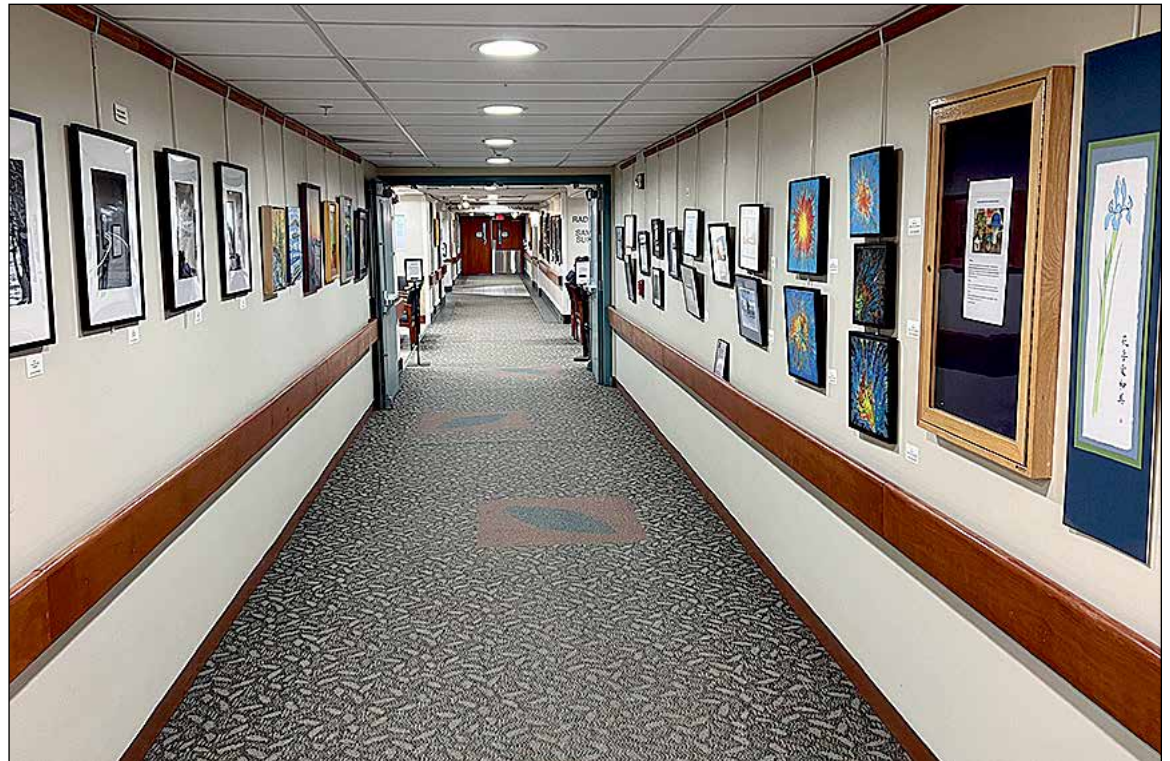
New London Hospital's Gallery.