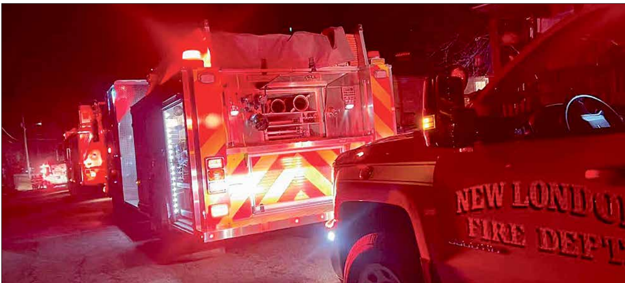
At 3:35 a.m., the New London Fire Department was requested to respond with their cascade air trailer to 24 Parkview Road in Newport, NH for a first alarm building fire. New London crews also assisted with overhaul operations while on scene. New London Firefighters were back in town and in service by 5:30 a.m.

Uplift Local Farmers, Food Producers And Makers This Holiday Season By Shopping And Eating Local!