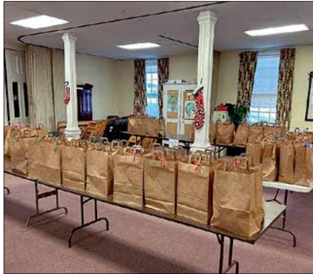
A SPECIAL TOWN: Operation Christmas (left photo) collected, packaged and delivered 67 bags of toys bringing Christmas cheer to less fortunate children, while the Hillsboro Lions Club (right photo) purchased, packaged and distributed Christmas Dinners for 62 families, feeding 196 people. Thanks to all who contributed to these worthwhile projects.