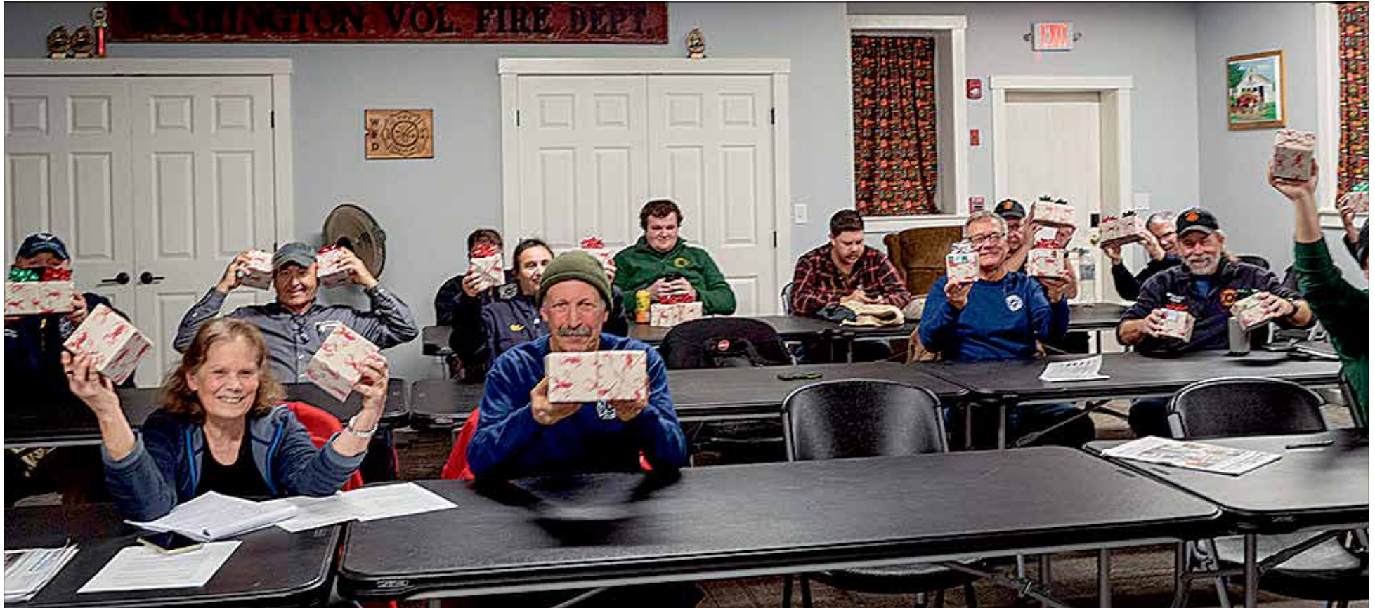
Annual Washington Fire and EMS Christmas party after the monthly meeting. Everyone received gifts, but the highlight was the chili competition.