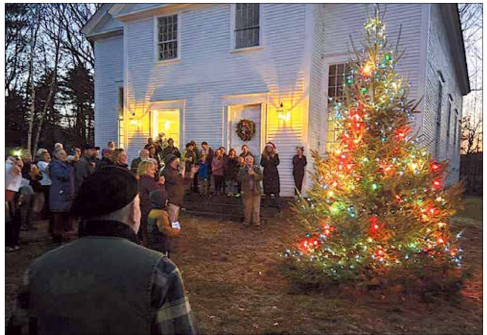
Tree Lighting at Deering's Historic East Deering Church.