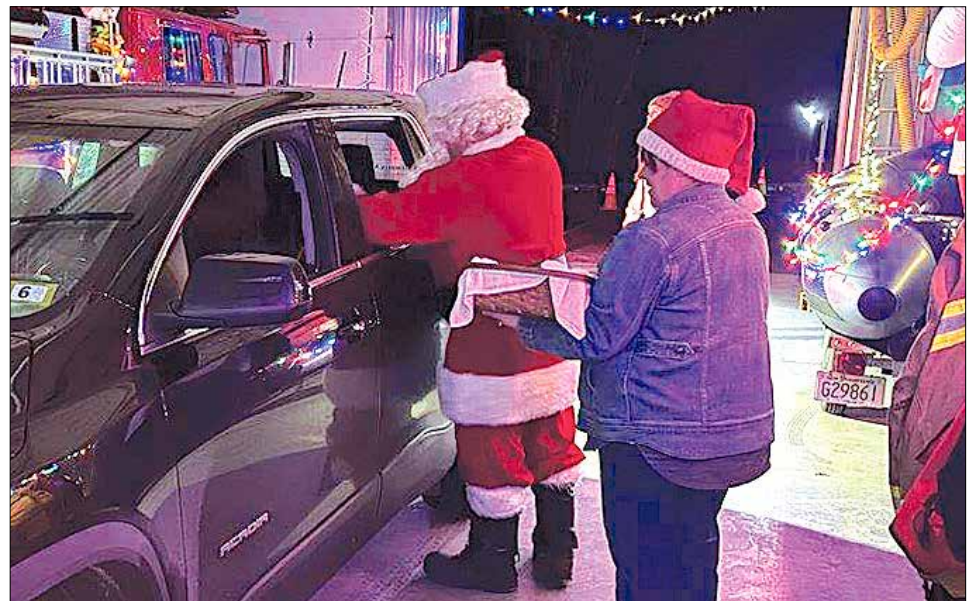
Washington Fire Department's Drive Thru Santa.