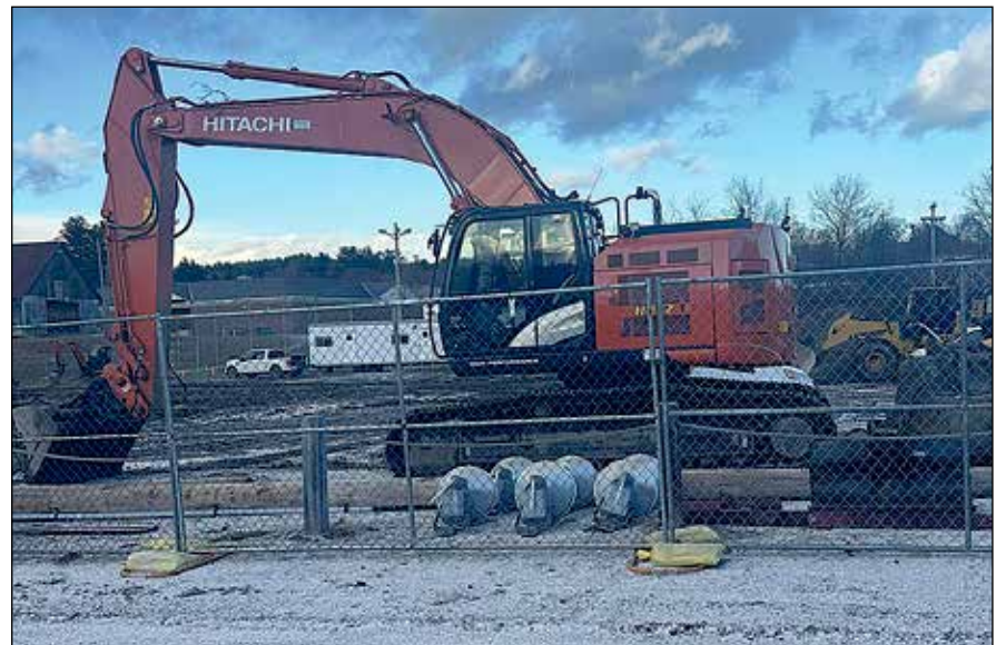
Breaking ground for Newport's wonderful new Community Center. A game changer for the Sunshine Town. Newport is on the move!