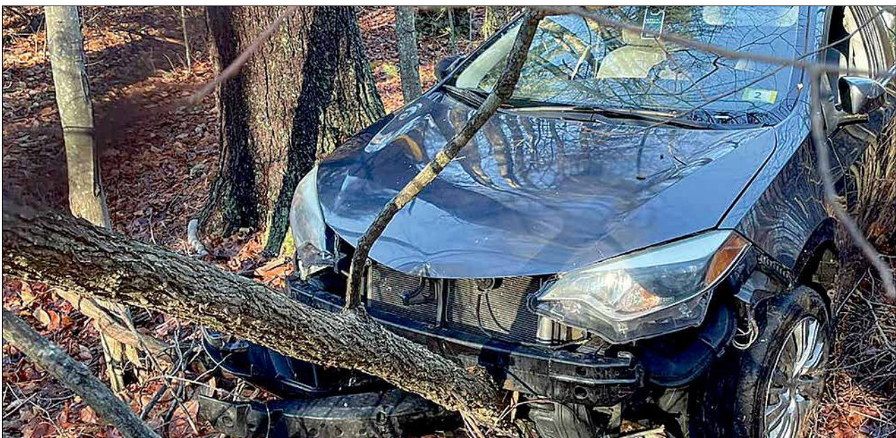
Dunbarton Police Department was dispatched to Twist Hill Road in the area of Ordway Road for a motor vehicle collision with reported entrapment. Upon arriving on scene, the operator, an adult female from Concord, was already out of the vehicle thanks to the help of a Good Samaritan. Police learned that the vehicle was traveling southerly on Twist Hill Road when it experienced an apparent mechanical issue, causing the operator to lose control and veer off the roadway and down an embankment, wedging the vehicle between several trees.