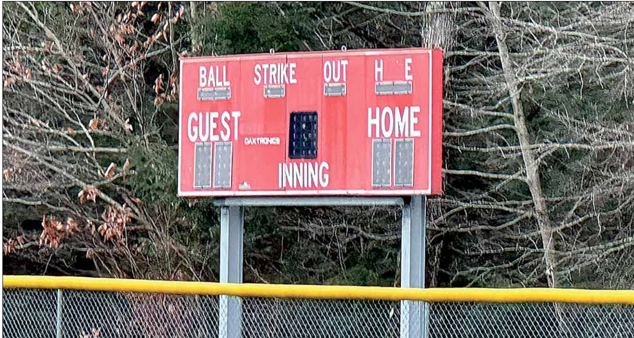
Thanks to several generous donations and volunteers, New Boston's baseball field now has a beautiful new-to-New Boston score board!