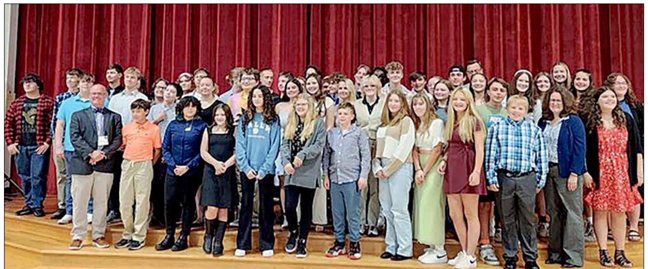
The Superintendent's Club at Hillsboro-Deering.