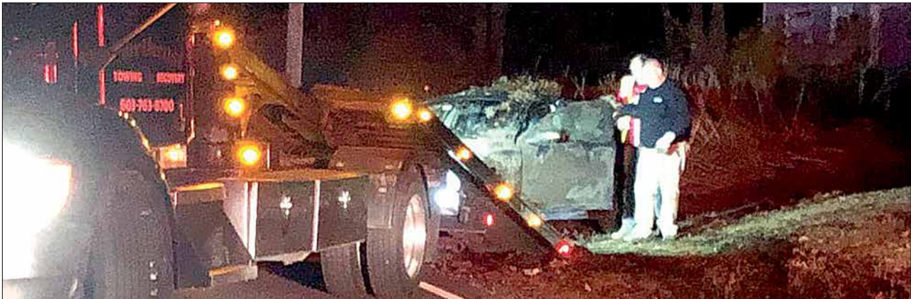
Newbury Fire Rescue Rescue Car 1 and Rescue 1, along with Newbury and New London Police responded to a single vehicle crash Monday evening on Route 103A near Baker Hill Road. The driver was not injured, responders stood by until the car was towed away.