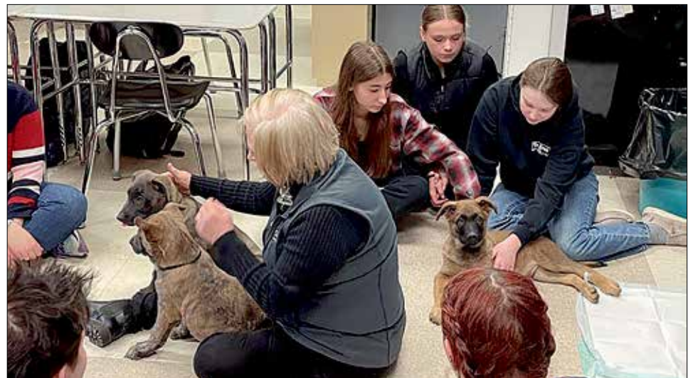
Newport’s Animal & Plant Sciences program had their first opportunity to work with and study a group of playful German Shepherd puppies! The dogs will be able to visit classes as they continue to grow.