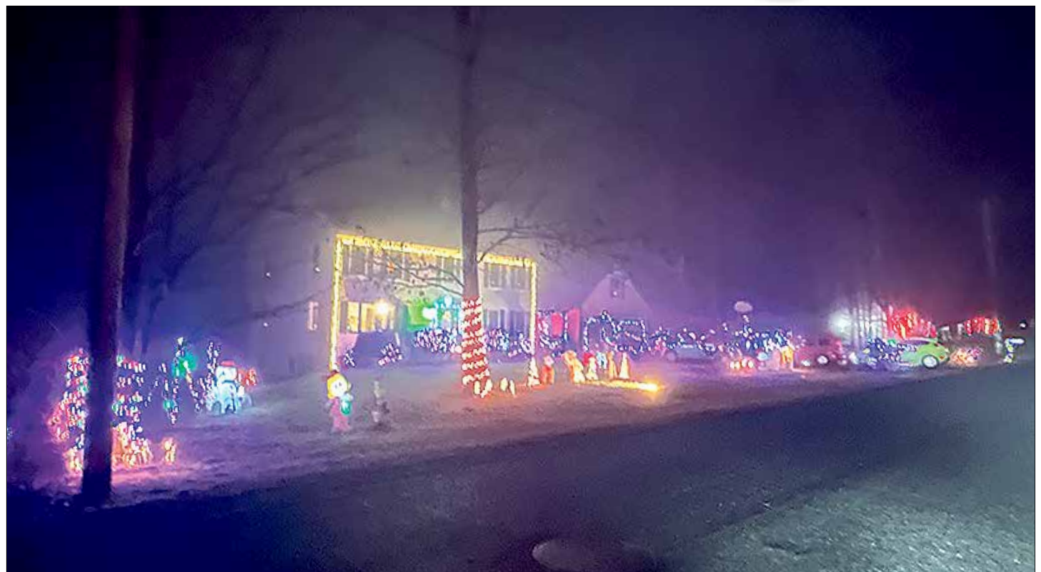
Winner of the Hillsborough Chamber's Holiday Decorating Contest: 27 Washington Circle.