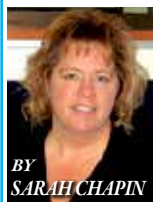
BY SARAH CHAPIN

The U.S. Food and Drug Administration has approved Tzield (teplizumab-mzwv) injection to delay the onset of stage 3 type 1 diabetes in adults and pediatric patients 8 years and older who currently have stage 2 type 1 diabetes. Type 1 diabetes is a disease that occurs when the immune system attacks and destroys the cells that make insulin. People with a type 1 diabetes diagnosis have increased glucose that requires insulin shots (or wearing an insulin pump) to survive and must check their blood sugar levels regularly throughout the day. Although it can appear at any age, type 1 diabetes is usually diagnosed in children and young adults. A person is at higher risk for type 1 diabetes if they have a parent, brother or sister with type 1 diabetes, although most patients with type 1 diabetes do not have a family history.