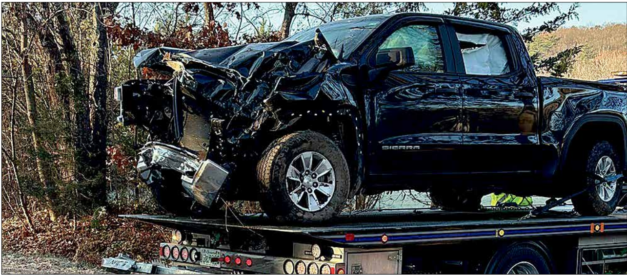
River Road was closed for a little while near Dearhaven and should be back open. The utility company was needed on scene to replace a pole for a little while. Is anyone missing a truck? The driver was nowhere to be found.

Uplift Local Farmers, Food Producers and Makers by Shopping and Eating Local!