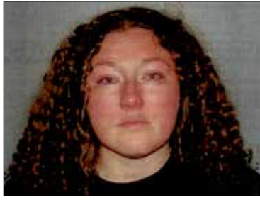
A police officer from the Lakes Region has a date in court

next month on a drunken driving charge after a crash in the parking lot of Bank of NH Pavilion in Gilford in late May.