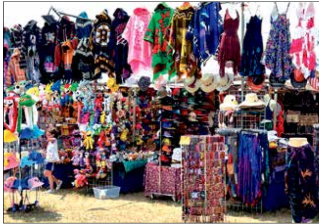
Crafts & Gifts