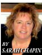
BY SARAH CHAPIN

Survival rates for men with metastatic prostate cancer have increased by an average of six months, something which coincides with the gradual introduction of 'dual treatment' since 2016. This is according to a register study of all Swedish men diagnosed between 2008 and 2020. The results are published in the medical journal JAMA Network Open . Dual treatment means that patients receive both standard hormone therapy (GnRH therapy) and chemotherapy or androgen receptor blockers. Research has previously shown that men receiving this treatment live approximately one year longer than those receiving GnRH treatment alone.