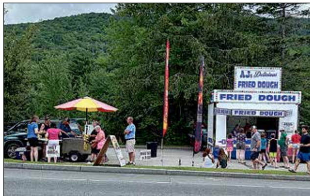
Hot Dogs & Fried Dough