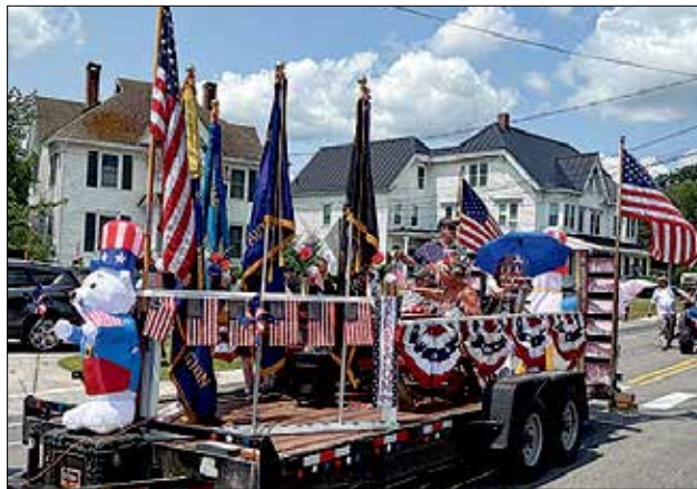
2nd Place American Legion