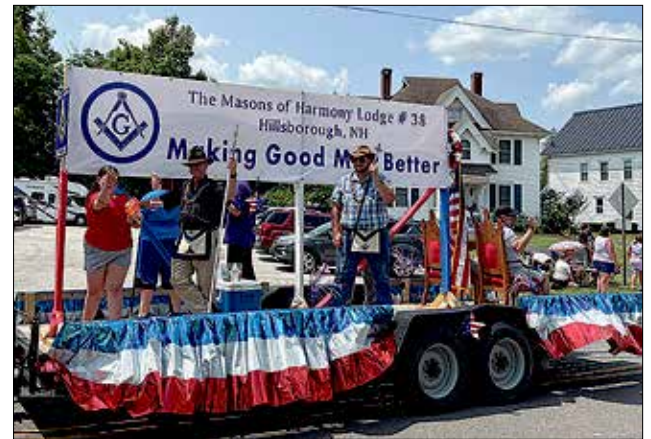
3rd Place Harmony Lodge #38