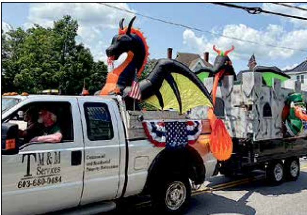
1st Place Hillsborough Chamber