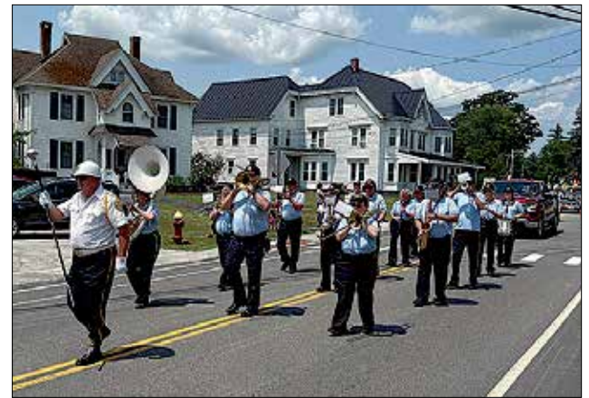
Keene Legion Band