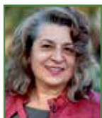
Dr. Esin Narli

Bacteria can live in your mouth in the form of plaque, causing cavities and gingivitis, which can lead to periodontal (gum) disease. In order to keep your mouth clean, you must practice good oral hygiene every day.