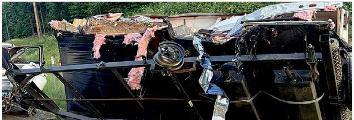
Route 114 in Henniker was closed while crews worked to clean up a two car accident with a pull behind camper, near All-In-One market. No one was injured in this accident.