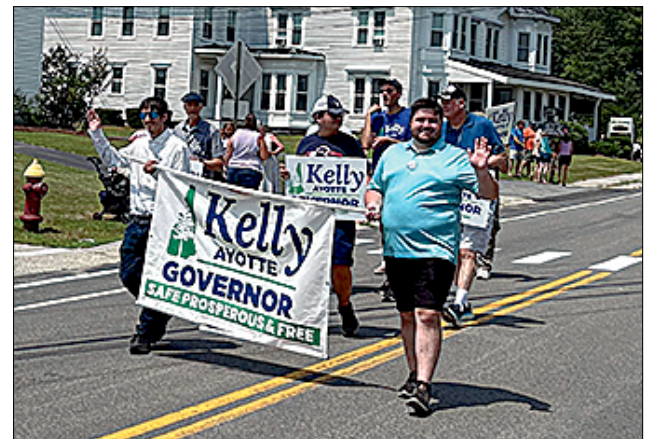
Kelly Ayotte For Governor