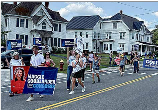
Democrats For Congress